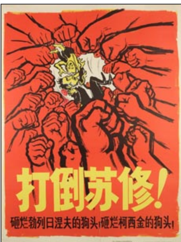
Defeat Soviet Revisionism! 1967