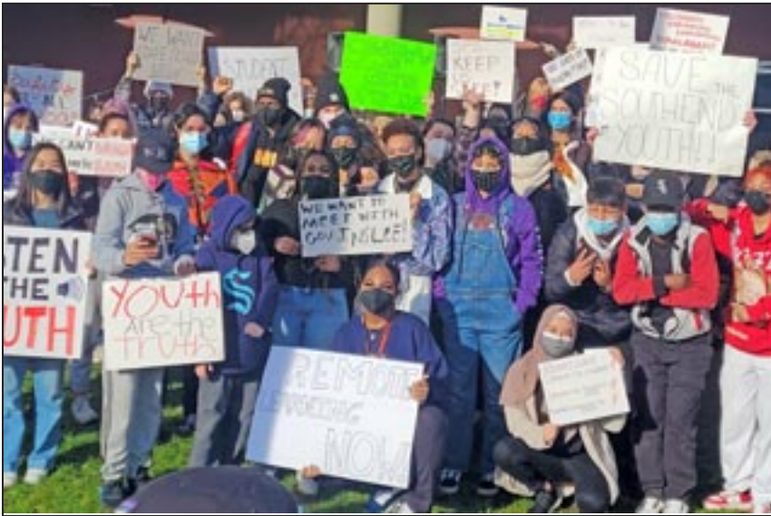
Seattle (USA) January 2022: High School Students walk out demanding Covid protections

Discussions like the one with Latricia, Alex and the other students are a start. We need to invite them to read and discuss Red Flag (including our articles on the pandemic) and to join ICWP. They can be future leaders of communist class struggle, like walkouts in their own school, and in building the revolutionary movement we need.