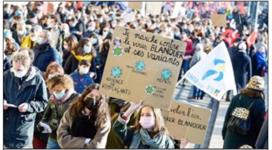
Paris (France) January 2022: Teachers march against the “Blanquer virus” (Blanquer is the French Minister of Education) demanding respect and support as part of a one-day national strike.

And that’s true. There were a record number of official strikes and wildcats (unofficial strikes) in the US and many other places last year. There is a lot of anger about the way the system