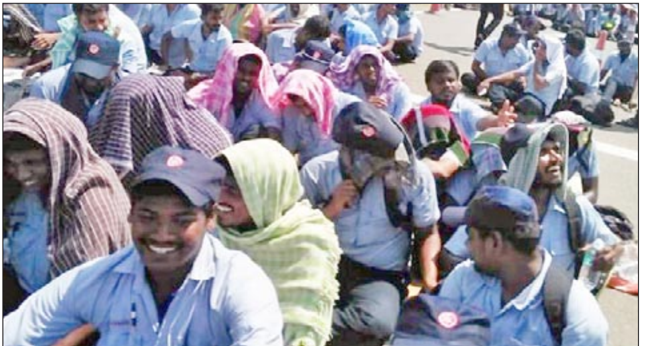
Autoworkers on strike in Chennai, India, 2018