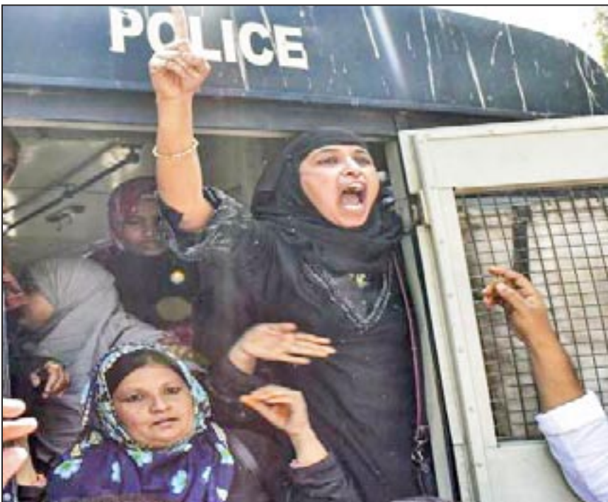
Karnataka, India, Feb 9 -- Students and teachers protest exclusion of women wearing hijab from educational institutions

We need to fight for communism, the only solution to end all the backward elements that wage slavery has introduced. We are ready to face these challenges by recruiting more and more of our working class. Future articles will describe specific issues in schools and factories we are using to spread communism and reject racist/casteist divisions.