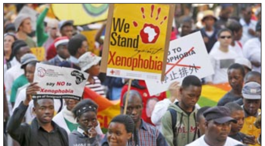
Johannesburg, South Africa, 2015

For us to liberate the working-class worldwide, we must build ICWP everywhere and take on the bosses’ racism with communist solutions.