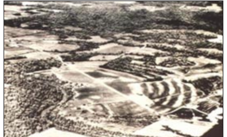
Indigenous forager people built huge earthworks at Poverty Point (USA) some 3500 years ago. Similar prehistoric urban centers also existed in Japan and elsewhere.

But we’re finding in the book a liberatory narrative of human possibilities for social organization. As our discussions continue, we’ll have more to say about ICWP’s vision and plans for communism.