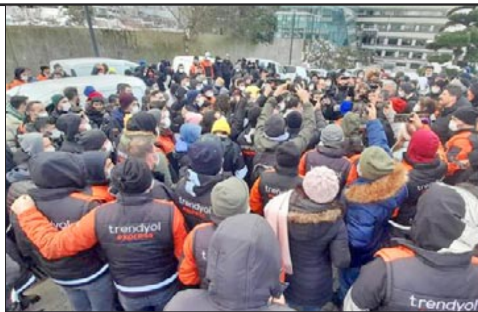
February 4—Workers for Trendyol, a huge Turkish e-commerce outfit, got a 38% pay increase following a strike—but the inflation rate is close to 50%. Protests spread to other e-commerce companies, to factory workers and to journalists.

“We must give the vision to other workers, through Red Flag ,” F urged, “of a communist world without markets and without money” (and so without inflation). “And we must show the