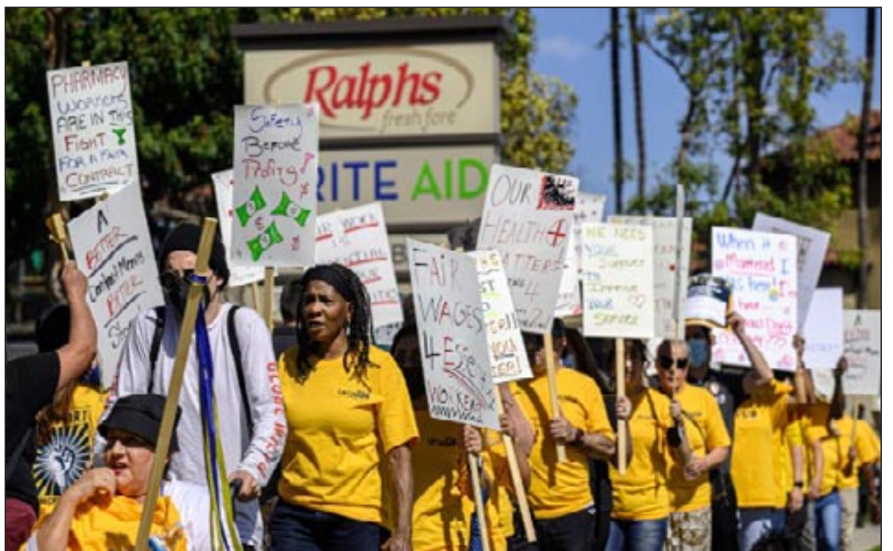
Southern California (USA), Feb. 28—Unionized workers picket supermarkets ahead of a possible March strike. Seventy-five percent of Kroger workers report being food insecure, 14% have been homeless, and 63% can’t afford basic monthly expenses. Unions can’t end this vicious capitalist system where even grocery workers go hungry! Let’s take Red Flag to workers fighting back and show the communist alternative.

is available at icwpredflag.org/sxse.pdf