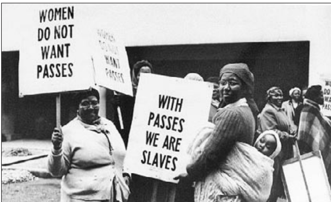
South Africa 1956 Women leading the struggle against apartheid pass laws.

Long live international working-class unity! Long live ICWP!