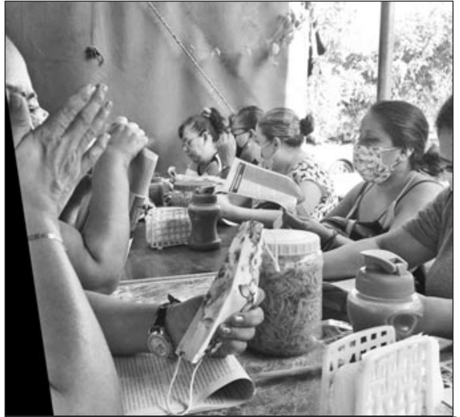
Maquila workers celebrate International Working Women's Day with Red Flag

The action was successful because we distributed all 450 leaflets, which were not enough. The