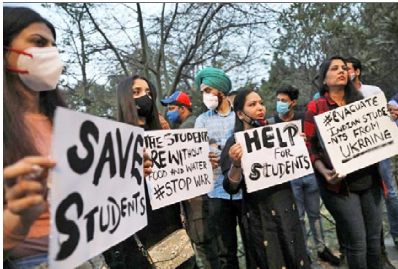
New Delhi (India), Feb. 25 - outside Russian Embassy

But they are also sowing the seeds of their own destruction. The working class has resilience, patience, and the necessity to end capitalism. We must urgently organize workers, students, and soldiers everywhere who are crying out for direction. We must lead them to communist victory.