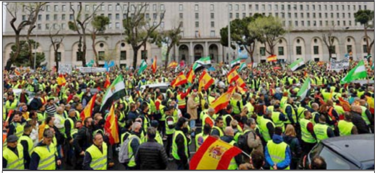
MADRID, Spain March 25, 2022: Truckers strike over high gas prices

In these discussions, we talked about why this type of situation happened and we mentioned that the nature of capitalism is to exploit workers to get profits. As a result of their drive for profit, they wage wars to control resources, factories, and workers' labor power. Wars in which only