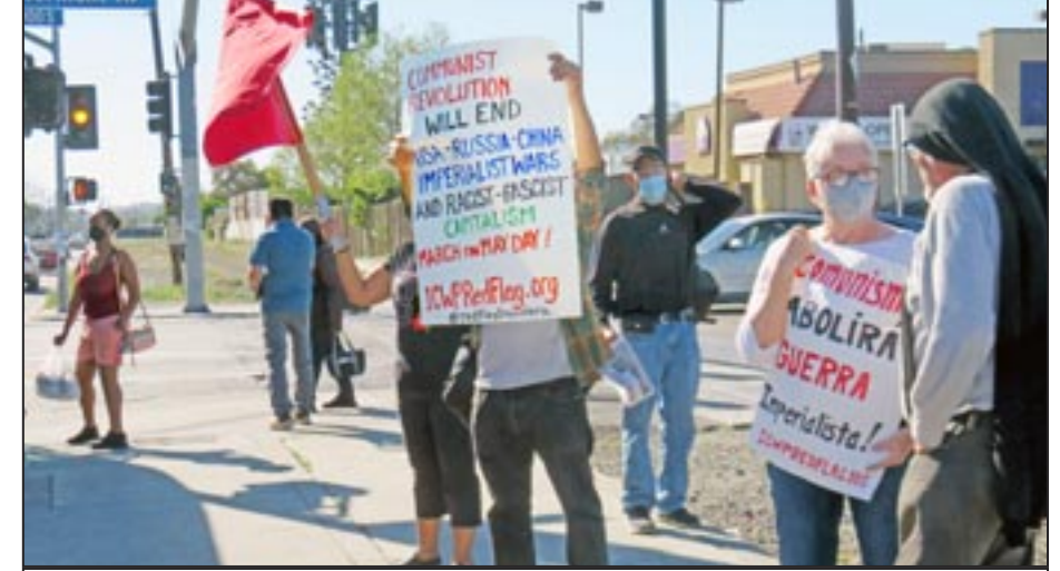
LOS ANGELES (US) Comrades take Red Flag to the masses, organizing for a communist May Day.

At the end of this lively communist forum, a comrade called for preparing our coworkers, friends, and family to participate with ICWP in May Day activities, bringing our communist ideas to the masses.