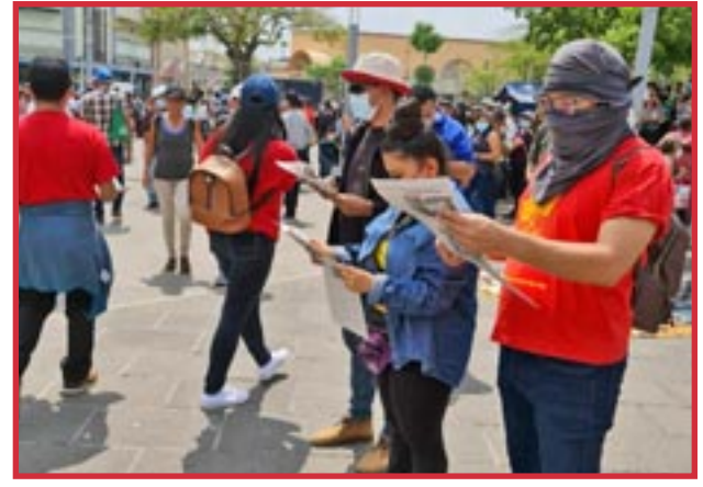
EL SALVADOR, page 4