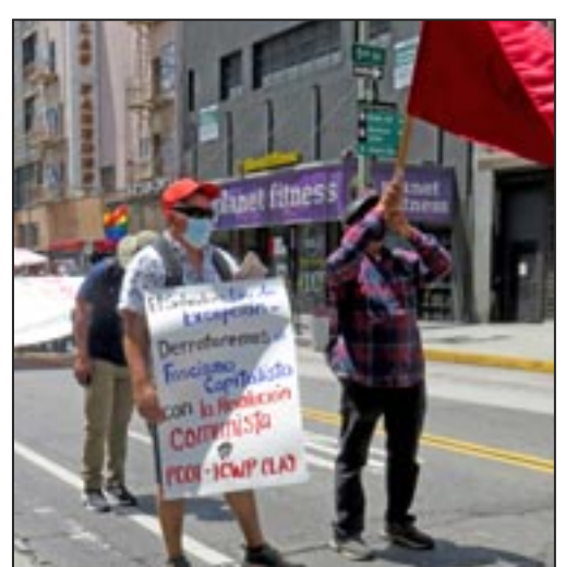
Los Angeles: El Salvador Law of Exception— We will destroy capitalist fascism with communist revolution ICWP

"I helped to distribute Red Flag," he continued, "and met so many wonderful people who gladly took the paper, made donations to cover printing costs, and were interested in learning more about our communist ideas. They wanted to know what we had to say about our current situation and what a communist future could be like. I exchanged contact information with a few people and look forward to meeting with them soon!