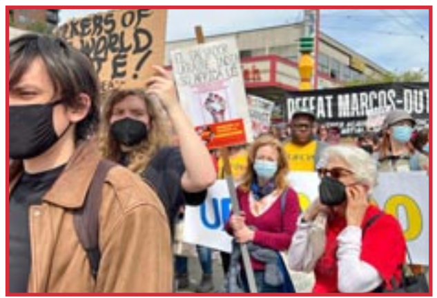
SEATTLE (USA), page 3