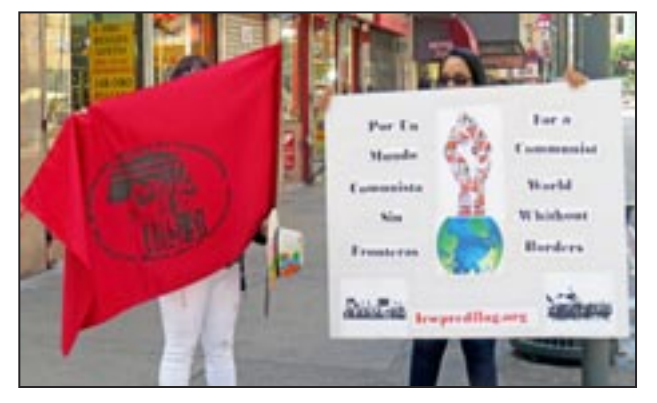
Read our pamphlet: FIGHT FOR THE DAY WHEN NO WORKER WILL BE CALLED FOREIGNER

We must take base-building seriously, using the contacts we make as a springboard for further meetings and discussions. Seeing so many young people in the streets and open to communism, a potential generation of new leaders, increases the enthusiasm of long-time Party members and friends. We really do have a world to win!