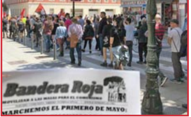
SPAIN, page 6