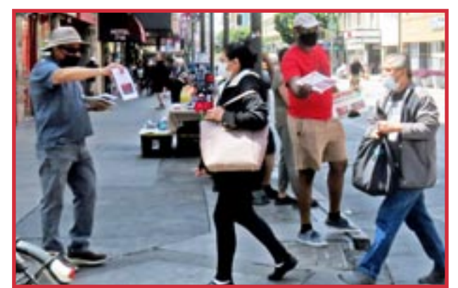
LOS ANGELES (USA), page 3

THE INTERNATIONAL COMMUNIST WORKERS' PARTY * WWW.ICWPREDFLAG.ORG