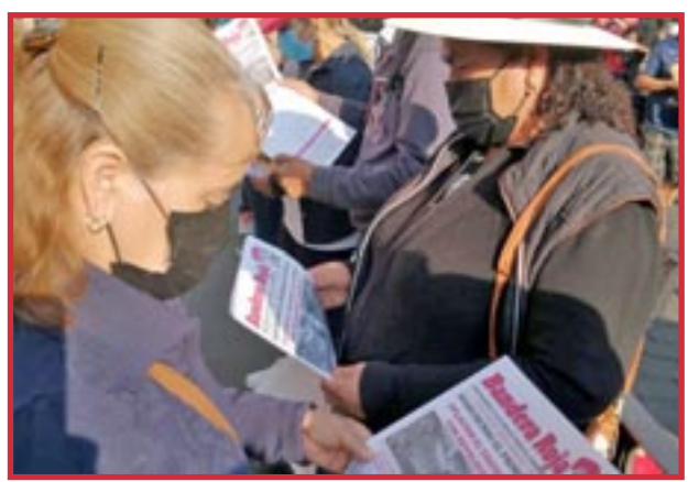
MEXICO, page 6