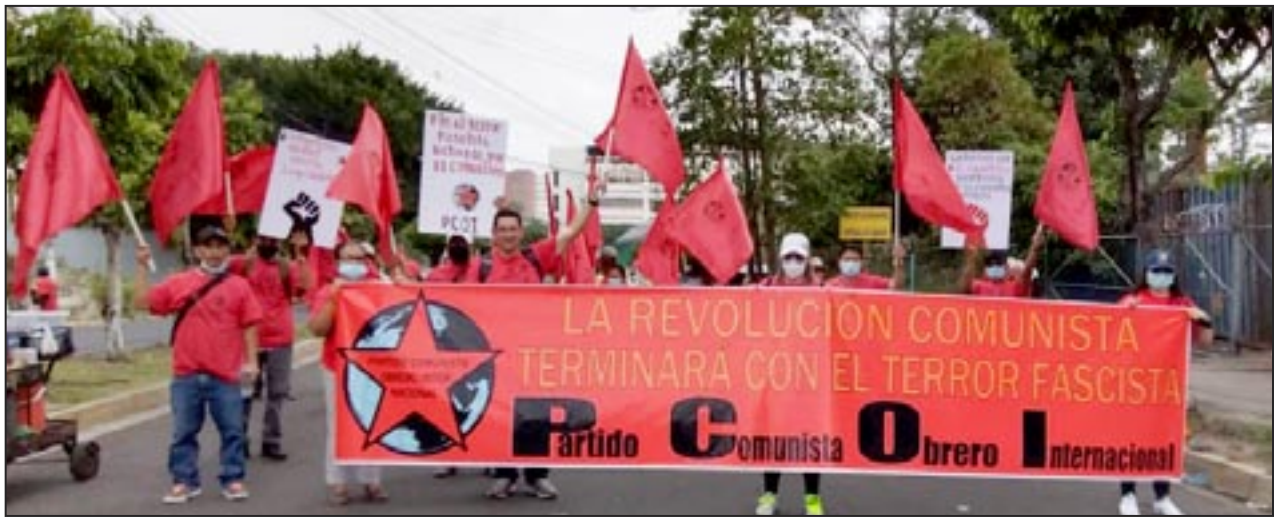
May Day El Salvador 2022: Communist Revolution Will End Fascist Terror

Now we gather again, around 8 to 19 people every Sunday. I also share the newspaper with two friends, I give them a newspaper and they share the reading. I have also managed to contact a doctor friend who had lost contact due to the pandemic and today we are meeting again. I sent him the newspaper with another person.