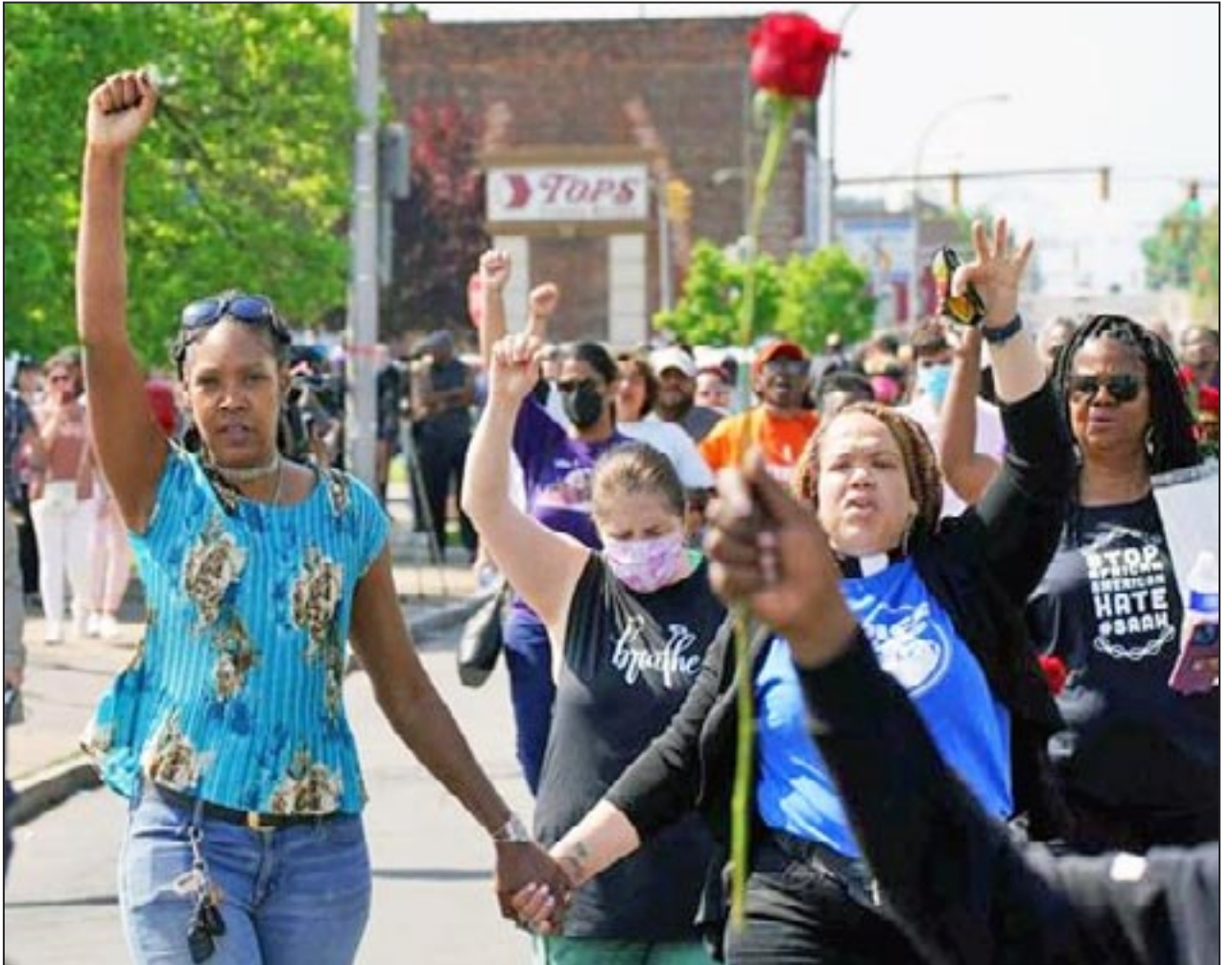
May 15, 2022—Protest in Buffalo, NY, USA, following racist murder of ten mostly-elderly Black shoppers in a super market by a young white supremacist.

This impoverishment of the working class is