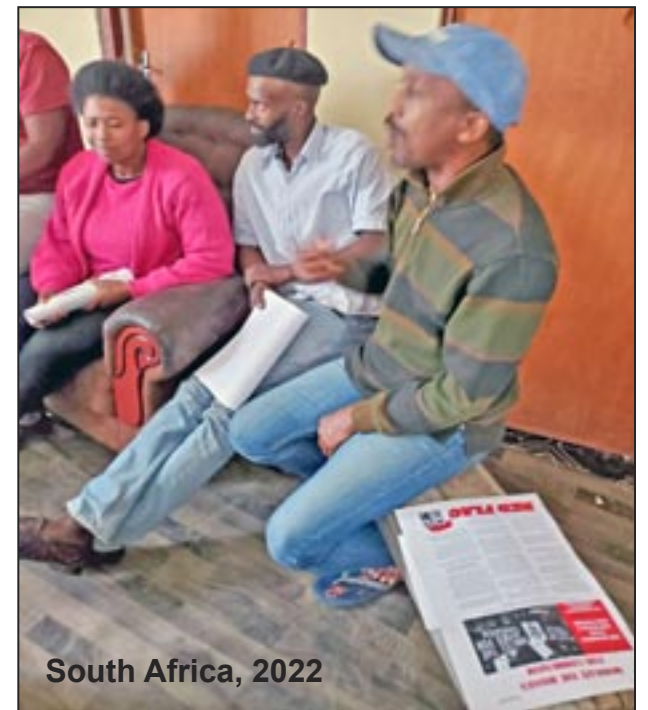
South Africa, 2022

We are bringing this message to the hungry, angry masses to recruit them to our party.