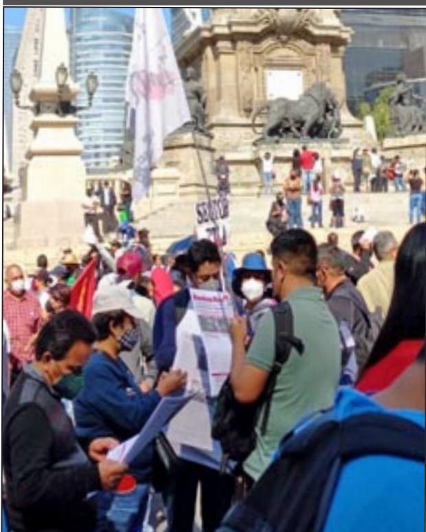
Mexico City, May 15—Comrades distributed hundreds of Red Flags during the march celebrating the Day of the Teacher.

PLEASE SEND YOUR LETTERS, RESPONSES AND SUGGESTIONS TO ICWPREDFLAG@NYM.HUSH.COM