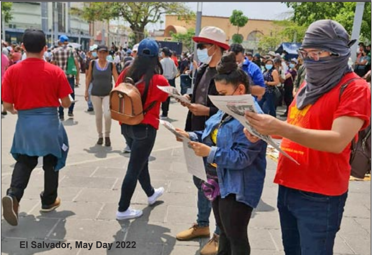
El Salvador, May Day 2022