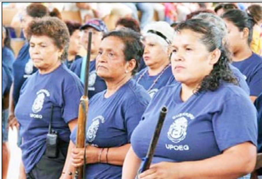
Community policing group in Guerrero, Mexico. Read more at icwpredflag.org/RF/RF030614.pdf

Masses have responded with courage and collectivity. In Laguna Woods, an unarmed guest charged the gunman. He took him down at the cost of his life and the congregation subdued and hog-tied the killer.