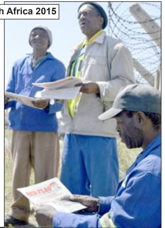
South Africa 2015