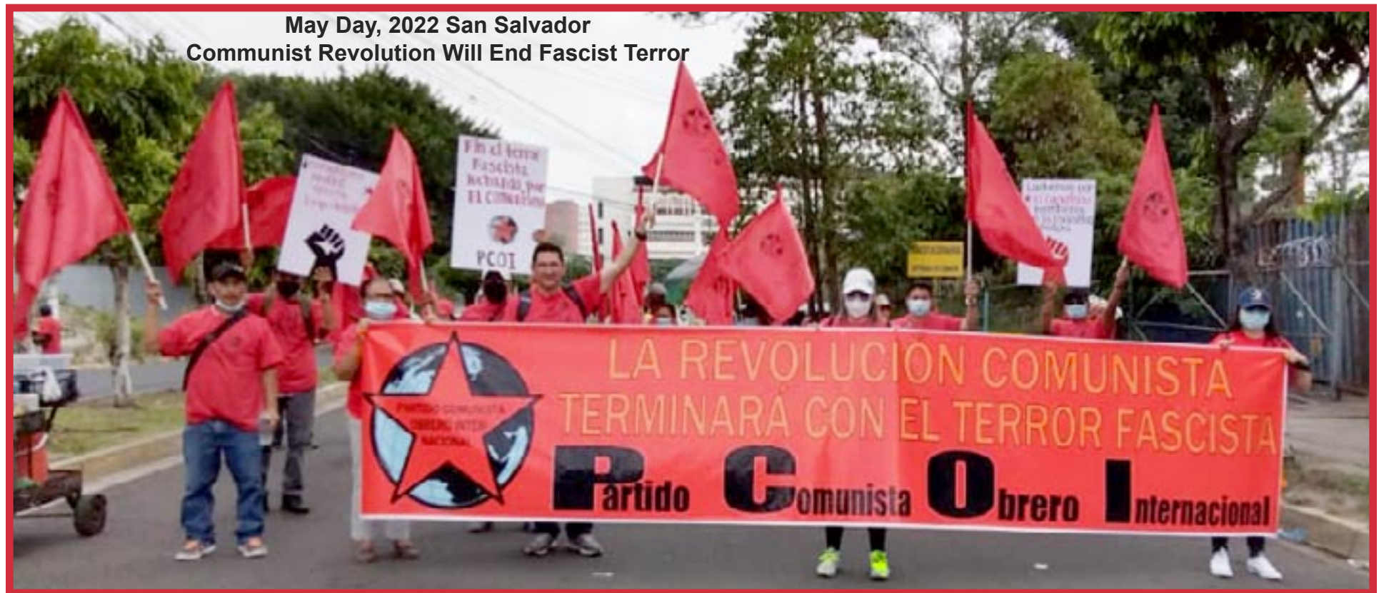
May Day, 2022 San Salvador Communist Revolution Will End Fascist Terror

We saw the potential, but actualizing that potential is the work of more than a few days. Let’s develop plans for consistent work among younger people, especially those who are already anti-capitalist. Let’s seek out and embrace opportunities to build relationships with them that will lead to more revolutionary communist leaders.