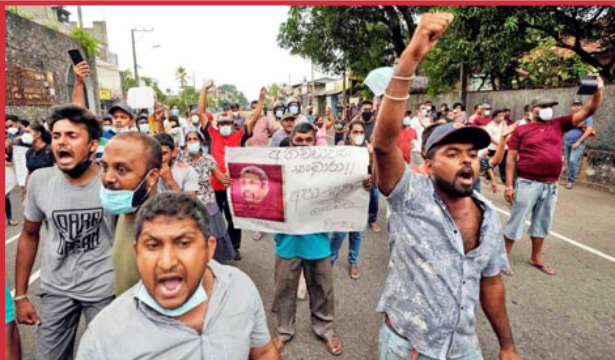
April 3, Colombo, Sri Lanka: protestors block highway.

A recent visit by comrades from Bengaluru and elsewhere has added to the urgency of our work. We are more committed to working with our collective regularly and we have formed study groups to apply dialectics to our daily life. We now distribute about 100 Red Flags in Sri Lanka and hope to visit readers there shortly.