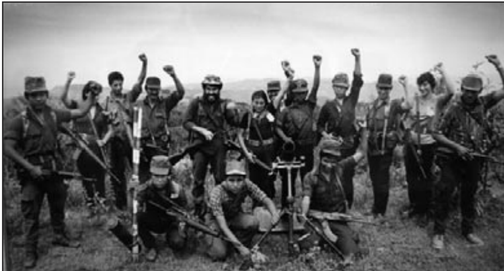
Photo: El Salvador

No one will be isolated. With close relationships, we will know if someone is planning to harm themselves or others. This is the only real safety for us all, and it will come with the death of capitalism-imperialism and the building of a communist world.