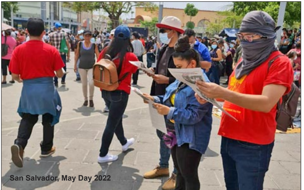
San Salvador, May Day 2022

—Comrade in the trenches of the Maquilas in El Salvador