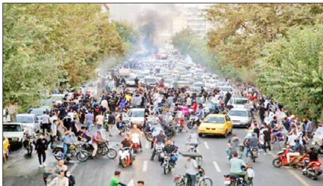
Tehran, Iran: Mass protests and riots against the regime

Let’s join and build communist ICWP collectives everywhere to mobilize the masses for revolution and communist society. Read, write for, and distribute our Red Flag newspaper! Help translate ICWP literature into Farsi and other languages if you can.