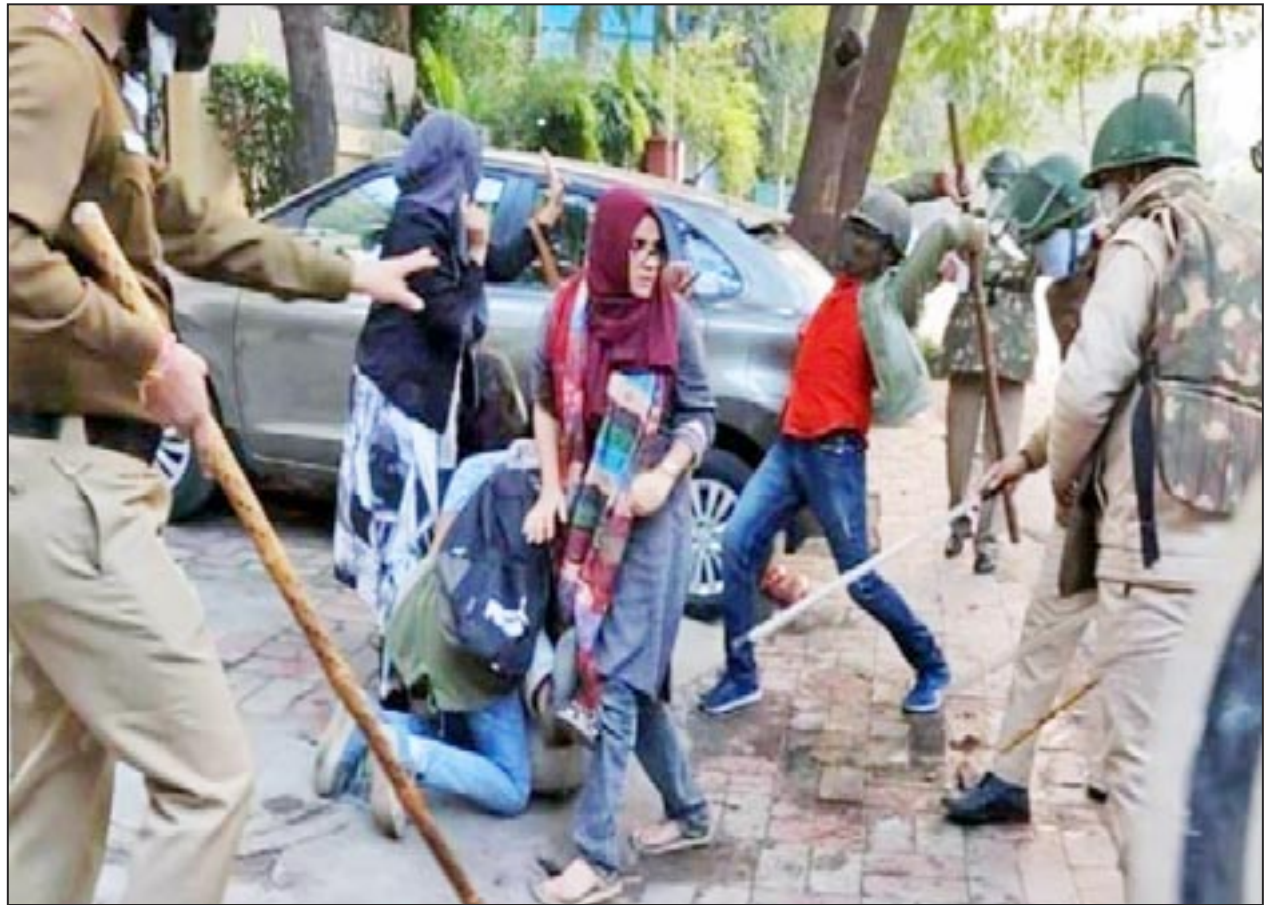
This iconic image from Delhi, India, in December 2019, of four women protecting a fallen male comrade showed that women can fearlessly defend working-class brothers and sisters.

“As I was getting more convinced about com-