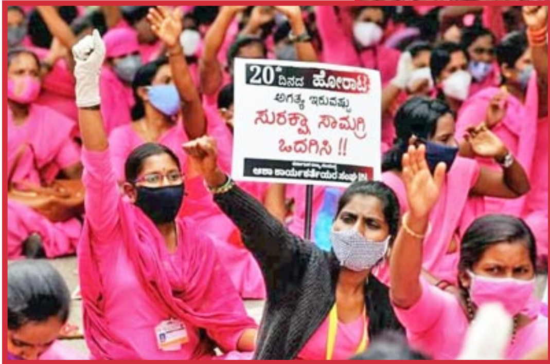
Bengaluru, 2022: Accredited Social Health Activists strike