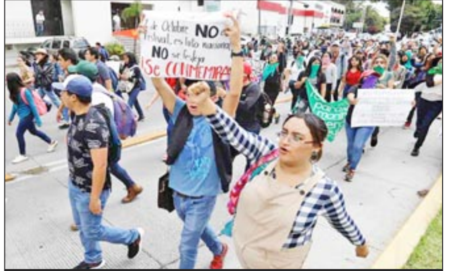
Mexico City, October 2—Thousands of protestors took to the streets to remember and repudiate the massacre of hundreds of students on October 2, 1968. The murderous government of Mexico tried to silence the voices that called for a better world. This mass murder relied on the moral support of the US government and the directors of the Olympic Games, which took place shortly afterward. “I was there in 1968 and now I’m in ICWP,” said a comrade.

We need to build this kind of communist political unity and struggle among our friends, comrades, and neighbors to strengthen the Party and advance toward our goal of mobilizing the masses for communism.