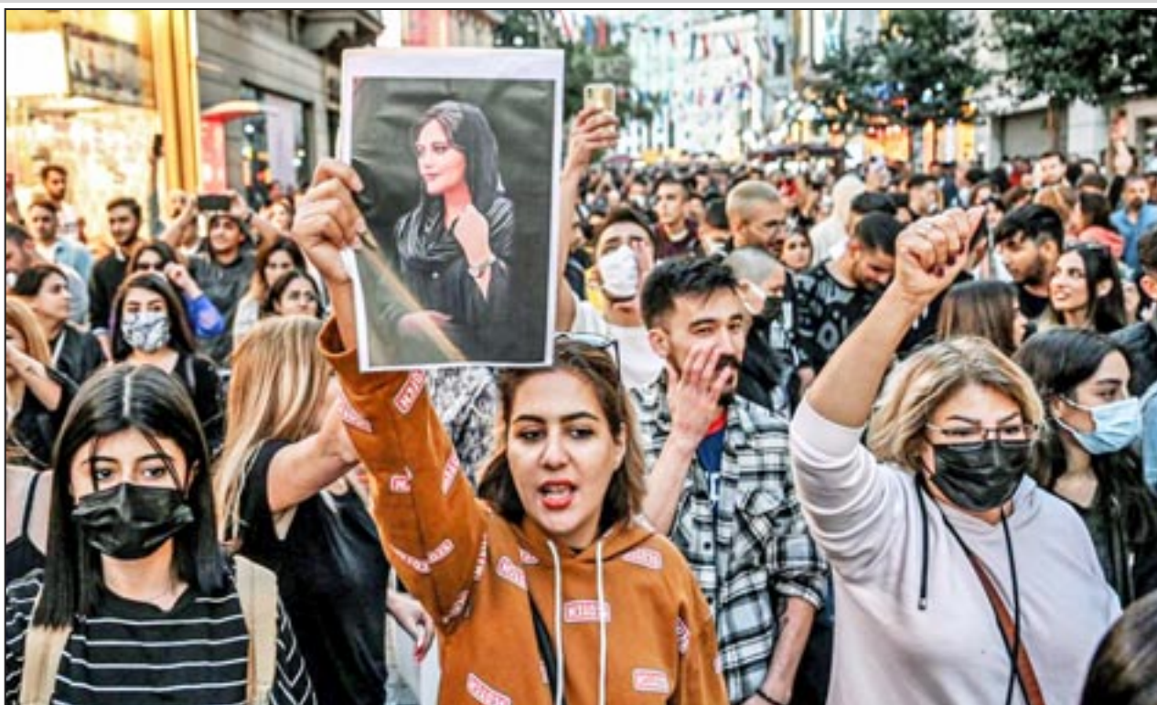
Istanbul, Turkey, October 1—Youth Protest murder of Mahsa Amini

Capitalist democracy is the dictatorship of capital. Capitalism cannot meet workers’ needs nor end exploitation. Its wage slavery is the material basis of capitalism’s poisonous sexism,