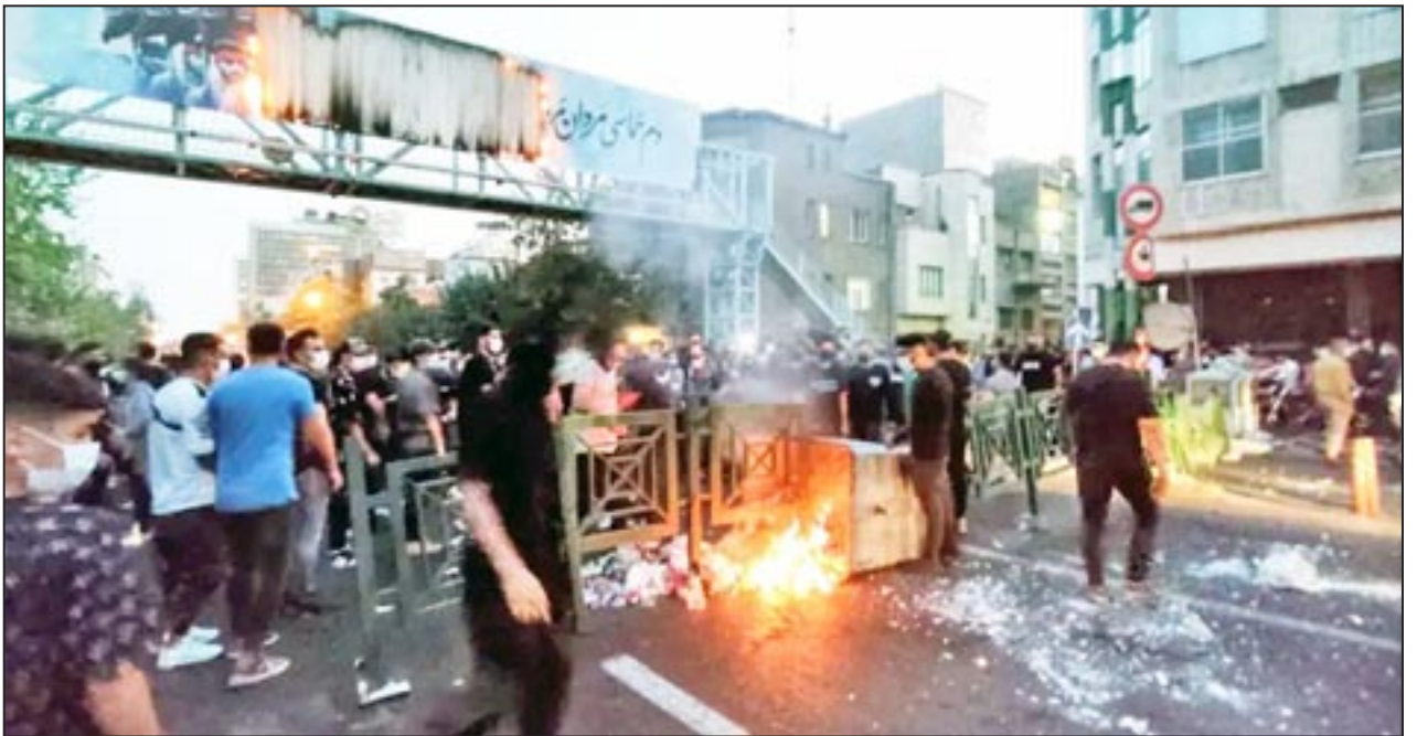
September 21, 2022. Protests rock the streets of every city in Iran.

Someone denounced the Iranian mullahs as terrorists (which they are). The comrade commented that US imperialism is the biggest terrorist. That in Iran and everywhere what’s needed is not “regime change” but social revolution. Several people agreed that the US created the situation that allowed