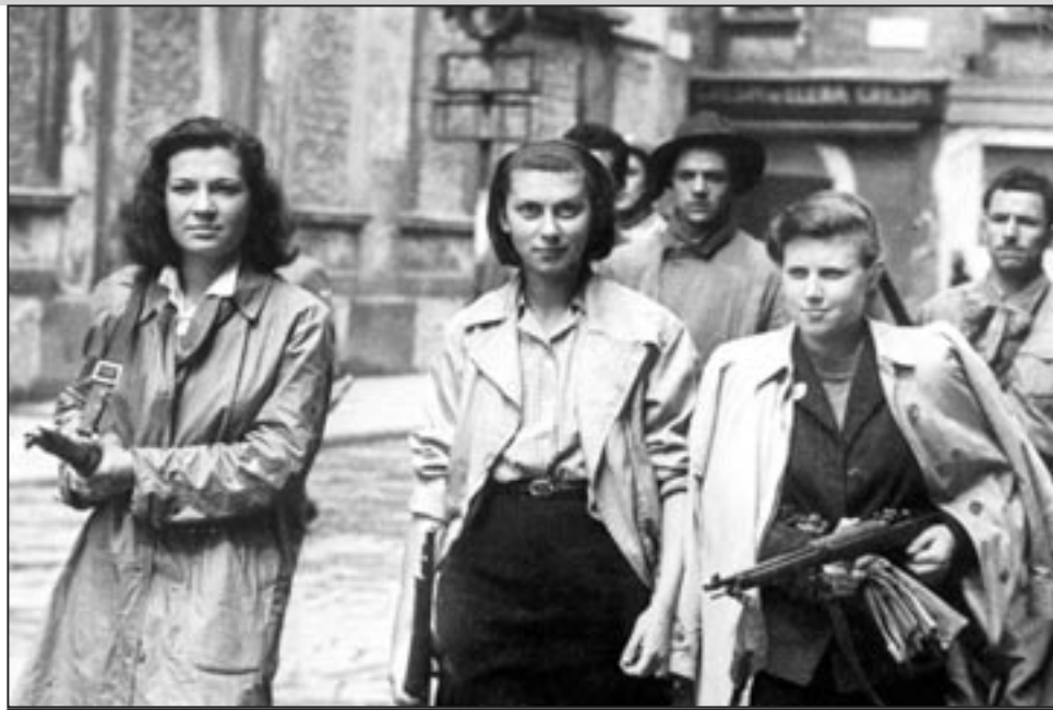
Communist partisans, Italy, during World War II

Fascism comes to power through the capitalist state's political structures. Some capitalist