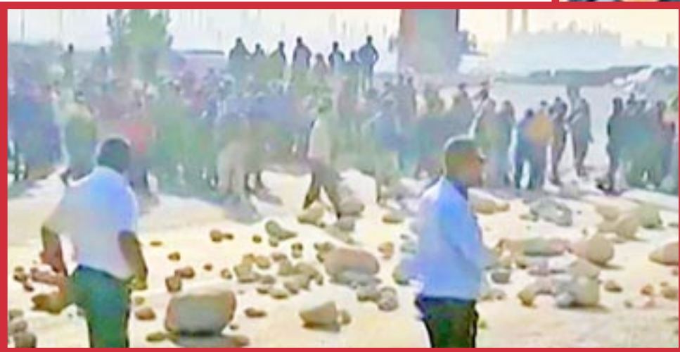
Left: Iranian oil workers on strike, October 2022