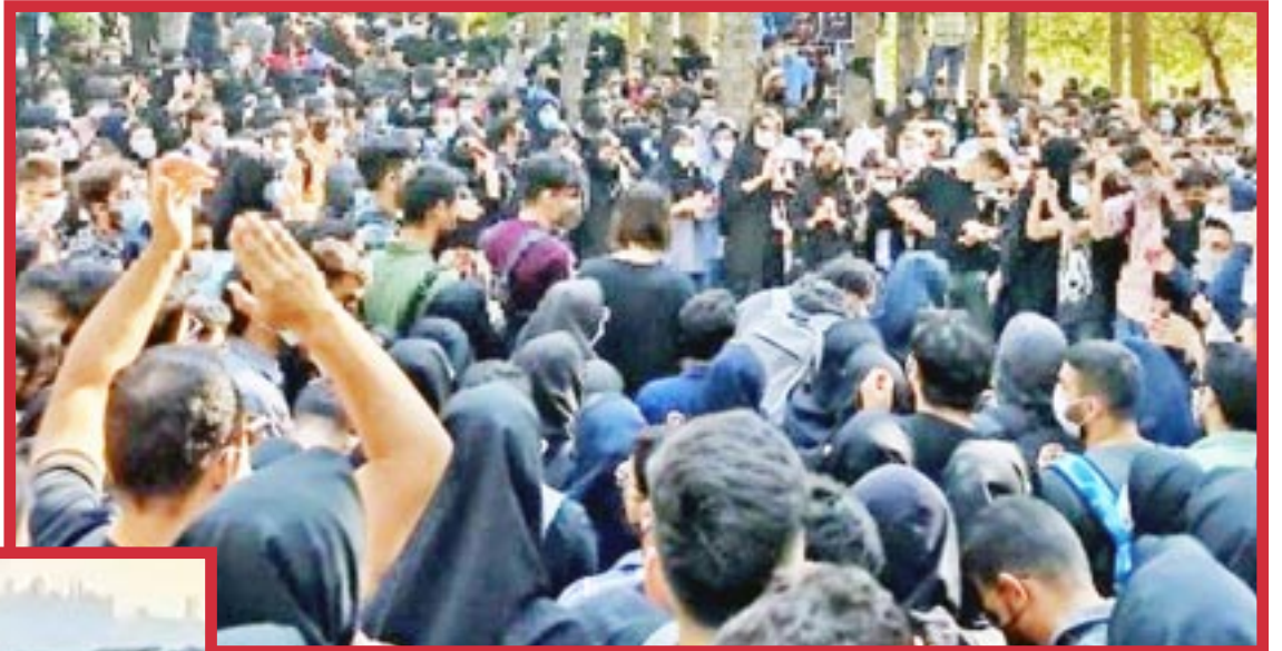
Above: Students at the University of Science and Technology, Tehran, October 2022

IRAN ON FIRE FOR THE WORKING CLASS: SEE PAGE 5