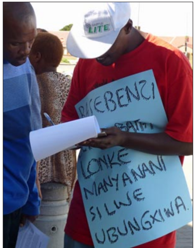
Organizing for May Day, 2013: “Workers of the World Unite for Communist Revolution”

Solidarity with our comrades around the world reassures us that communism will prevail with dedication, commitment and the correct attitude