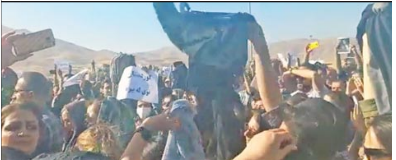
October 26, 2022 Protests on the 40th day after the death of Mahsa Amini