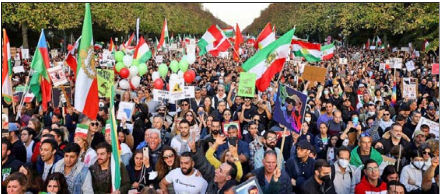
Berlin, Germany: Protesters support uprising in Iran

We need a mass communist party, the ICWP, that knows no borders and fights for communism and nothing less.