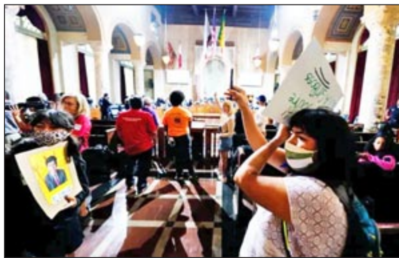
LA City Council, October 12, 2022

All the speakers called for the resignation of