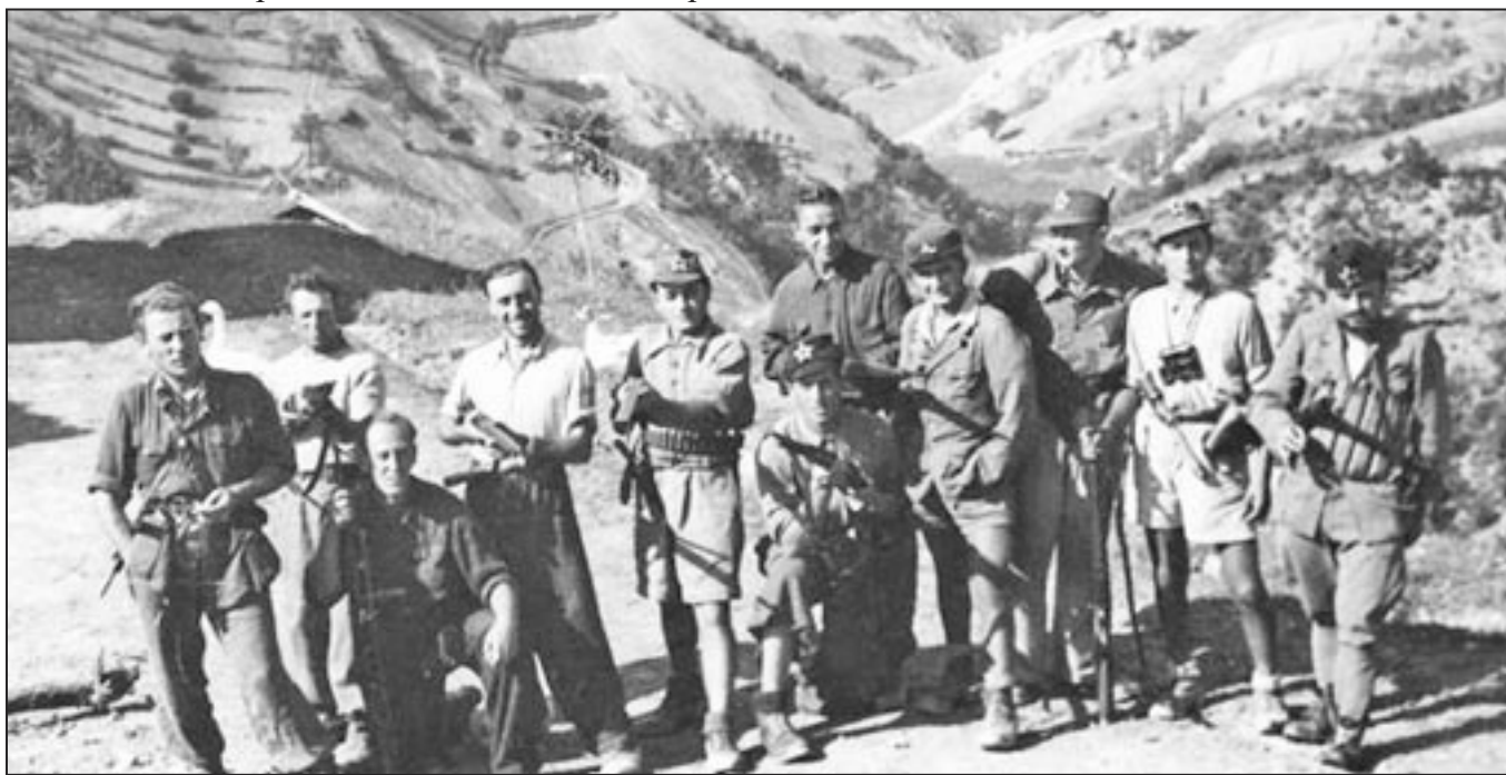
Communist partisans, Italy, during World War II

Communist partisans executed Mussolini in 1945. But it remains to us to fight for and build the communist world we need.