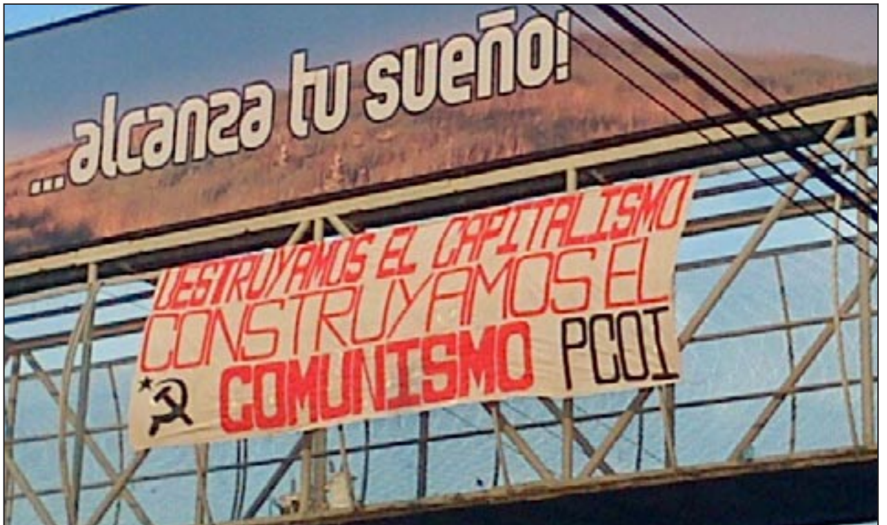
El Salvador, May Day, 2013—Achieve your dream! Let's Destroy Capitalism and Build Communism! ICWP

He stressed to me a lot that as an ICWP mem-