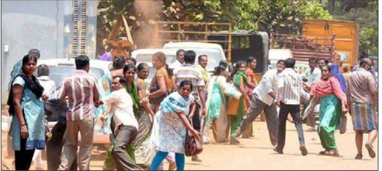
Strike in Bengaluru, 2016: Garment workers in South Asia have a long history of militant struggle

Long live communism! Join ICWP and distribute Red Flag !