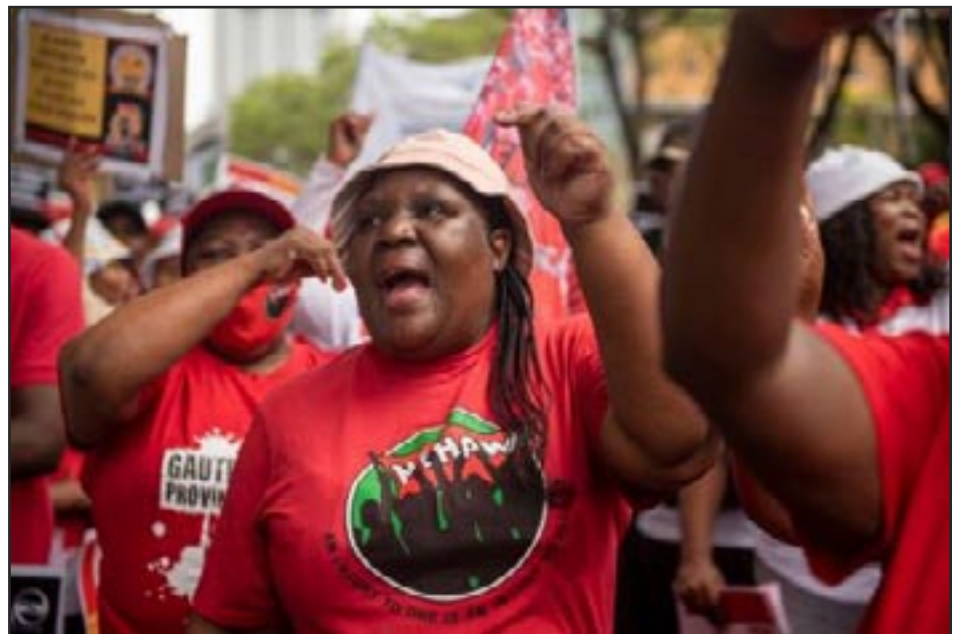
SOUTH AFRICA, November 22, 2022—Civil Service Workers on Strike

Red Flag depends on all of you. Give yourselves a round of applause before we go back to our workshops!