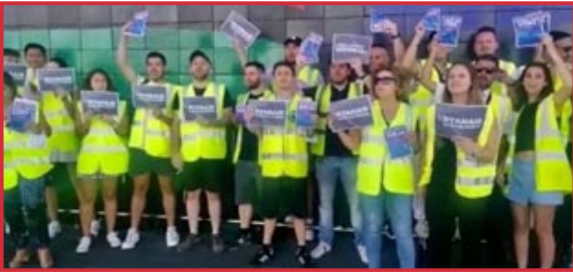
Spain, January 2: Ryanair flight attendants strike at ten major airports over pay and working conditions.