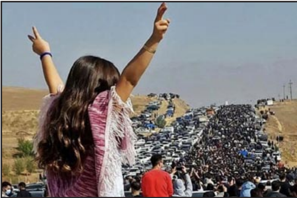
SAQEZ (IRAN), October 26, 2022—Masses gather to commemorate Jina Mahsa Amini