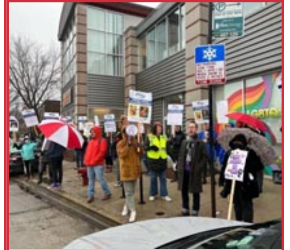
Chicago, USA, January 3: Howard Brown Health workers strike against layoffs. "It's hard to say this is an organization that believes in liberation when they want to slash programs that serve the community, not to mention the community they serve is often the people that work there," said a striker.