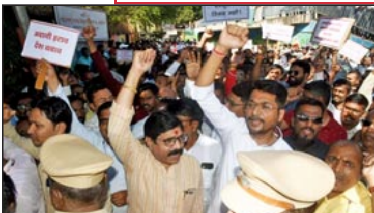
Mumbai, India, January 4: Electrical power workers strike against privatization of the state-run company.