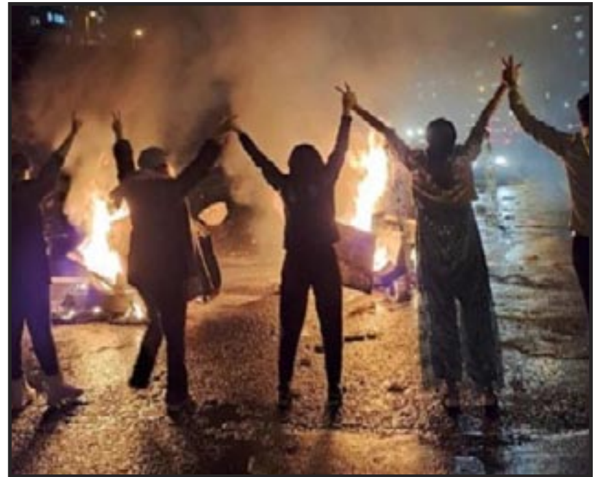
SANANDAJ (IRAN), November 17, 2022—Young women in the streets