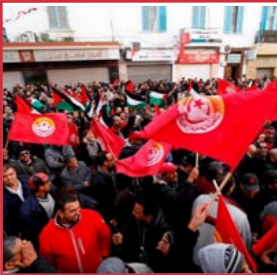
Tunis, Tunisia, January 2: Tram and bus workers strike over delays in salaries and the lack of an end-of-year bonus.

Let's bring communist literature, communist signs, and communist slogans to the picket lines and the streets everywhere we can! Let's meet, befriend, and recruit to our party many of these angry strikers who are desperate for change!