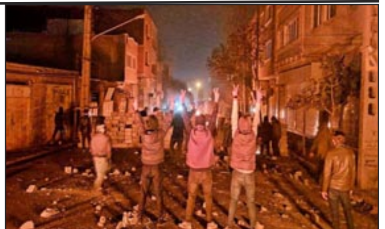
SANADAJ (IRAN), January 2, 2023—Protestors set up roadblocks to protest attacks on mourners in Javanrud

The US and Israeli rulers would love to see the Iranian regime replaced with the pro-Shah coalition in exile. But it would be a mistake to attrib-