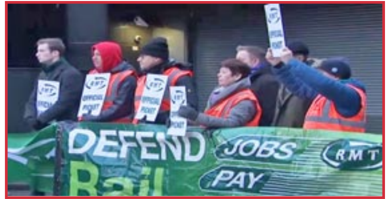
United Kingdom, January 3: Railway strikers demand raises to keep up with inflation.