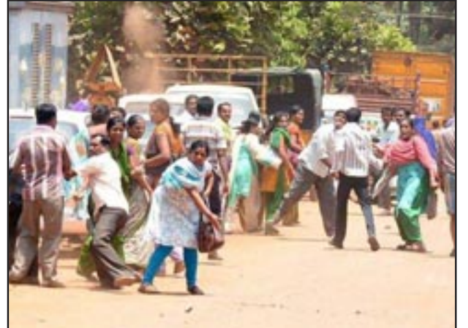
BENGALURU (INDIA) 2016—Garment workers fight back