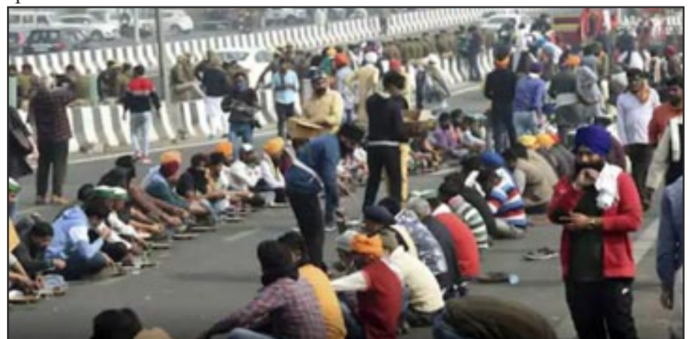
NEW DELHI (INDIA), December 2020—Langars serving farmers during mass protest.

The video ends with the words of the women garment comrades (see article page 7) while the Internationale plays in Bengali and Hindi.