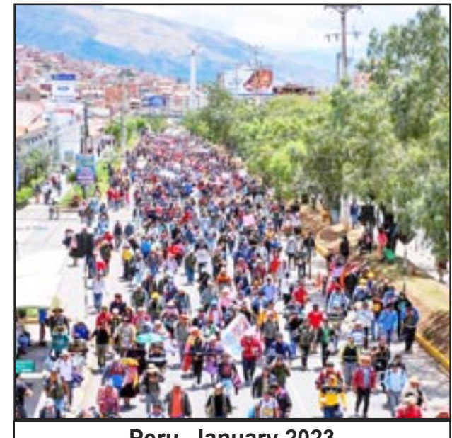
Peru, January 2023

On June 10, 2022, then-President Pedro Castillo participated in the IX Summit of the Americas, in Los Angeles, USA. Another Peruvian representative said that more U.S. compa-