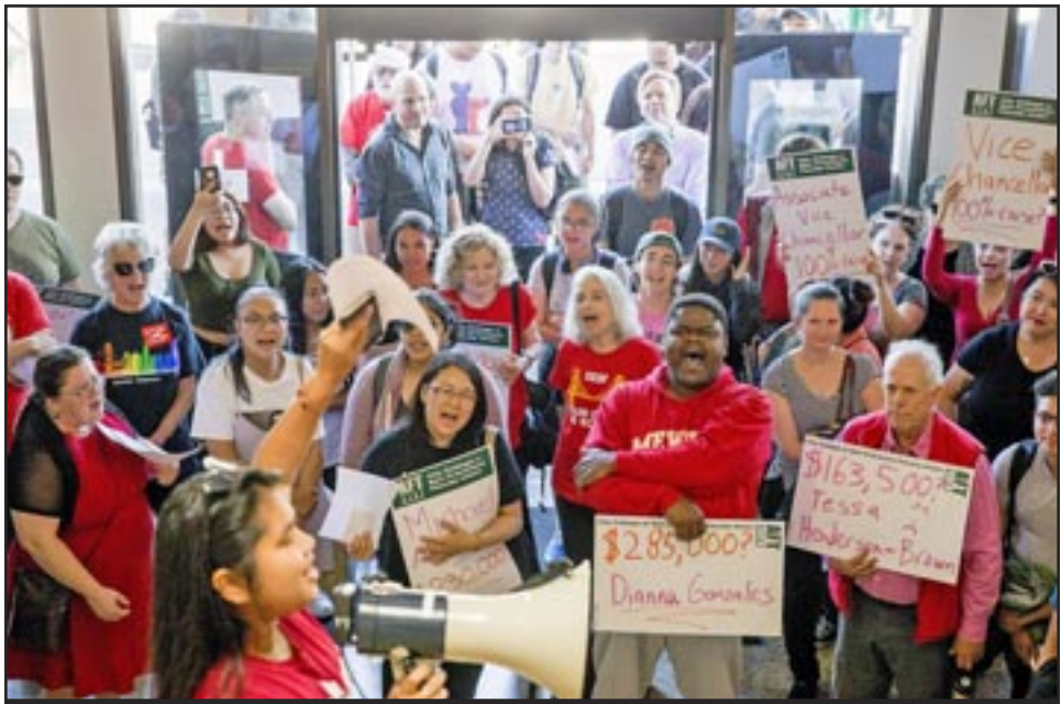
San Francisco Community College (California, USA) students protest pay hikes for administrators amidst class cutbacks, 2019

That's one of the main ways that communists participate in working-class struggles, big and small: building communist relationships that make communist ideas real to our friends and encourage them to join ICWP.