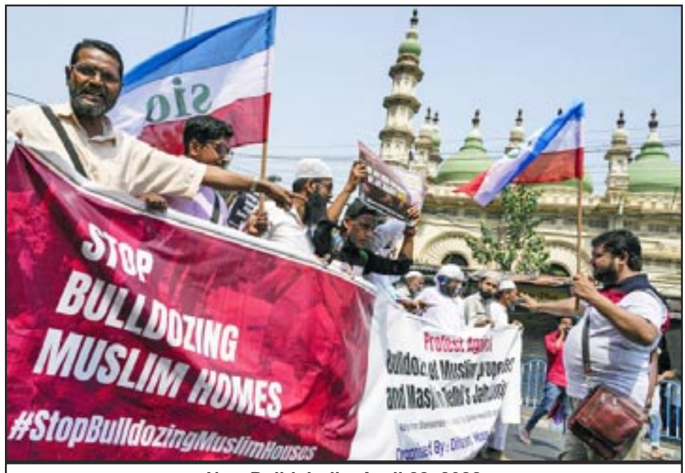
New Delhi, India, April 22, 2022

Another Delhi comrade said, "The profit system that we live in creates an internal contradiction. It puts the working class in direct conflict with our capitalist rulers. They use casteism and