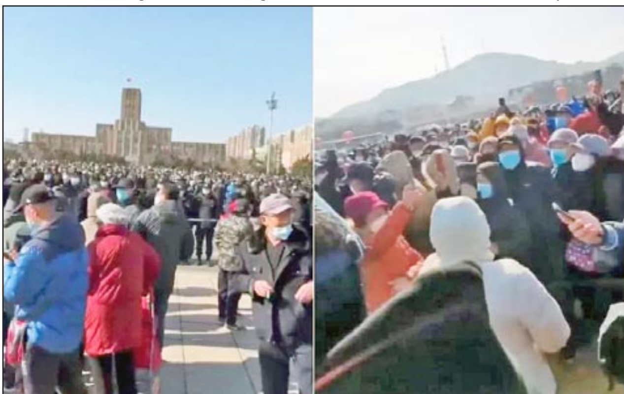
China, February 15: Seniors in the northwest port city of Dalian protest cutbacks in government medical benefits. The protests started in Wuhan, where retired steelworkers confronted police and sang the Internationale. The specter of communism is haunting the Chinese capitalists!

Imperialists are already starting their war. We will finish it, and their whole rotten system too.