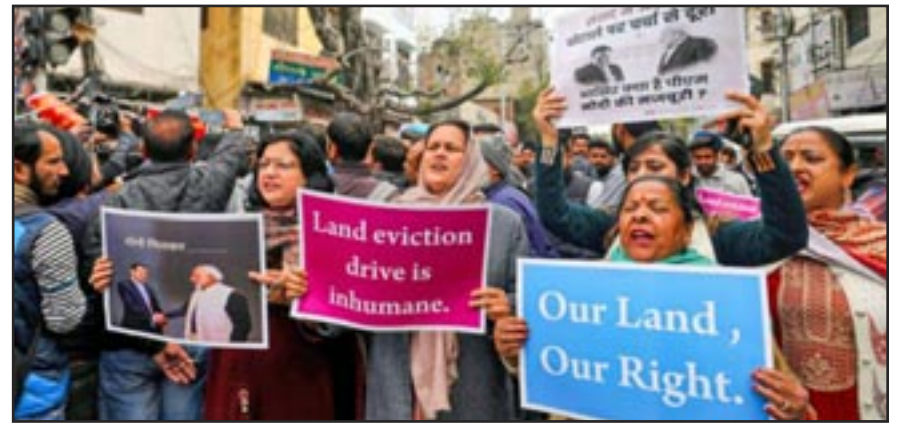
Jammu and Kashmir, February 6: Workers targeted Adani and Modi for government-sponsored evictions in a mass protest that surged past the Congress Party organizers, clashing with the police and attempting to break through barricades.

In pursuit of maximum profits, the capitalists need to borrow from financial capital (like banks). Their ability to make a profit depends on