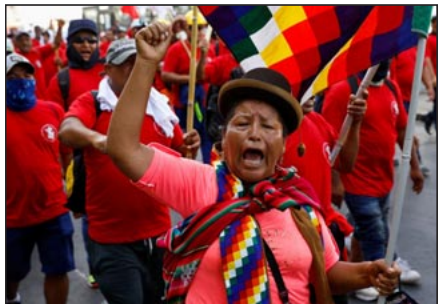
Lima, Peru, February 9