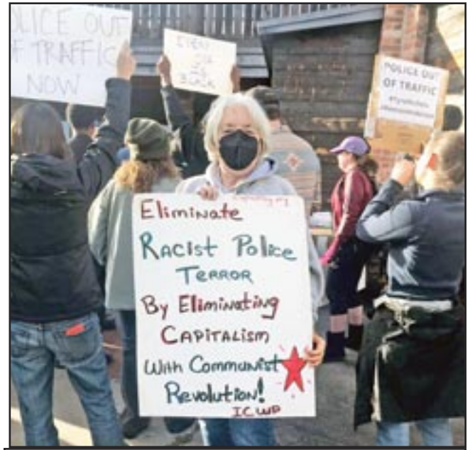
Los Angeles, USA, January 29

The meeting ended with plans to build a communist base in the schools where we distribute three hundred Red Flags each issue. Students and teachers consistently tell comrades that Red Flag is the "best literature" and "their favorite paper." The burning question is how we can develop these enthusiastic readers into communist organizers.