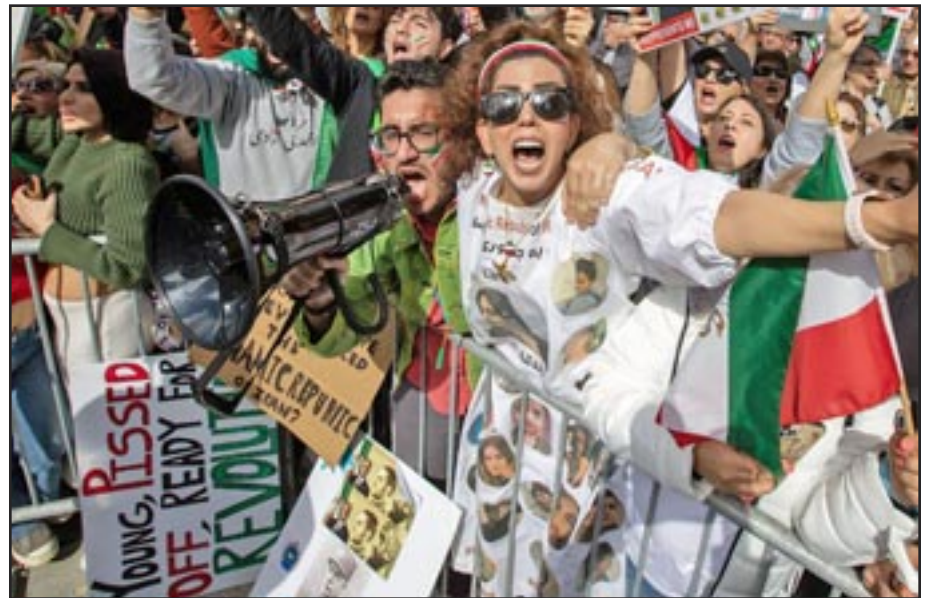
Los Angeles, USA, February 11

“That’s good!” one said. “I want to keep reading this paper.”