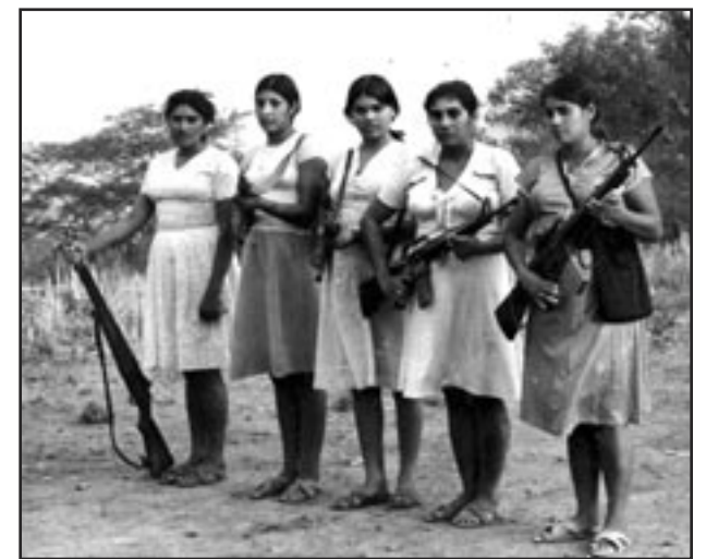
Women guerrilla fighters during the civil war in El Salvador

In Communist society, workers will be responsible for leadership, organization, and development without any need for police.