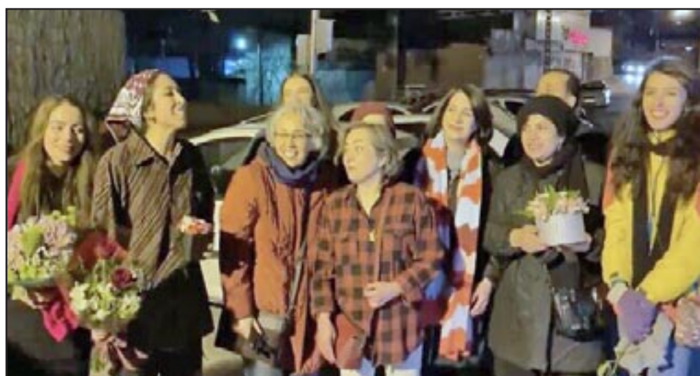
Tehran, Iran, February 9—Iranian women activists chant protest slogans after being released from prison

Iran joined the Shanghai Cooperation Organization. It is key to China and Russia’s plans to move oil overland to China and to send goods