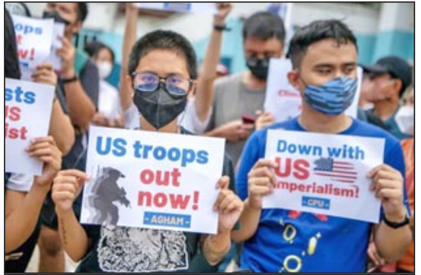
Manila, Philippines, February 2

Earlier in the forum, a University of Washing-