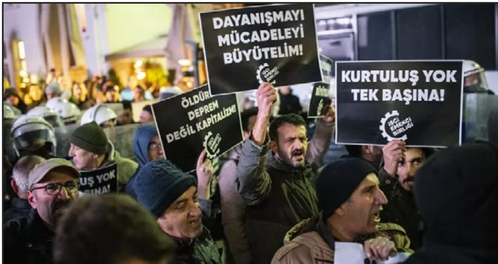
February 13, Istanbul, Turkiye: “It’s Not an Earthquake! It’s Capitalism!” See more page 5

THE INTERNATIONAL COMMUNIST WORKERS' PARTY ★ WWW.ICWPREDFLAG.ORG