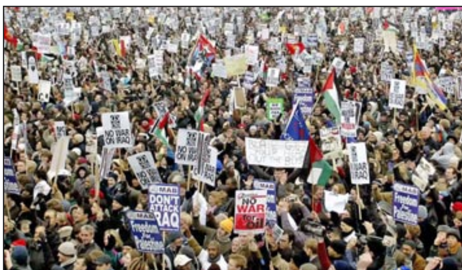
London, February 15, 2003: No War On Iraq

We the working masses will become the leading force in the world, sweeping away the imperialists and their wars and ushering in a bright communist future.