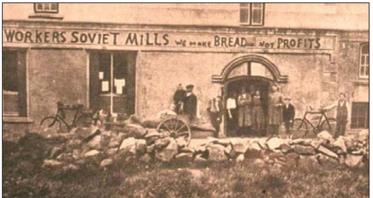
On August 26, 1921, organized workers took over the Bruree Bakery and Mills in Ireland. They raised a red flag and a banner proclaiming “Bruree Soviet Workers Mills. We Make Bread Not Profits.” This was only one of a number of Workers’ Soviets organized in Ireland during the Irish War of Independence and throughout Europe inspired by the Russian Revolution.