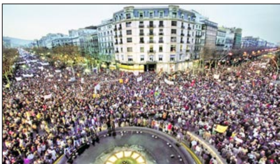
Barcelona, February 15, 2003: No War On Iraq

February 15, 2003: Twenty years ago, over 12 million people marched in almost 800 cities worldwide demanding "No US War on Iraq!" US imperialism invaded Iraq anyway. As masses marched, the troops were already on their way.