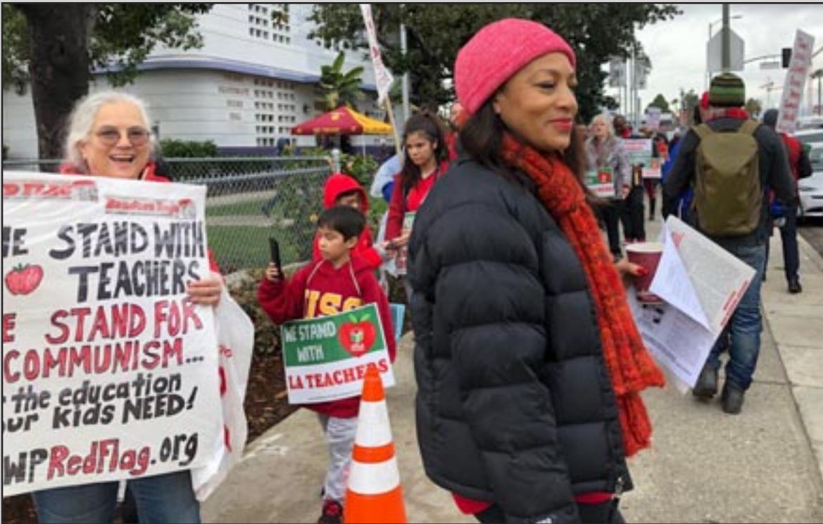
Los Angeles Teachers' Strike, 2019