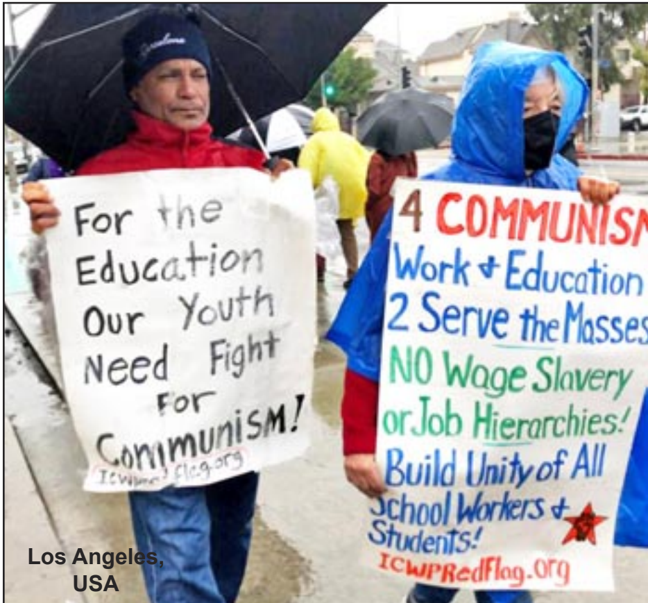
Los Angeles, USA

THE INTERNATIONAL COMMUNIST WORKERS' PARTY ★ WWW.ICWPREDFLAG.ORG