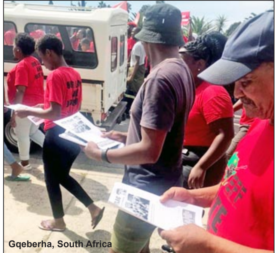
Gqeberha, South Africa