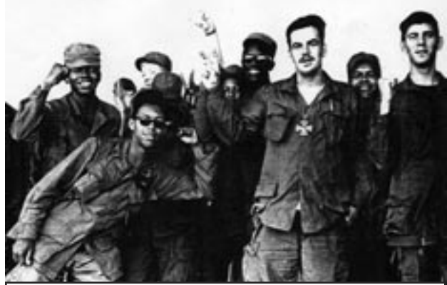
US soldiers mutinied in Vietnam

Two imperialist blocs compete for world domination: US and its western allies versus