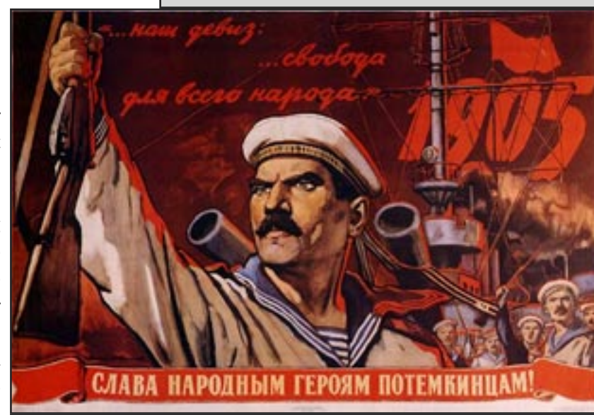
Bolshevik sailors led a mutiny on the Battleship Potemkin during the 1905 Revolution against the czar.