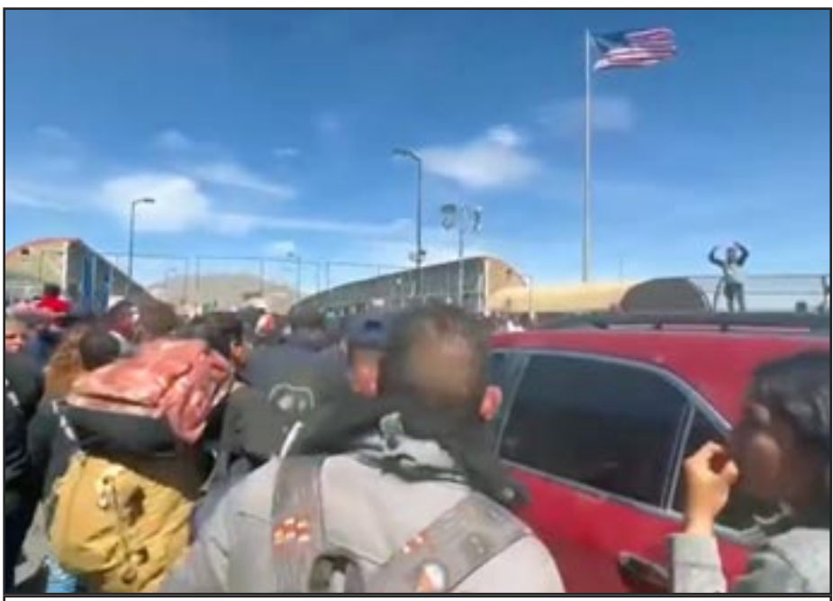
March 13—Approximately 2,000 migrants, hearing a rumor that asylum seekers with children would be admitted to the US. stormed the Paso del Norte Bridge border crossing between Ciudad Juárez. Mexico and the US. People fleeing persecution in their own country and seeking asylum in the US are desperate, due to a new mobile application for making asylum appointments and a Biden administration rule that requires that they first seek protection in a country through which they passed.

We will welcome workers everywhere, no matter where they come from. Refugees and immigrants, because of their experiences with the worst capitalist oppression, will give key leadership as they do today in our party. Together we will build the new communist society and we will continue to fight until capitalism is destroyed all over the world.