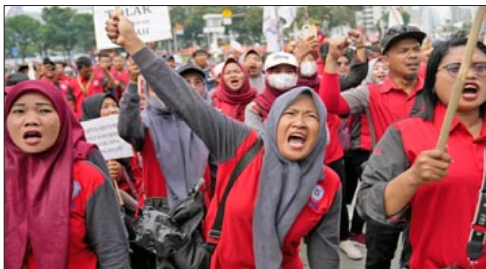
Jakarta, Indonesia May Day 2023