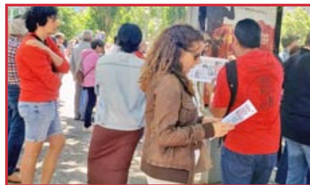
Spain, page 5