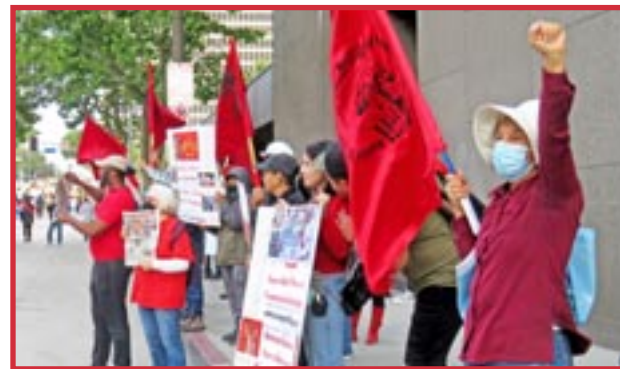
Los Angeles (USA) page 3