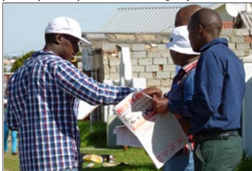
Red Flag in South Africa

The rest of the discussion was more targeted to comrades who have been around the party for a long time. We tried to answer critical questions while making plans. Some questions were: Why do we think communism can win? What is the role of communists at this current time?