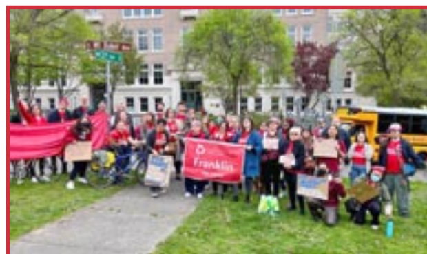
Seattle (USA) page 4