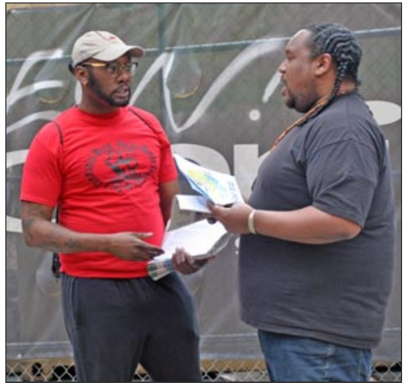
Los Angeles, USA, May Day 2023