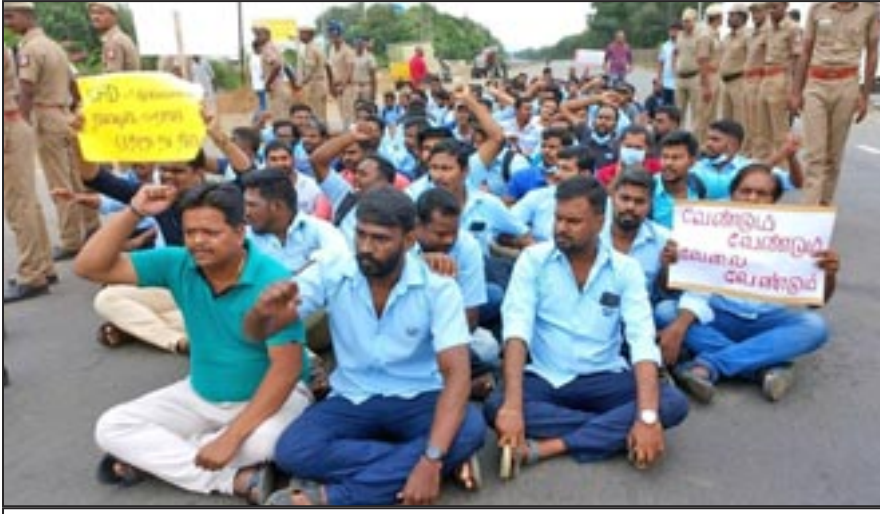
Auto Workers in Tamil Nadu block road in labor protest 2021

Overall, our May Day has opened many opportunities to recruit more workers and soldiers for our party.