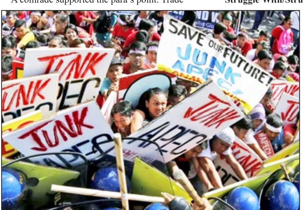
Anti-APEC protest in the Philippines, 2020

China's regional trade group is already See SEATTLE: END IMPERIALISM, page 4