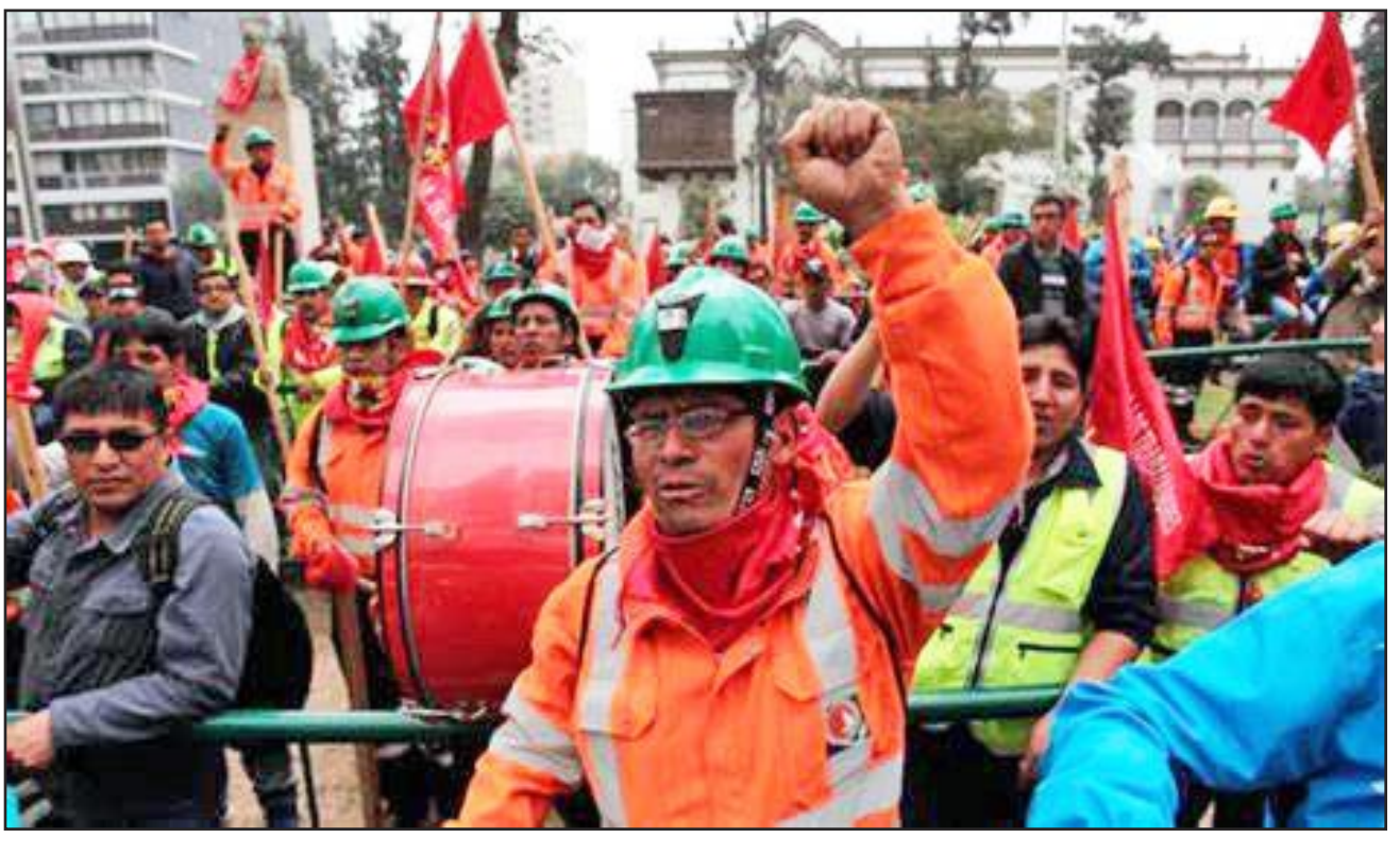
Lima, Peru, 2020—Miners on strike