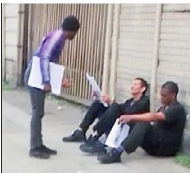
South Africa 2023

FOR THE REST OF THE REVIEW, SEE https://icwpredflag.org/wp/wordpress/