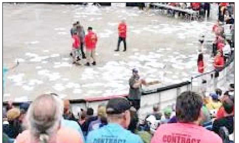
Wichita Spirit workers throw contract back at union officials

The working class must break free from the bosses’ chains and build a collective world. ICWP encourages Spirit workers to keep their fighting stance and join our party to destroy capitalism!