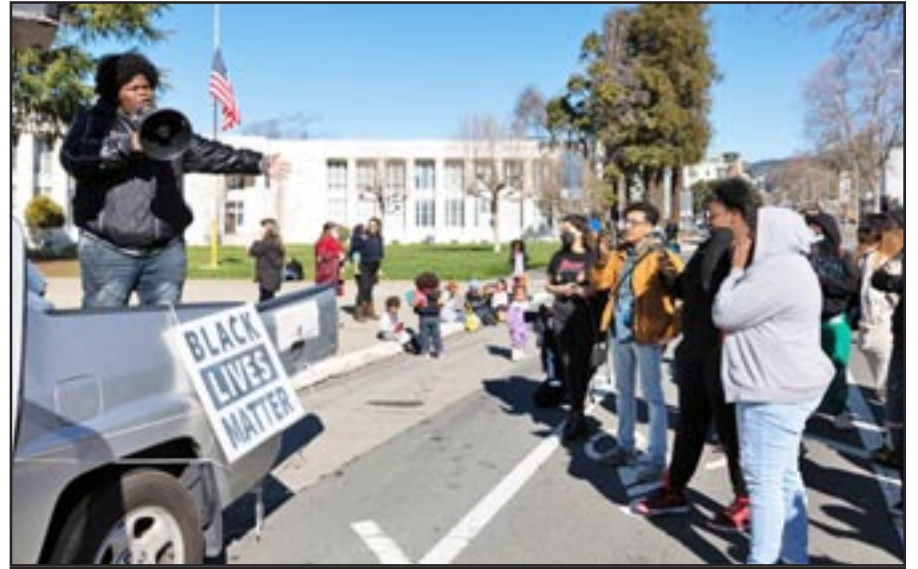
Oakland students protest cop murder of Tyre Nichols, 2023.

Students are future workers and soldiers. They will be crucial to the communist revolution we need. We encourage students to continue developing politically and reading Red Flag and join the fight for a communist future for all.