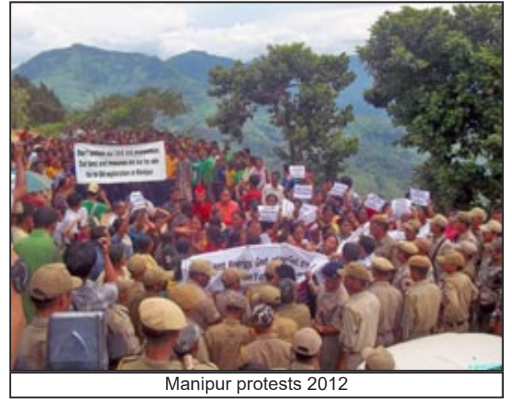
Manipur protests 2012

In 2010, the Indian government started oil production in thirty areas. It gave Jubilant Oil and Gas of the Netherlands exclusive rights to a 3,000 km 2 area (about 1150 square miles). The ownership of natural resources is contentious in Manipur. That's the root of the problem in Manipur. Different ethnic groups want to be classified as Scheduled Tribes to claim the owner-