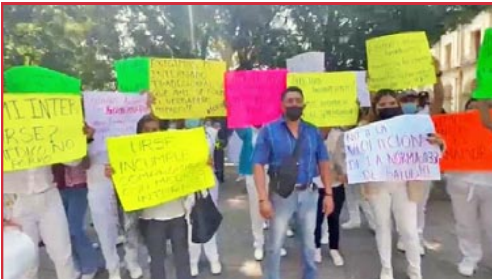
Oaxaca (Mexico), July 3, 2023- Medical students at the University of the Southeast, with parents and recent graduates, protest at the Government Palace. They demanded hospital internships for all medical graduates and equal conditions for these internships.

We will work to have health care from a completely new perspective: one in which the health of every member of the working class, of our communist society, is primary.