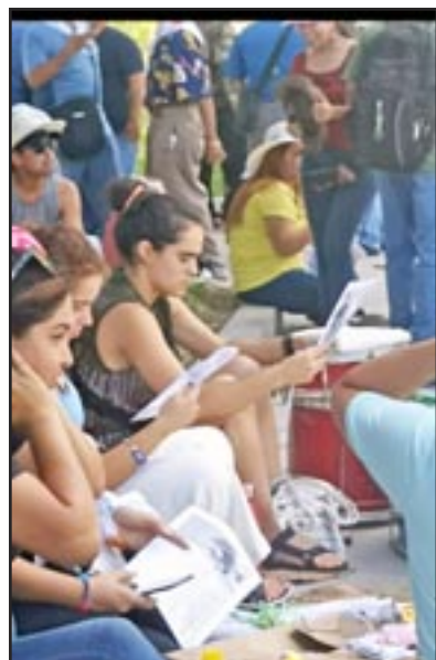
Students of the National University of El Salvador, July 30

The capitalist rulers tried to legitimize the massacre as a response to a “communist plot.” That generation of young people who got involved in the struggle were inspired by revolu-