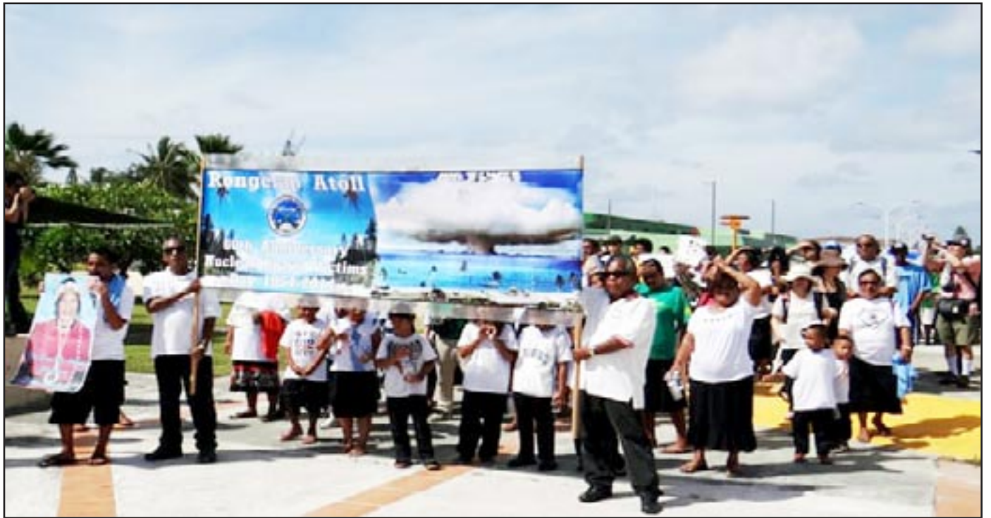
March 1, 2014: Marshall Islanders protest on 60th anniversary of US hydrogen bomb test that destroyed Bikini Atoll.

If the rulers threaten to use — or do use — nuclear weapons anywhere in the world, the workers of the world must and will mobilize to end their rule forever! Neither nuclear blackmail nor nuclear war will stop the communist-led working class from making revolution.