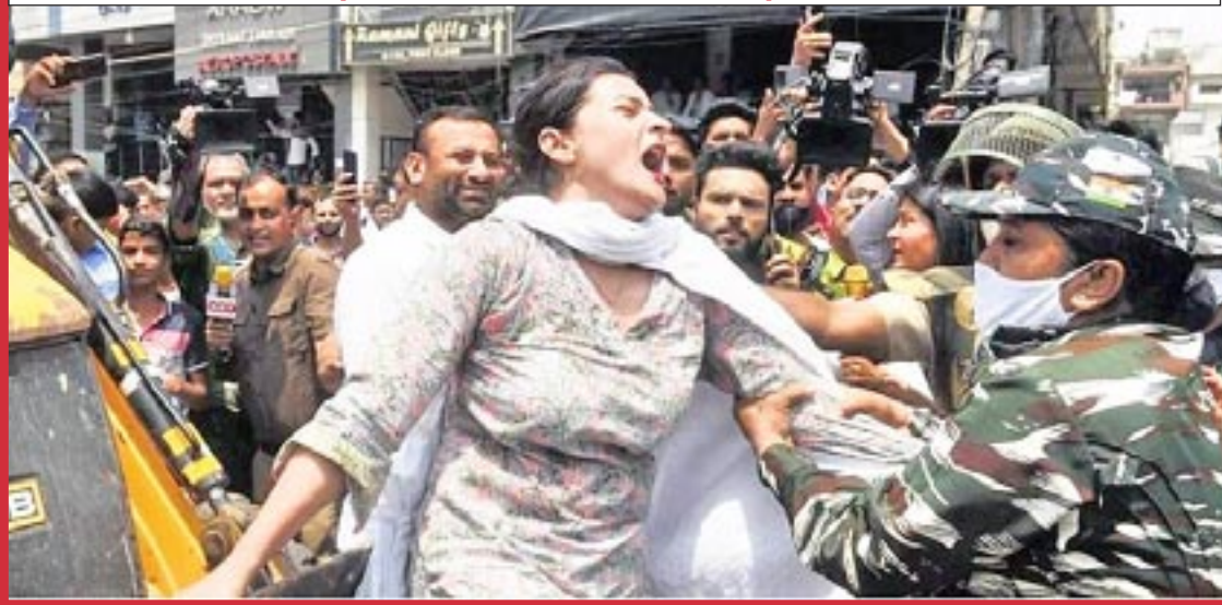
Shaheen Bagh, New Delhi, February 2020, protesting against xenophobia and demolition of protest sites