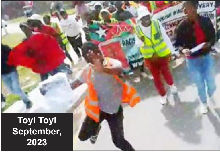
Toyi Toyi September, 2023

I said, "The only way that all the evils of capitalism will end is by organizing and fighting for communism."