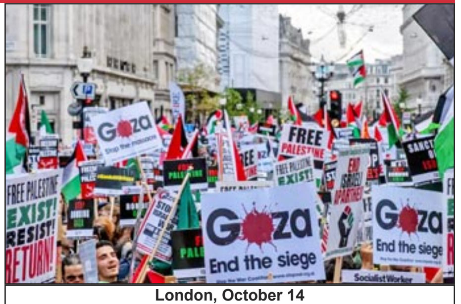
London, October 14

The Chinese imperialist proxy Abiy Ahmed in Ethiopia conducted a war in the Tigray region in 2020-2022. Hundreds of thousands died from famine and war-related violence.