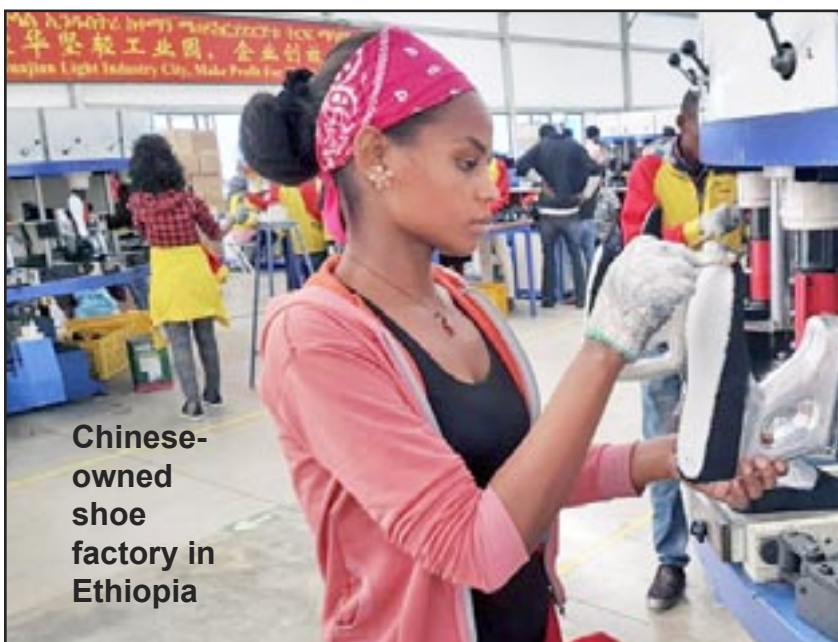
Chinese-owned shoe factory in Ethiopia

The bosses' nationalism, racism, and fascism will be no match for a united working class fighting for communist workers' power. Together, we will win!