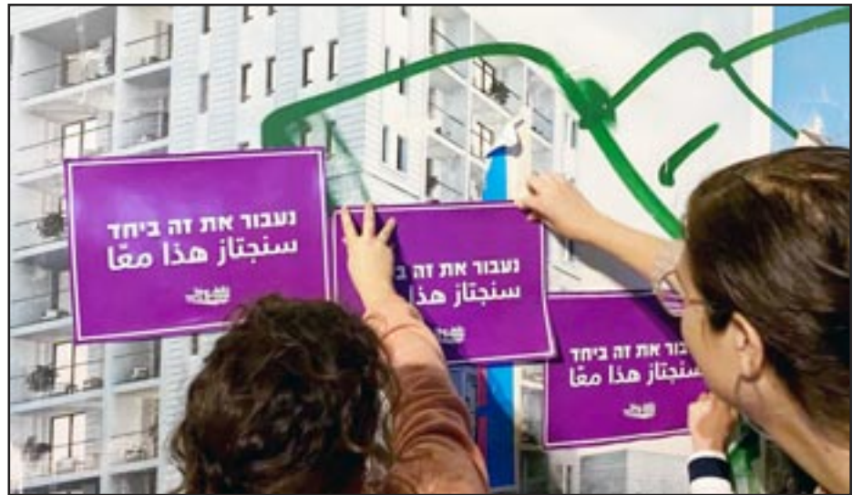
Jerusalem, October 10: Activists from the Jewish-Arab peace movement Standing Together, posting signs that say, "Jews and Arabs, we will get through this together." Two of them, a Jew and an Arab, were arrested and their signs confiscated.

We distributed more than 700 leaflets and 500