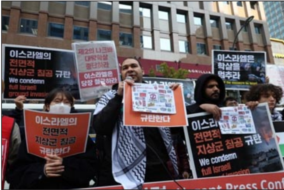
Seoul, South Korea—Activists, including Arab speakers, condemn the Israeli military invasion of Gaza

Occupation and oppression can only lead to more resistance. Genocide will lead to broader war. The whirlwind of a united communist movement will blow this deadly system away with a revolution that builds communist society.