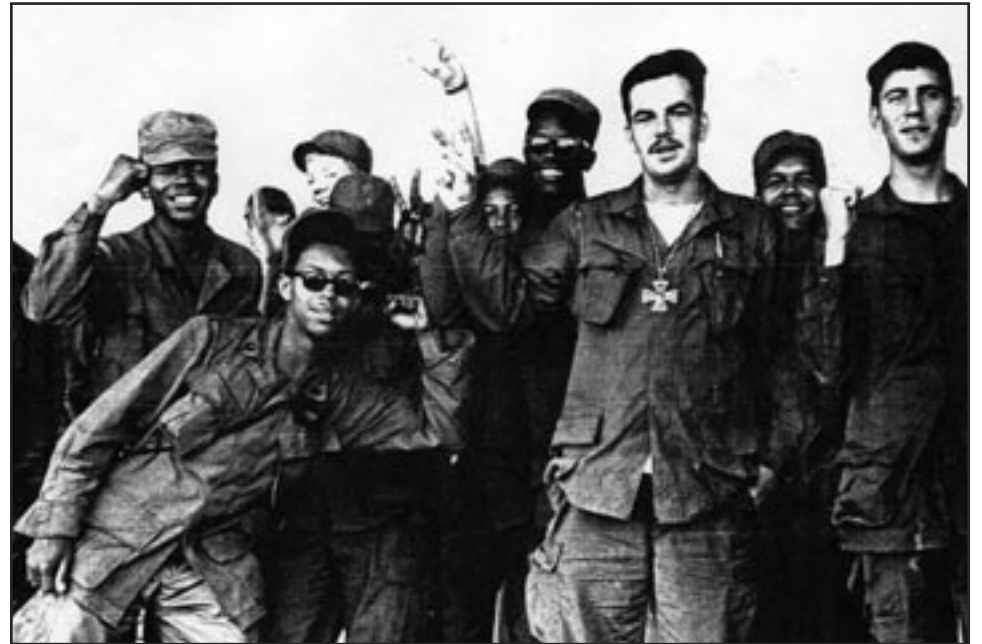
Rebellious US soldiers in Vietnam made it impossible for the US government to field a reliable army.

Red Flag adds: A soldier in Port Elizabeth, South Africa, distributes Red Flag to his unit. He says that the Gaza genocide is making more soldiers see our line of recruiting communists. “The bosses are powerless if we refuse to fight for them.” Let’s follow his lead by recruiting more soldiers from the bosses’ armies everywhere. We must build one united Red Army. Neither Hamas nor IDF can bring peace. They are enemies of the working class. Let’s build a mighty ICWP of red soldiers to free the working class from wage slavery and genocide.