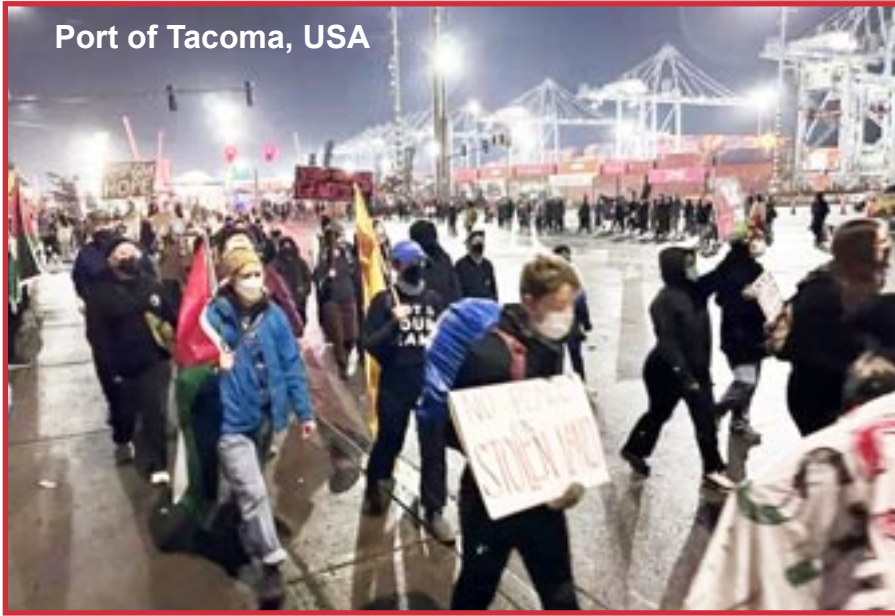
Port of Tacoma, USA