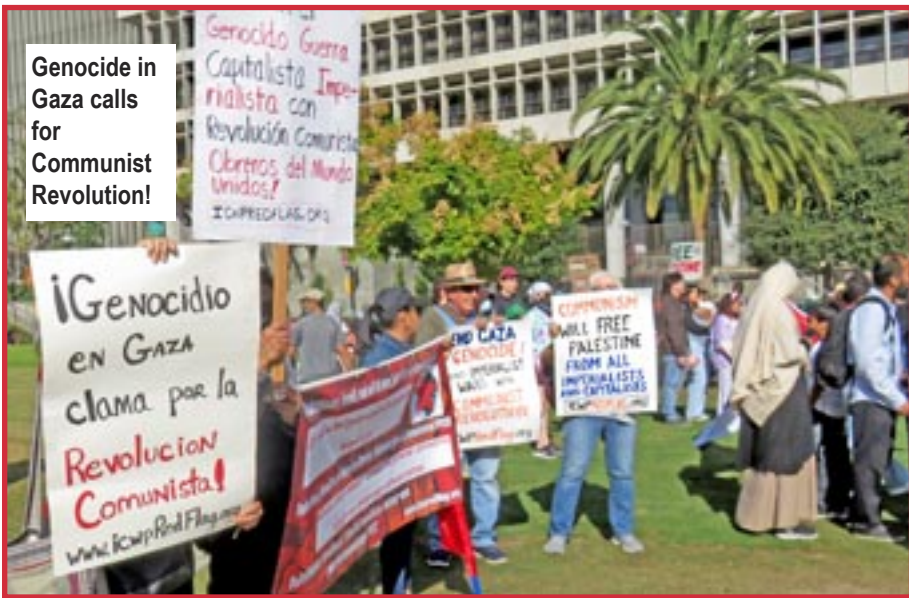
Los Angeles, USA