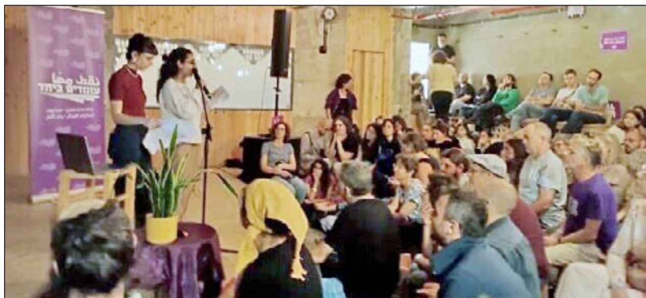
Hundreds attend Standing Together Movement community meeting, Jerusalem, November 2023

Only communism can create a society that welcomes all workers everywhere. That ends occupation, exploitation, and oppression. The society that masses yearn for.