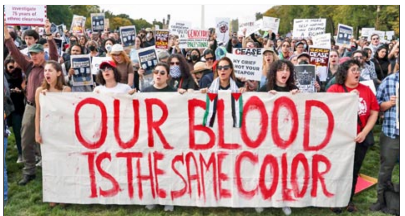
Washington, D.C., Protests led by Jewish youth call for an end to the genocide in Gaza.