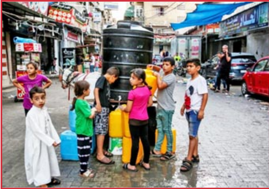
Khan Younis, Gaza

THE INTERNATIONAL COMMUNIST WORKERS' PARTY ★ WWW.ICWPREDFLAG.ORG