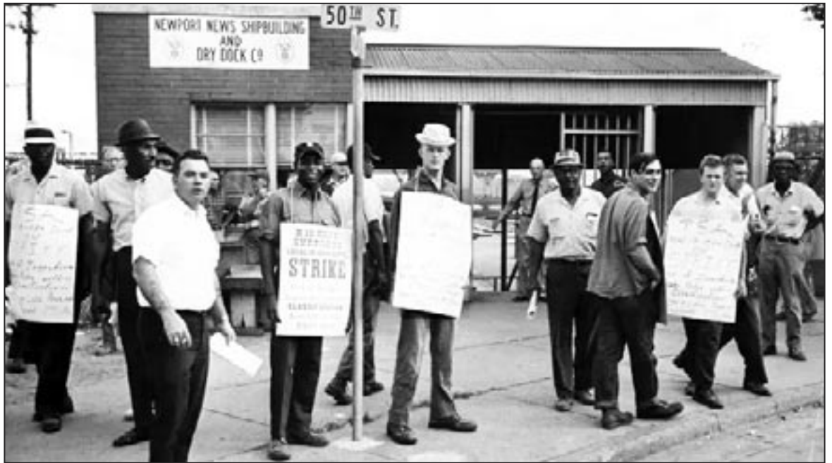
Newport News Virginia, July 1967

Rich colonists got title to land for bringing over people who they forced to work for them for (usually) seven years. Laborers who survived got a gun and some supplies. They were told to move west and try their luck at stealing farmland