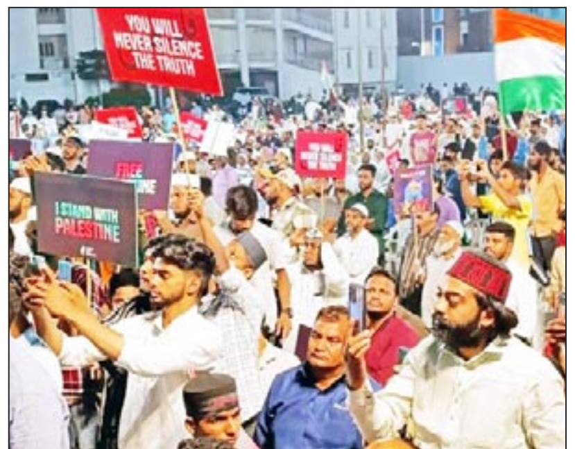
Hyderabad, India: Masses defy fascist Modi government's attempt to stifle pro-Palestine activists and ban protests.