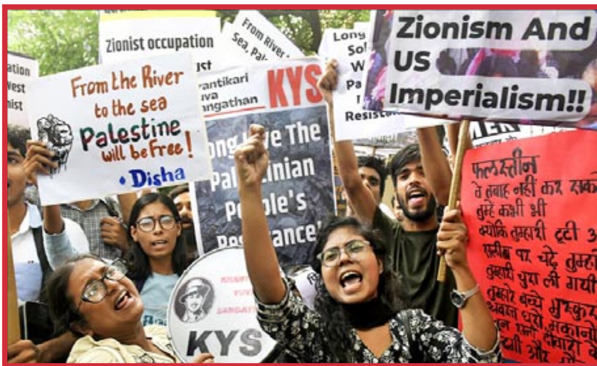
Working-class students in Delhi, India, October 2023