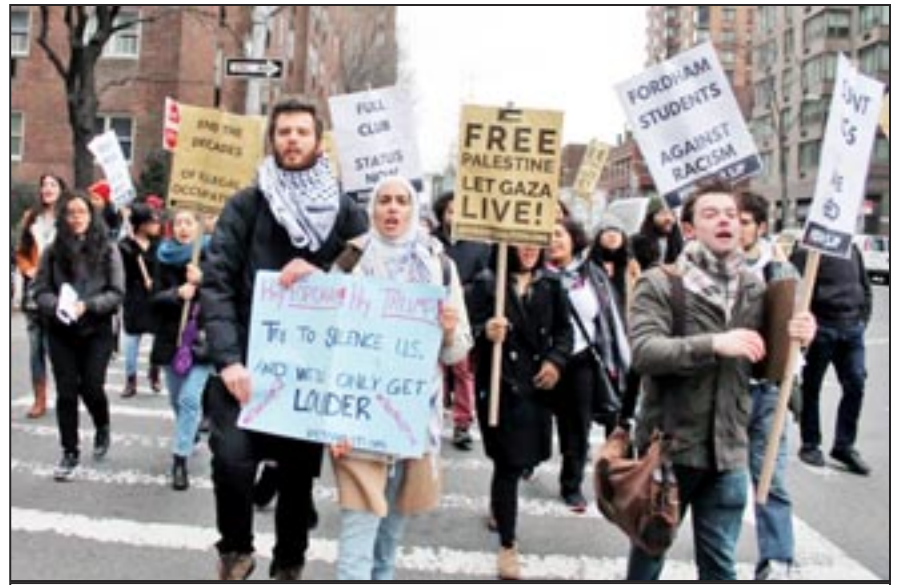
New York, 2017—Fordham University students protest banning of Students for Justice in Palestine.

Well-intentioned demands for the university