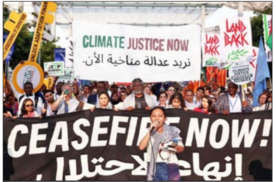
Dubai, December 2023—Activists at the COP28 Climate Summit expose links between Big Oil and the Israeli assault on Gaza.

To accomplish all of this will need the concerted and synchronized struggle of the international working classes. It requires an international party that truly represents the international working classes. Join us in struggling for revolution to create a better future for generations to come.