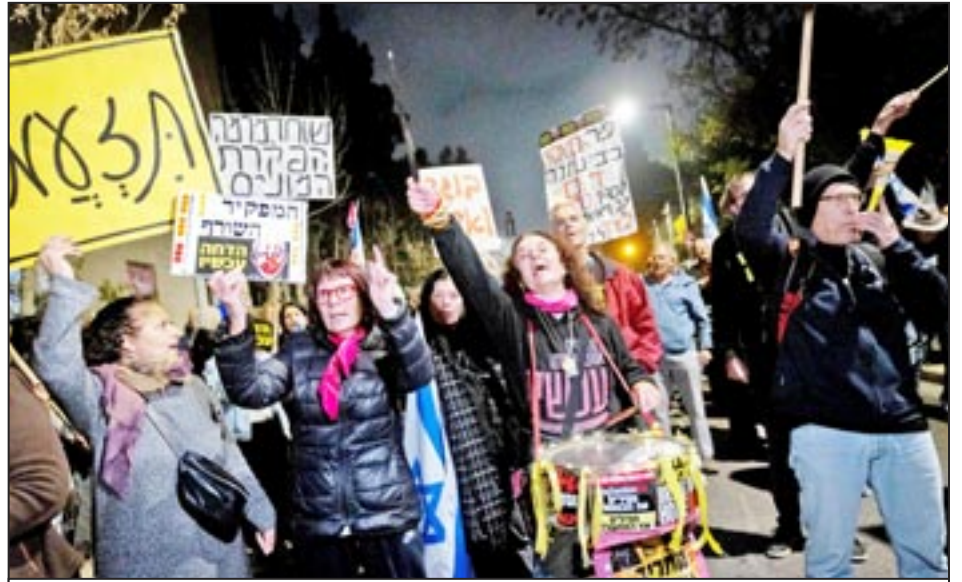
Tel Aviv (Israel), December 30—Hundreds defied fascist wartime restrictions in an anti-government protest, with signs saying: “Corruption and lawlessness. Fire him now!” “1400 on your watch. Abandoning the hostages. Down With the Government” “It’s not just Netanyahu – Jews and Palestinians need to unite to end the Zionist government, all capitalism and imperialism. Communism will free us from all wage slavery and division.”