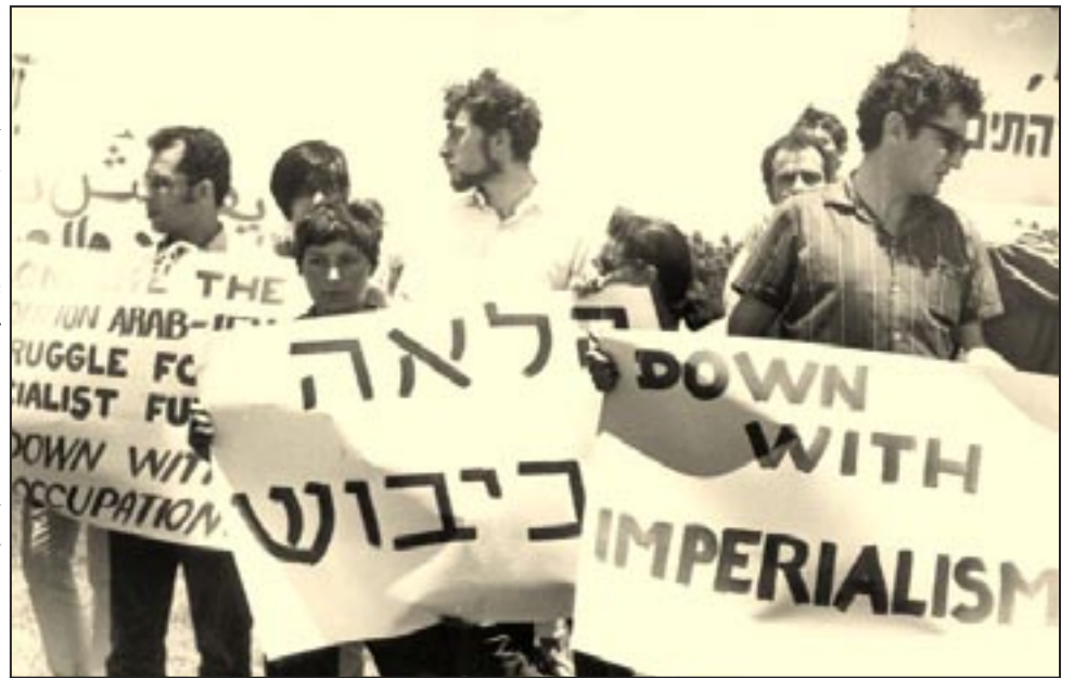
Tel Aviv (Palestine/Israel)—1970s Members of Matzpen (Compass), a socialist organization, made up of Jews and Palestinians, protest against the occupation, against expanding settlements, and for Arab-Jewish unity against the Zionist government after the 1967 war. The sign in Hebrew reads: “Down with the Occupation!”

Britain had eyed the Ottoman Empire well before World War I. In 1915 the Sykes-Picot