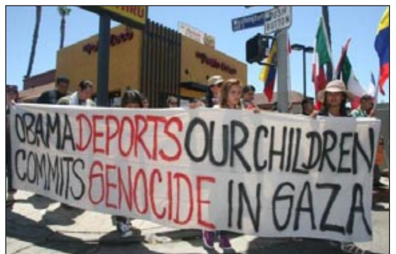
Los Angeles, July 2014.