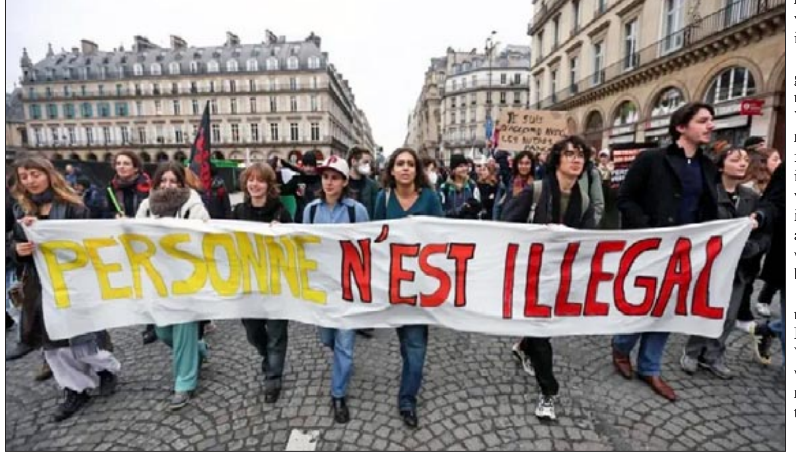
Paris, France, January 2024 "No one is illegal"

To make this a reality, we need to form collectives of the International Communist Workers' Party all over the world and mobilize the masses for communist revolution.