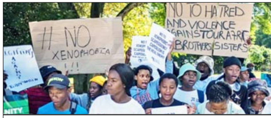
Johannesburg, South Africa, March 2022

There are many such examples of dialectics in comrade Hamza's letters. Our collective found it very