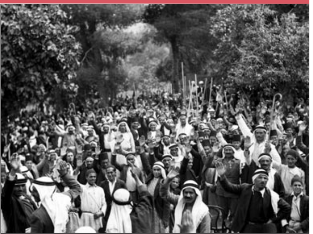
Abou Ghosh, Palestine, 1937—Workers vote for a general strike against British rule. This strike developed into the Arab Revolt which shut down the entire country. It was brutally crushed by the British Army, aided by the Haganah and the Irgun, Zionist paramilitaries which later became the basis of the Israeli "Defense" Force..

ternational working class has been the fight for working-class unity for a world without capitalist exploitation, national borders, and imperialist war. This movement has grown despite, and in opposition to, fascist gangs who threaten our class. We have suffered casualties. We continue the fight in memory of our fallen comrades.