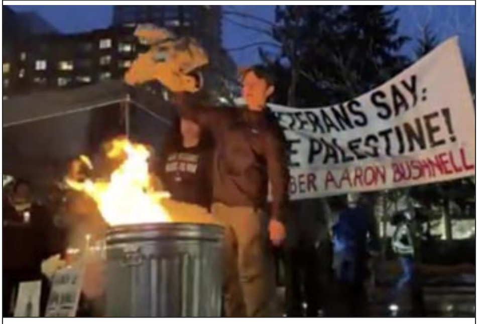
Portland, Oregon (USA) February 28, 2024

Communists know this. In Russia, soldiers joined with workers to overthrow the Czar in 1917 and fight for Soviet power. This taught communists around the world that