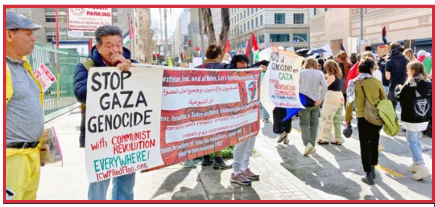
Hundreds eagerly took the new ICWP Gaza pamphlet at the March 2 rallies. In LA and Seattle, we distributed every copy we had, and could have given out many more.

Israeli soldiers stand by while settlers burn Palestinian cars and houses, block roads, destroy olive trees, seize farmland, and kill peo-