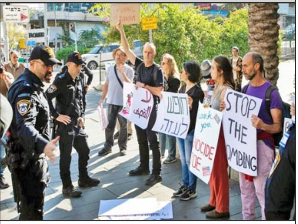
Police suppress a protest against Israel's war on Gaza in Haifa, (Israel) December 15, 2023