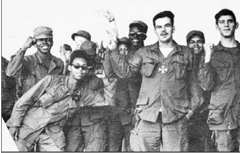
October 8, 1972, sailors mutinied on the USS Kitty Hawk in the Subic Bay naval base in the Philippines during the Vietnam War.

One suggested writing a leaflet aimed at the sailors. Another pro-