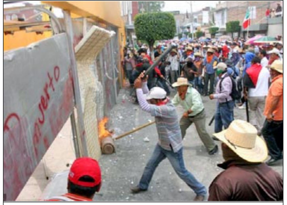
Mexico: Teachers attack offices of electoral parties

Workers must break the prisons of their own exploitative workplace and the prisons of unions to which the capitalists have subjected them. We must participate in protests against the massacre in Gaza, in the obstruction of ships carrying armaments, and both economic and political strikes, to fight to turn the imperialists' battles into revolution for communism.