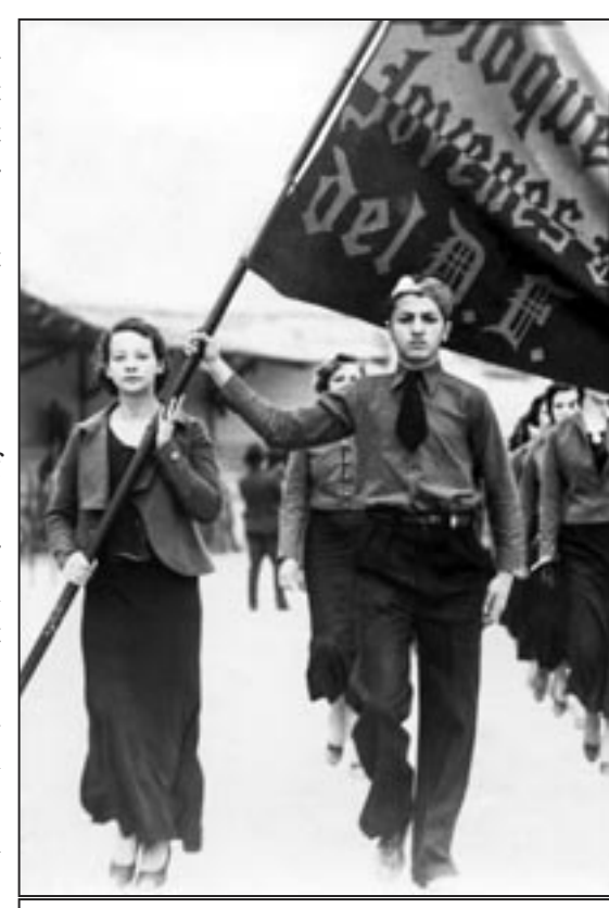
Mexico City, 1930s: Anti-Fascist Youth "Red Shirts"

Now, when the great imperialist powers China and the US are fighting for control of the world's markets, fascist groups are growing. The rulers' biggest fear is that the masses will unite against their imperialist wars and their system in crisis for revolution to establish real communism. That will end their bloody rule forever. That's why they work overtime to build fascist