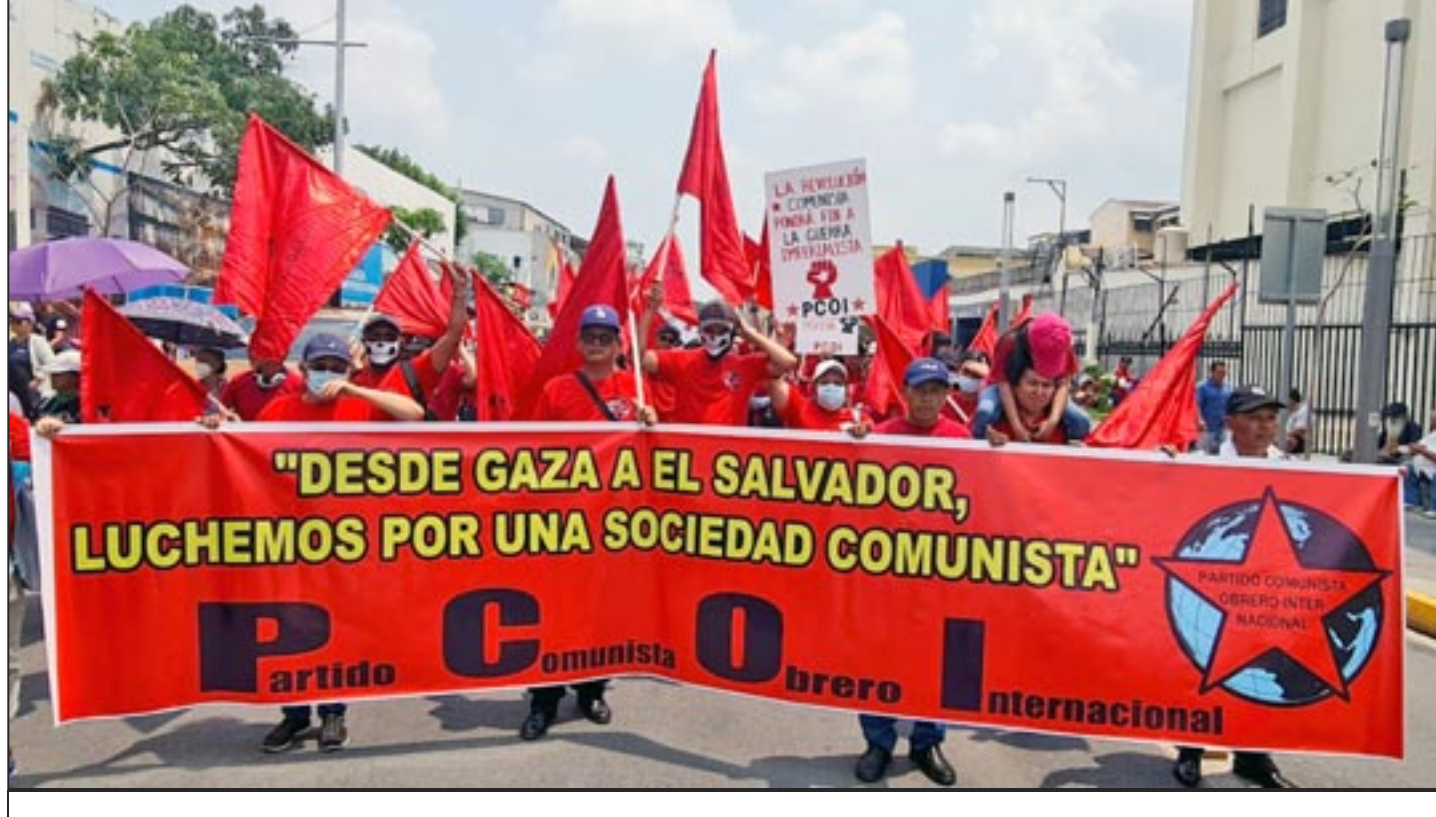
May Day, El Salvador 2024

The communist revolution needs you! Join ICWP today! Long live communism!