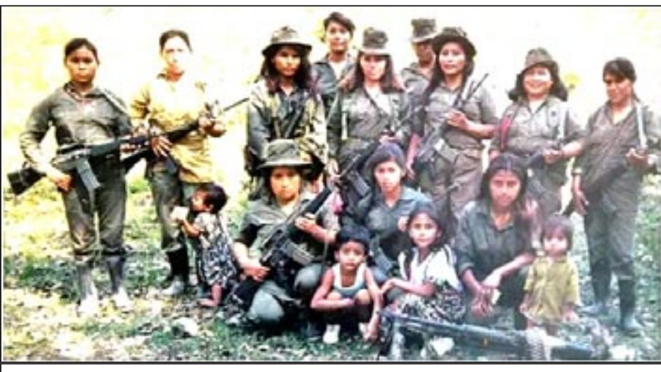
Guerrilla fighters in Guatemala

A Palestinian student presented much of this information. Her talk broadened the discussion from "Free Palestine!" to imperialism in relation to capitalism. However,