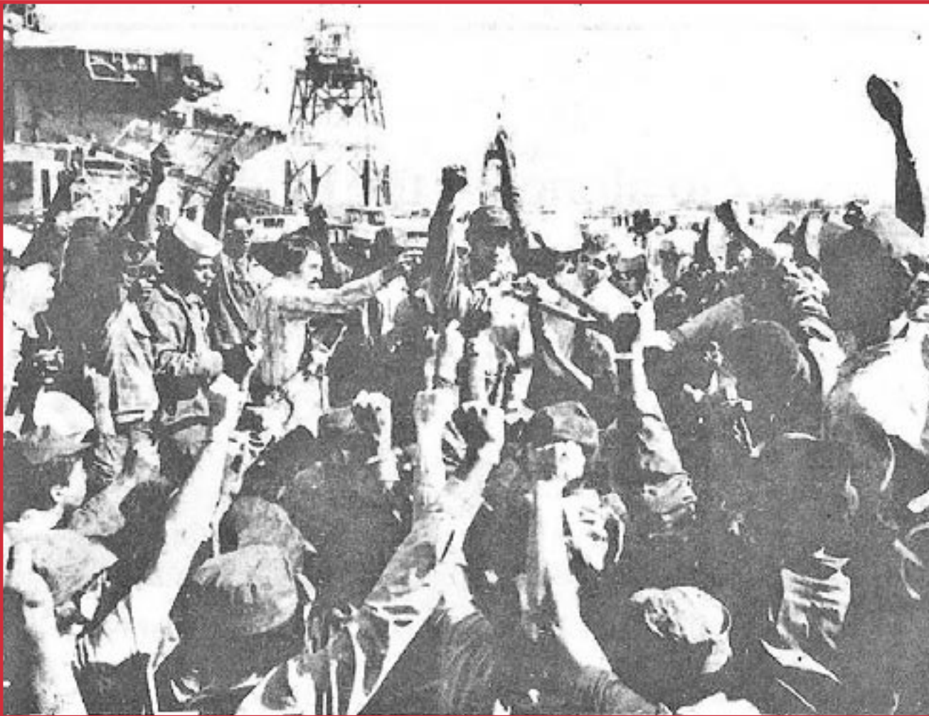
On November 9, 1972, during the US War on Vietnam, 132 sailors, mostly Black, refused to reboard the ship USS Constellation in San Diego. They were protesting racist practices on the ship, part of a Pacific-wide rebellion during the US War on Vietnam.

This time let's keep our eyes on the prize. Workers and soldiers can free our class to build a communist society based on collective production for our needs, never for profit. Join us!