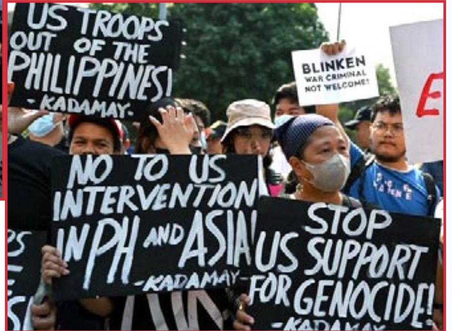
Manila, The Philippines, March 2024