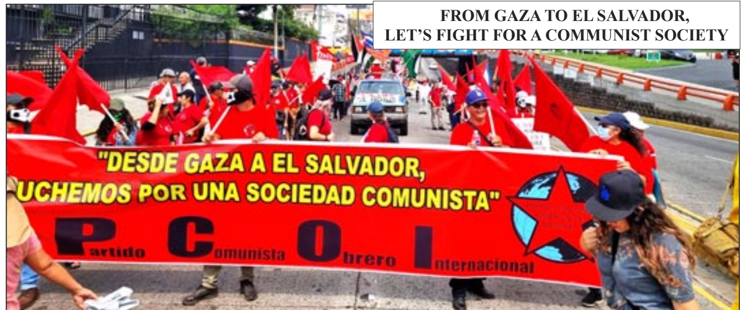
FROM GAZA TO EL SALVADOR, LET’S FIGHT FOR A COMMUNIST SOCIETY

This also allows the presence of the police in the schools. This is now part of the daily life of students and teachers. It is a situation that should not be normalized. As communists we must fight to mobilize the masses for communist educa-