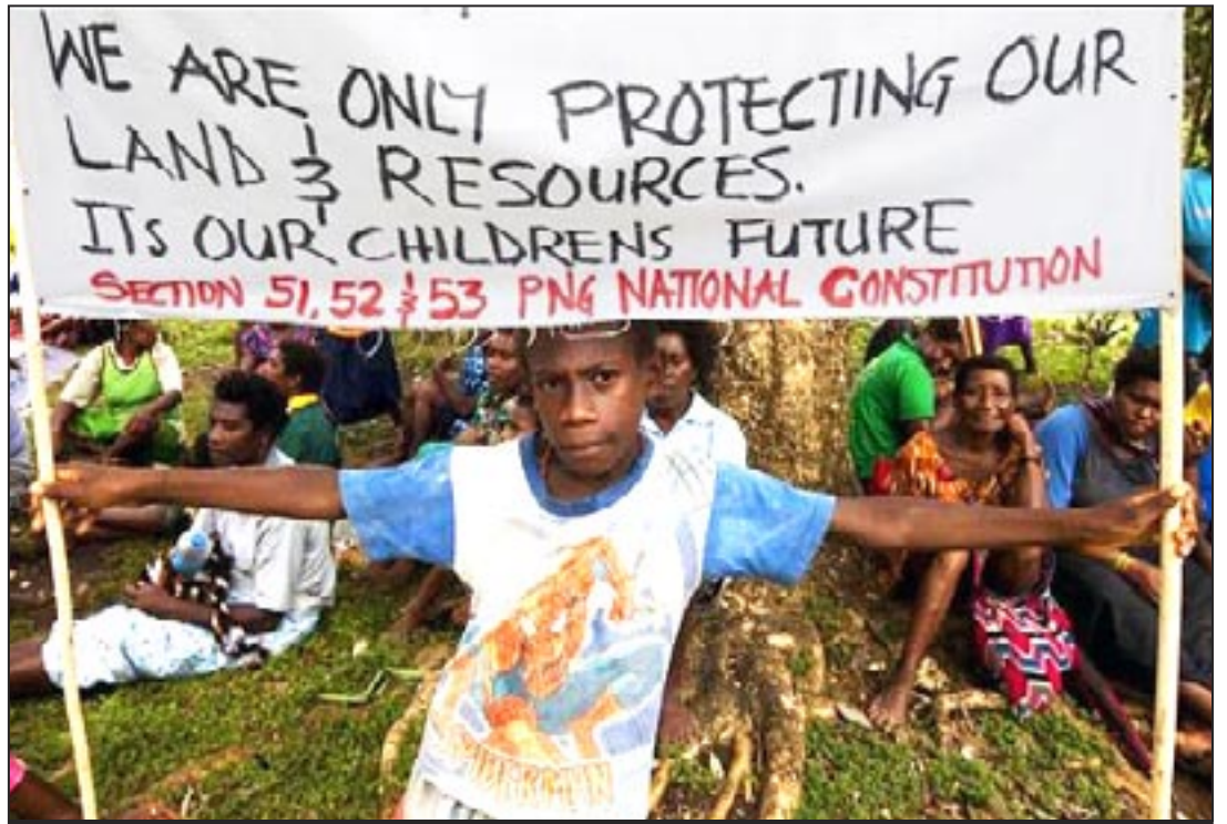
Papua New Guinea Climate Protest 2012

Capitalists try to make us believe they can reform their system to solve their climate crisis. Sometimes it’s “greenwashing.” That means lying about supposed environmental benefits of a product so companies can continue polluting while profiting off well-intentioned consumers.