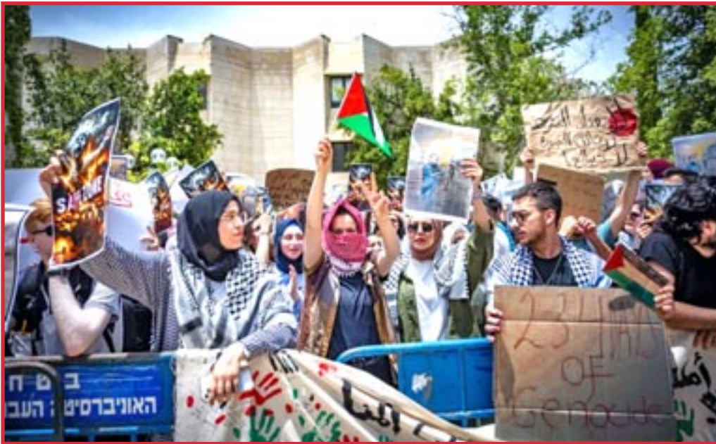
Hebrew University, Jerusalem, May 2024

THE INTERNATIONAL COMMUNIST WORKERS' PARTY ★ WWW.ICWPREDFLAG.ORG