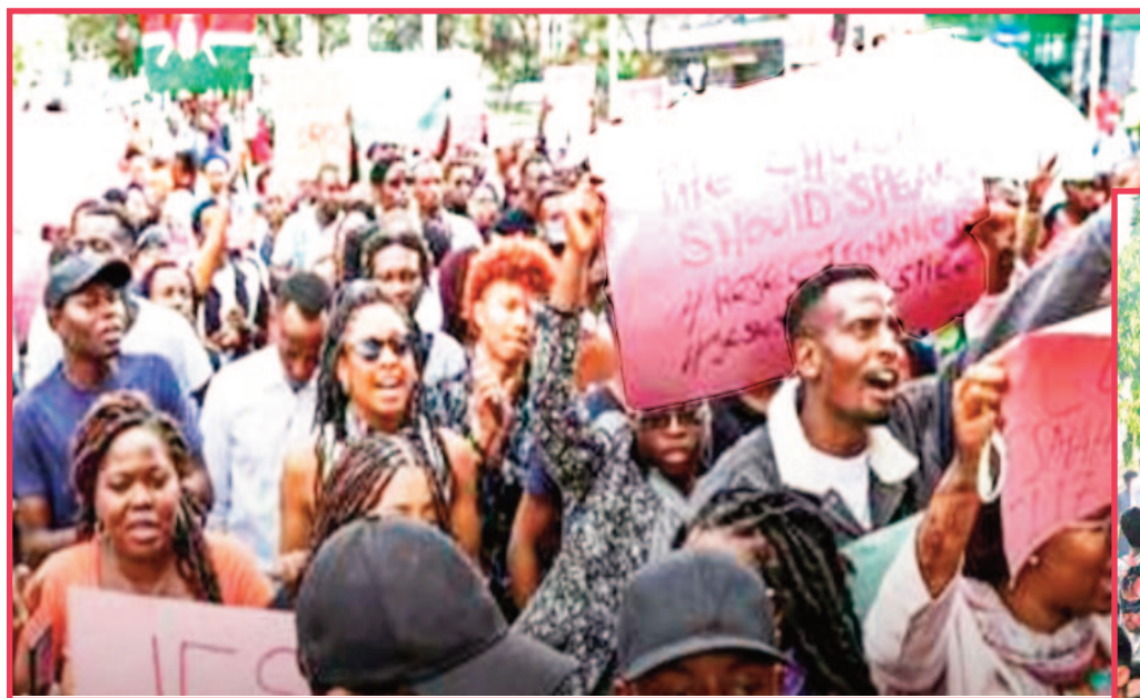
Nairobi, Kenya, June 23, 2024