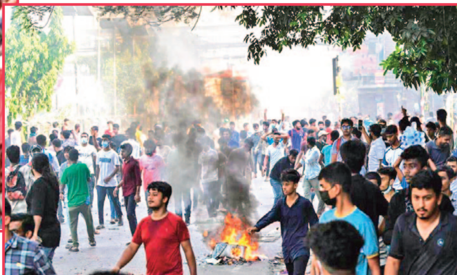
Dhaka, Bangladesh, July 18, 2024