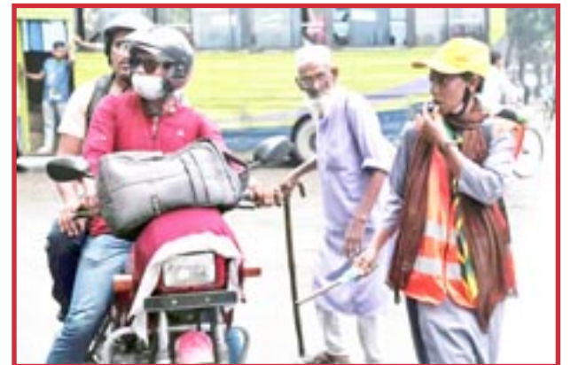
Dhaka, Bangladesh, August 2024: Young woman directing traffic

The US is Bangladesh's largest destination for garment exports. US investors already control much of Bangladesh's capital. US strategists want a long “interim” period (up to three years) of “party building” before elections are held. This would allow the development of pro-US political formations that could prevent a return to the old pro-India, pro-China political bureaucracy