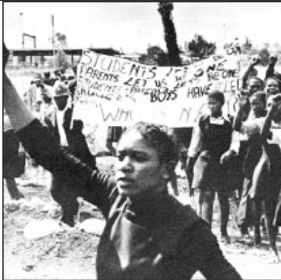
Soweto, South Africa, 1976: Students and youth have an important role to play in the revolutionary struggle for communism.

I'm a high school student. I joined the party after May Day. I'm the youngest in our group. Even