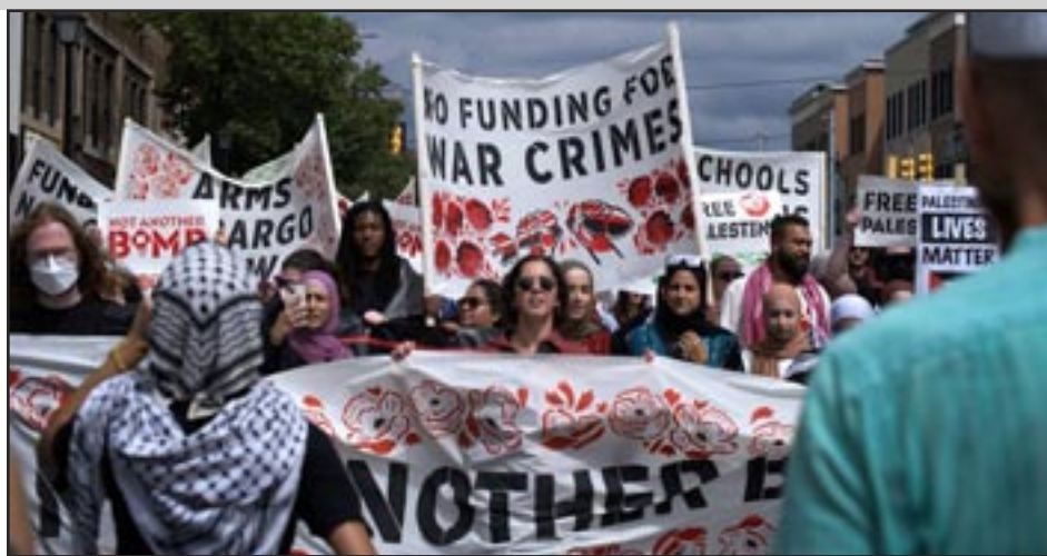
Dearborn, Michigan, USA, August 18—Pro-Palestinian protesters demonstrate ahead of the Democratic National Convention

A major highlight was the commitments made by comrades in the US and one in South Africa to con-