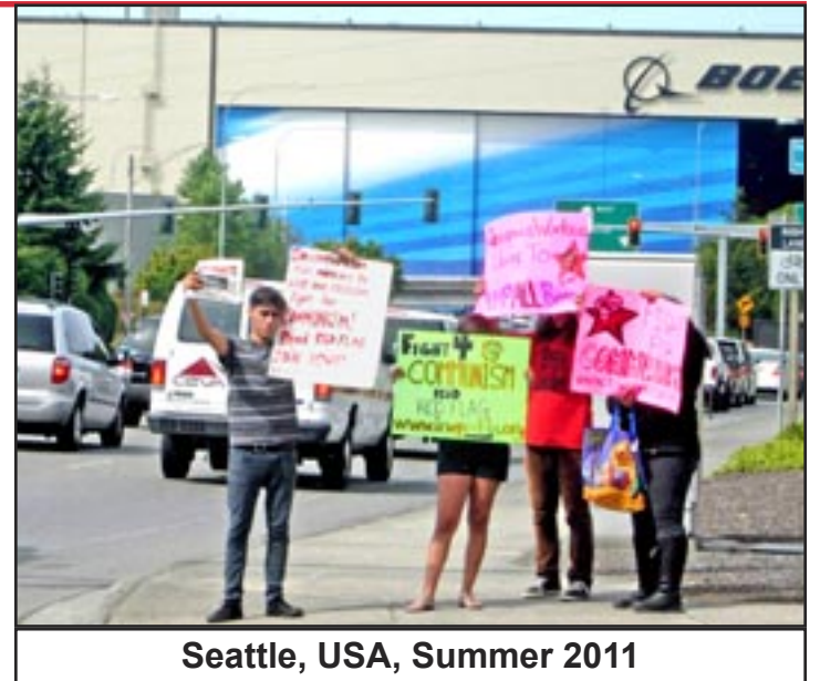
Seattle, USA, Summer 2011

Join the International Communist Workers' Party (ICWP) to embrace revolutionary communism instead of reformist trade-unionism! We have already distributed over 300 copies of Red Flag newspaper at the Renton plant. Many insightful discussions among comrades and Boeing workers out-