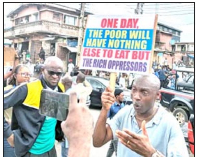
LAGOS (Nigeria), August 2— Thousands of workers, Muslim and Christian, joined to protest the skyrocketing cost of living and the flagrant corruption of the Tinubu government, which is strengthening Nigeria’s ties with Chinese imperialism.

PLEASE SEND YOUR LETTERS, RESPONSES AND SUGGESTIONS TO ICWPREDFLAG@NYM.HUSH.COM