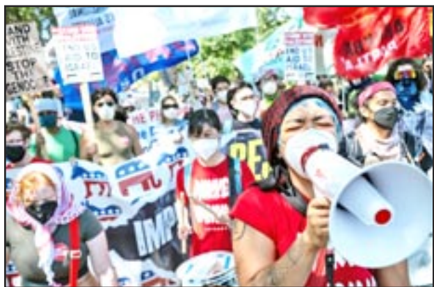
Chicago, USA, August 20—Protest at Democratic National Convention

fornia, Harris supported mass incarceration policies which specifically targeted Black men. She also targeted Black women due to penalties for child truancy which resulted in working-class parents serving jail time.