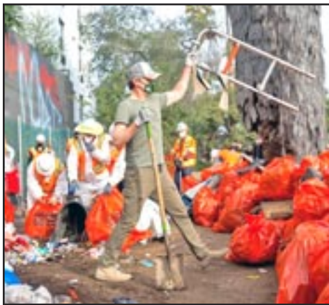
California Governor Gavin Newsom

And it will continue to levy this punishment until the only true solution can be achieved: “intifada, revolution!”