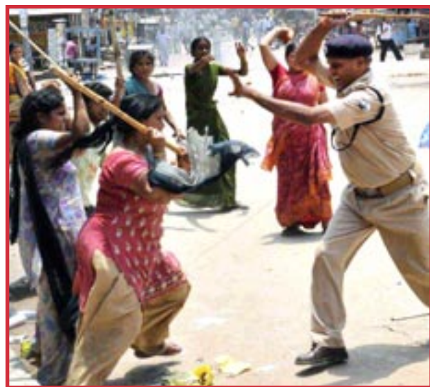
Dhaka, Bangladesh, May 2013—Women garment workers fight police attacks on workers' struggles. Garment workers in South Asia have a long and valiant history of militant class struggle

The Bangladesh uprising shows how the conditions for communist revolution are developing rapidly. Our responsibility, and our privilege, is to build the ICWP to realize that potential.