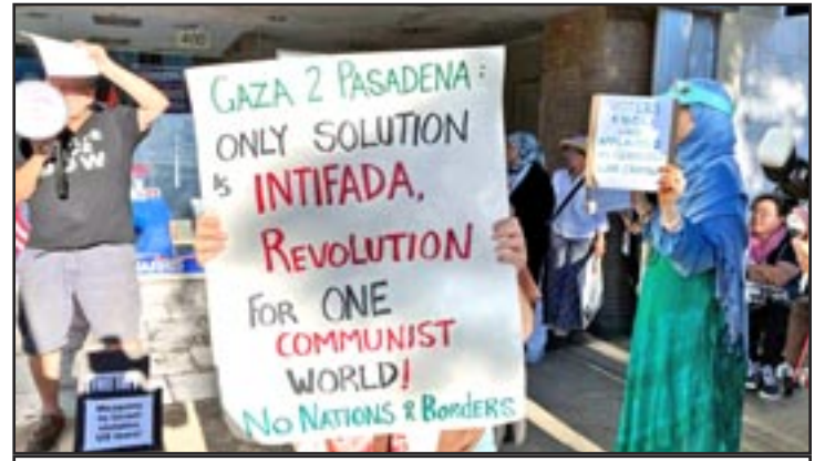
Pasadena, USA, August 19—Protest at Democratic Party Headquarters

“If you’re not for Biden or Harris, that means you are voting for Trump,” a comrade was told. This is a false idea. We don’t need to pick a side between two parties that represent the US capitalist imperialism. We must reject this system altogether. Workers of the world