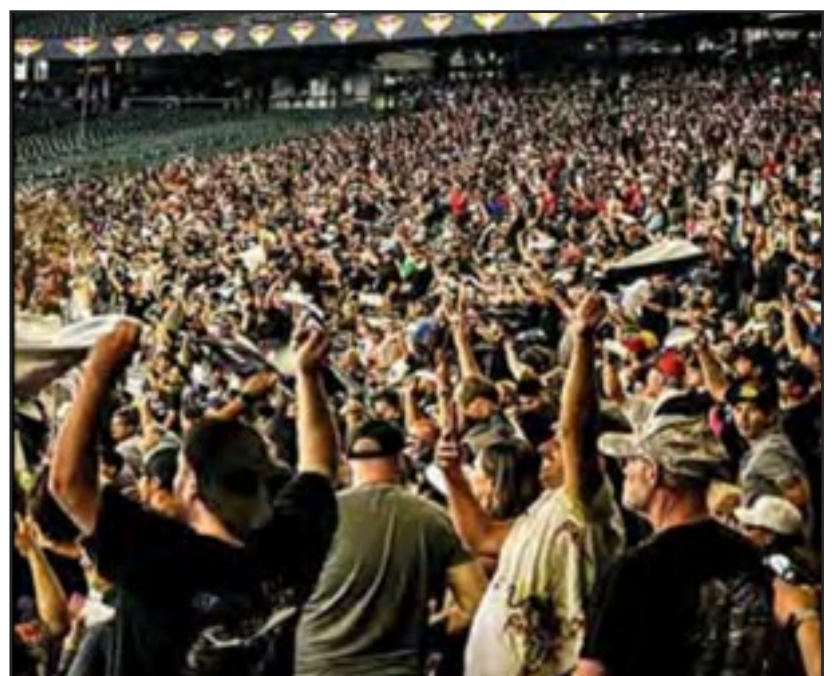
SEATTLE (USA), July 17, 2024— Boeing workers, members of the International Association of Machinists, vote overwhelmingly to authorize a strike.