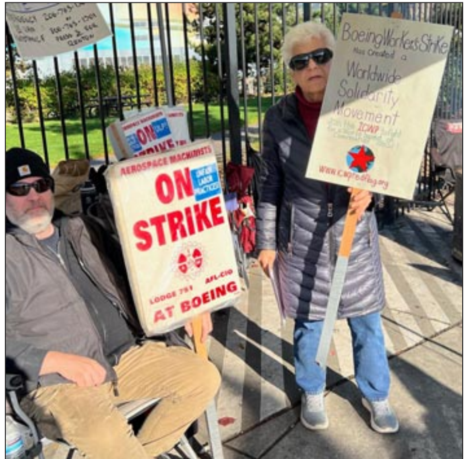
Boeing Renton plant (WA, USA), Oct. 22 The ICWP international solidarity leaflet was warmly received by Boeing strikers. This led to discussions about how inspiring the strike is to workers worldwide.

This is a message of solidarity with the workers of Boeing, who are currently on strike over a contract that does not meet the work-