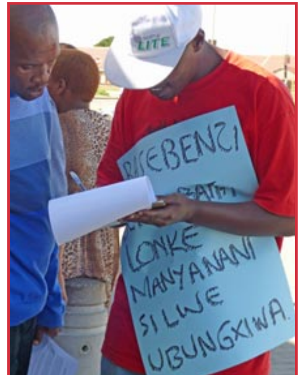
“Workers of the World, Unite for Communist Revolution”