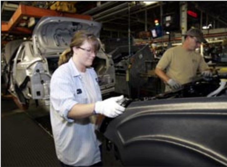
LABOR CREATES ALL VALUE

The working class should not be fooled by one group of imperialists or the other. Instead, we should organize globally against them all. The auto industry is key at this time of accelerating world war. Many of these factories will be used to build tanks or other tools of war. By building ICWP there, we can make those tanks available for communist revolution. Let’s start those collectives by helping to distribute Red Flag and building communist relations with these workers.