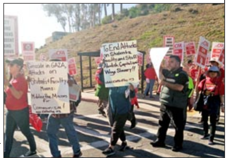
ICWP on picket lines in December 2023 at Cal State LA