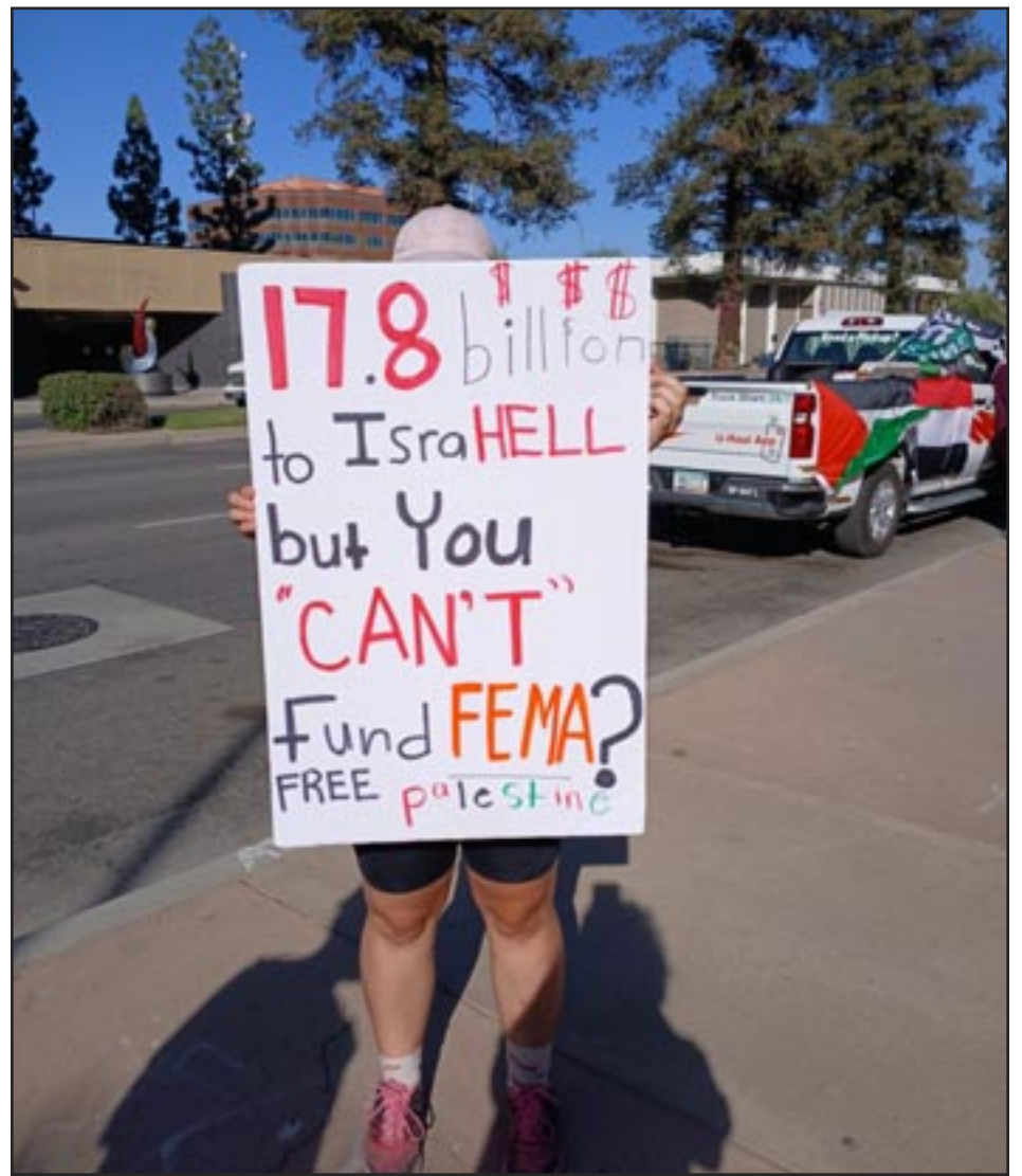
This sign at a recent demonstration against Genocide in Gaza correctly links the deaths and power outages during Hurricanes Helene and Milton and FEMA's slow response and underfunding to the $billions the US is spending for weapons to Israel to commit genocide. The imperialists attack US workers to attack the Palestinian masses! The sign calls for “Free Palestine,” a goal that can only be met with communist revolution.

Some in the bosses’ media claim that FEMA has no money to help hurricane victims because it used all