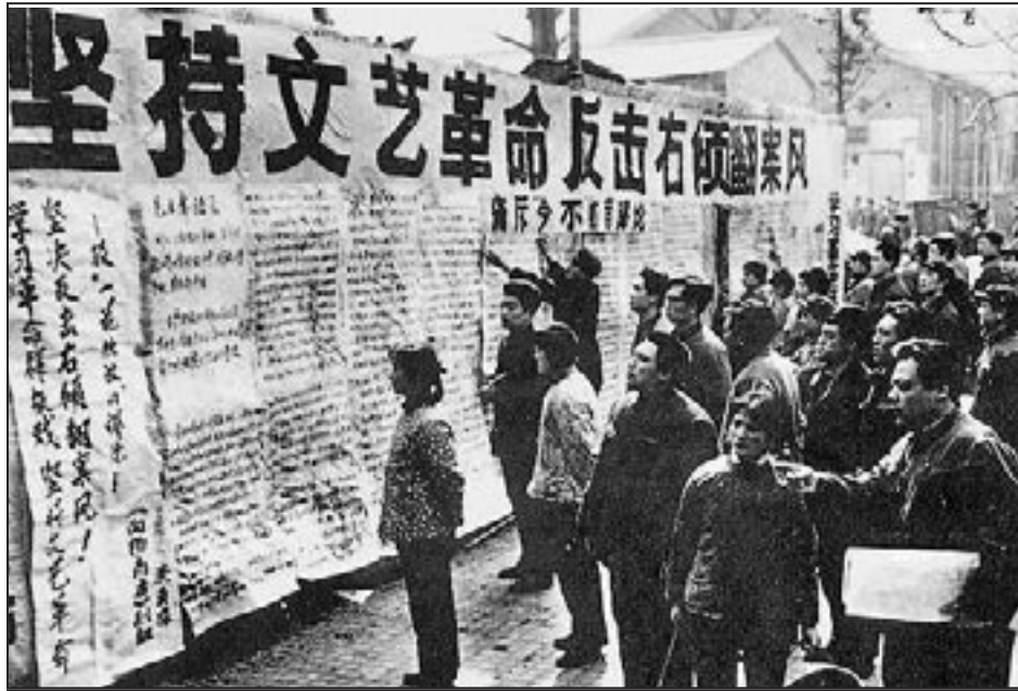
1967: The Chinese Great Proletarian Cultural Revolution.