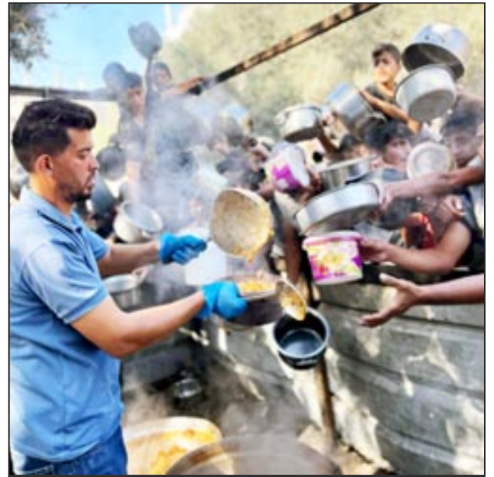
November 13— The volunteer-run Gaza Soup Kitchen in Al Zawaida continues to serve food and deliver water under incredibly difficult conditions: “Together, we continue to press forward, ensuring that no one is left without essential resources, no matter how difficult the journey.”

We will build a Red Army to defeat the capitalists and imperialists. The Red Army needs the clear goal of communist production for need,