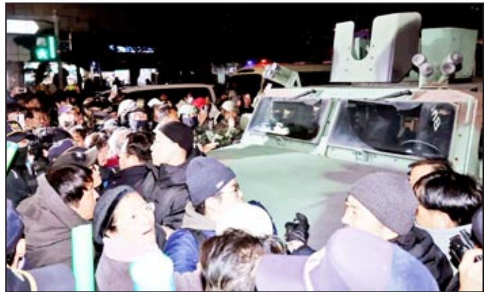
December 3—Thousands fought cops and surrounded army vehicles in South Korea in defiance of President Yoon’s declaration of martial law. He claimed that opposition parties were sympathizers of North Korea and dangerous to his pro-US regime. Six hours later, after the parliament voted against the declaration, Yoon backed down. Now he faces impeachment. Workers and students in South Korea have long fought bravely and militantly in the face of harsh repression. We urge them, and their supporters everywhere, to fight for communism, the only real solution.

The workers of the world need to unite to bury all these murderous imperialists. To mobilize to turn their coming world war into communist revolutions everywhere. Building ICWP collectives to unite workers, soldiers, and youth for communist revolution. We will win!