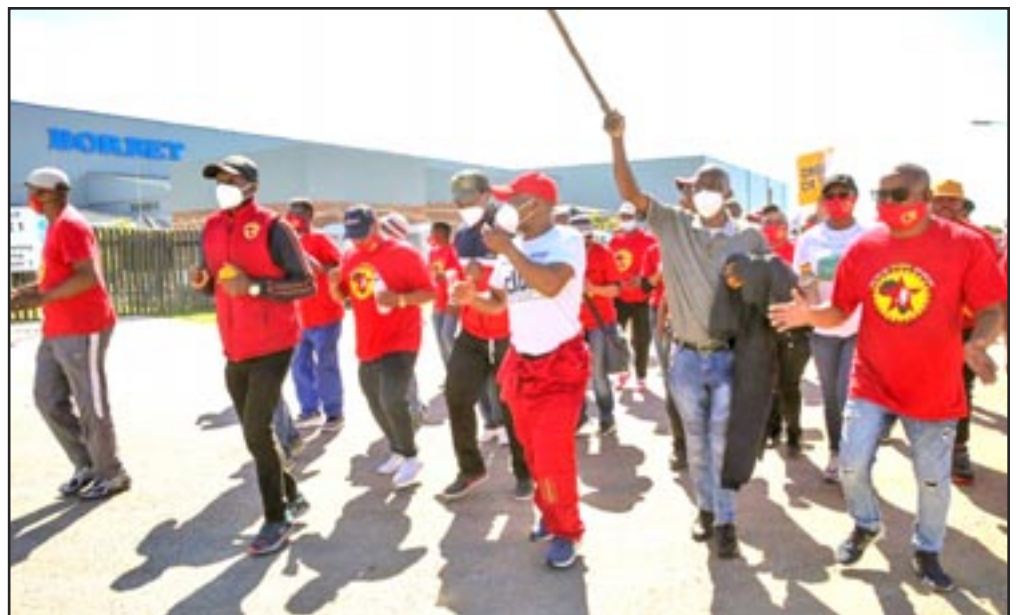
November 14 – Workers strike against retrenchment (layoffs) of 107 workers from the ArcelorMittal South Africa plant south of Johannesburg. Officials of the National Union of Metalworkers of South Africa (NUMSA) called the strike off after six days, citing "the dire situation facing the business." What about the dire situation facing the workers? Trade unions can't and won't solve our problems. Join the ICWP to end capitalist wage slavery and unemployment!