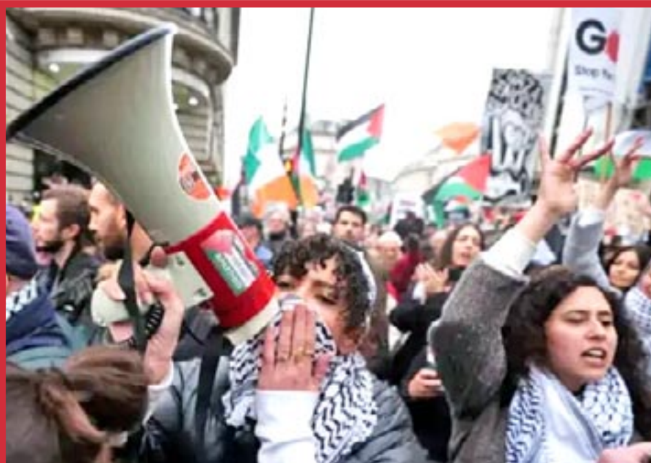
London, November 29—100,000 people march in International Day of Solidarity with Palestine

THE INTERNATIONAL COMMUNIST WORKERS' PARTY ☆ WWW.ICWPREDFLAG.ORG