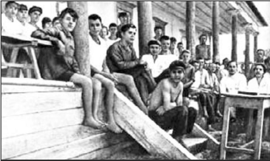
Soon after the Russian Revolution, communists founded the Gorky Colony. Young people, formerly on the streets, built a labor and education collective. They were able to see a different “human nature” through working and studying together.

The only way to defeat trade union lies is to spread communist politics, building personal and political relationships amidst class struggle. This is not an individual endeavor. It is a campaign to build rock-solid party collectives to lead the fight for communist revolution.