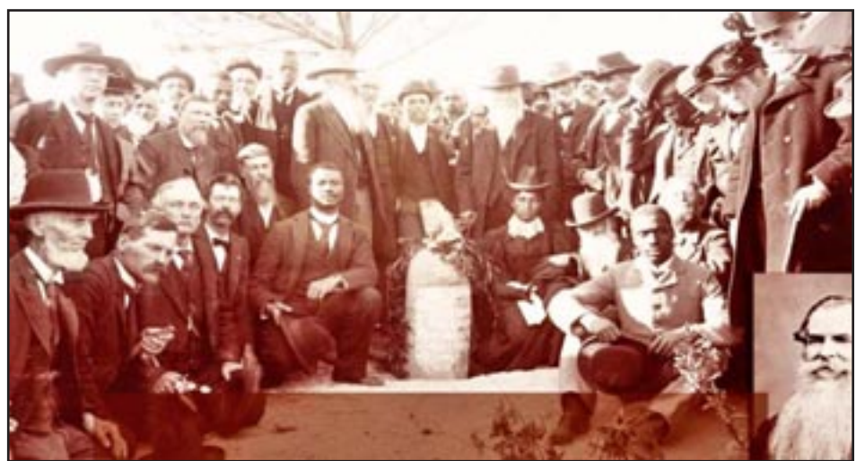
After the Civil War, the white abolitionist Owen Brown, son of John Brown, moved to Pasadena and then Altadena. Many there celebrated him as the last surviving participant in the Harper's Ferry raid. He remained active in his own ways, including hiring Chinese laborers to protest the racist Chinese Exclusion Act. Masses attended his funeral. His Altadena grave drew a steady stream of pilgrims, down to the present.