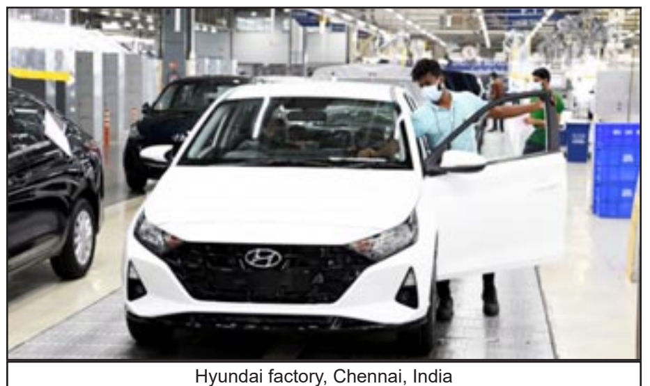
Hyundai factory, Chennai, India

The nature of capitalism requires maximum profit, destroying smaller capitalist enterprises. In the EV car industry, the more prominent capitalists buy smaller capitalists and eliminate the ones that can’t compete. The biggest EV market is dominated by BYD in China and Tesla in the US. Hundreds of companies, like Hyundai, are trying to compete. This global surplus production will lead to war.