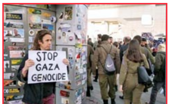
Tel Aviv, protestors denounce genocide at IDF recruitment center.

*IOF = “Israeli Occupation Forces” (officially the Israeli Defense Forces)