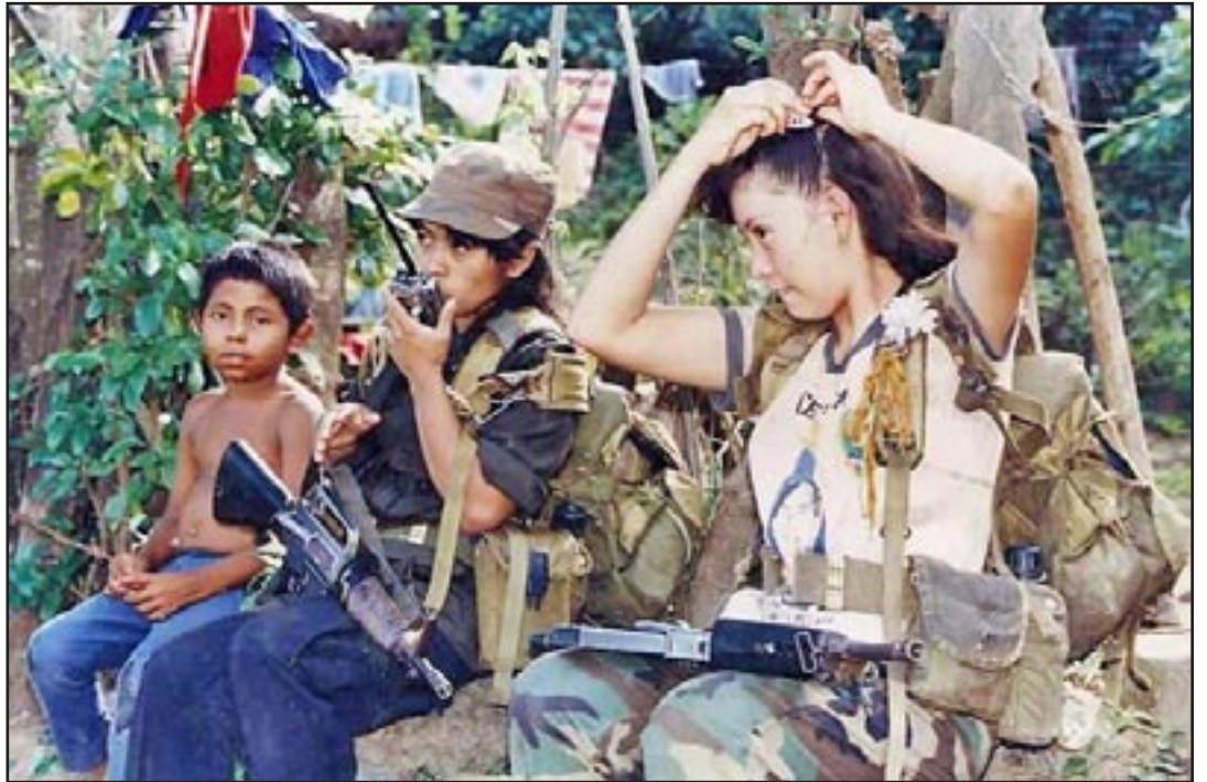
El Salvador: Women guerrilla fighters during the Civil War of the 1980s. The working class is the basis of the Red Army.

In this environment of war and genocide, the ICWP has done important work: distributing communist literature, making contacts, and making the Party line available to the masses. Our base is being consolidated in the work of organizing more comrades into the ranks of I C W P . S o o n e r rather than later, they will form the Red Army.