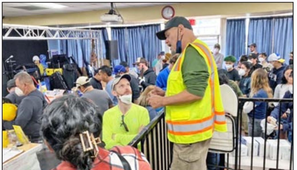
Volunteers organizing at the Pasadena Job Center

That means building the International Communist Workers' Party. Please connect with us. Join and contribute your ideas, your energy, and your skills.