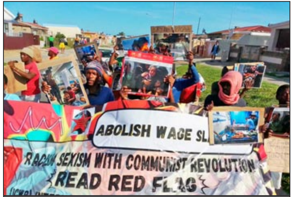
Comrades in Gqeberha, South Africa, denounce genocide in Gaza, November 2023

Children led the First Intifada (uprising) in 1987-1993. Some 90% of boys and 80% of girls were involved, mostly throwing stones at Zionist soldiers. Many were arrested and some were held without charges for up to a year. To this day, hundreds of Palestinian children suffer intolerable conditions in Israeli prisons.