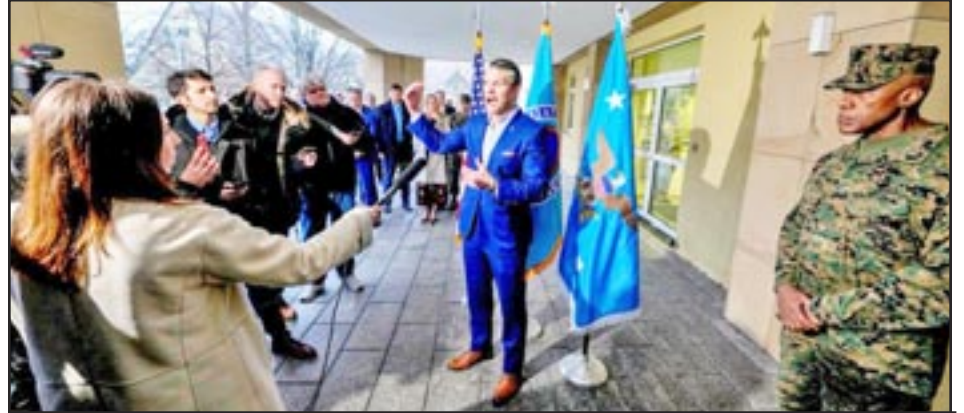
Military families confront US “Defense” Secretary Hegseth in Germany over his attacks on “Diversity, Equity, and Inclusion” as middle-school students walk out on February 12

Meanwhile, “Defense” Secretary Hegseth was met with a walkout of over fifty Patch Middle School US students in Stuttgart, Germany. Separately, their parents heckled and booed Hegseth’s delegation,