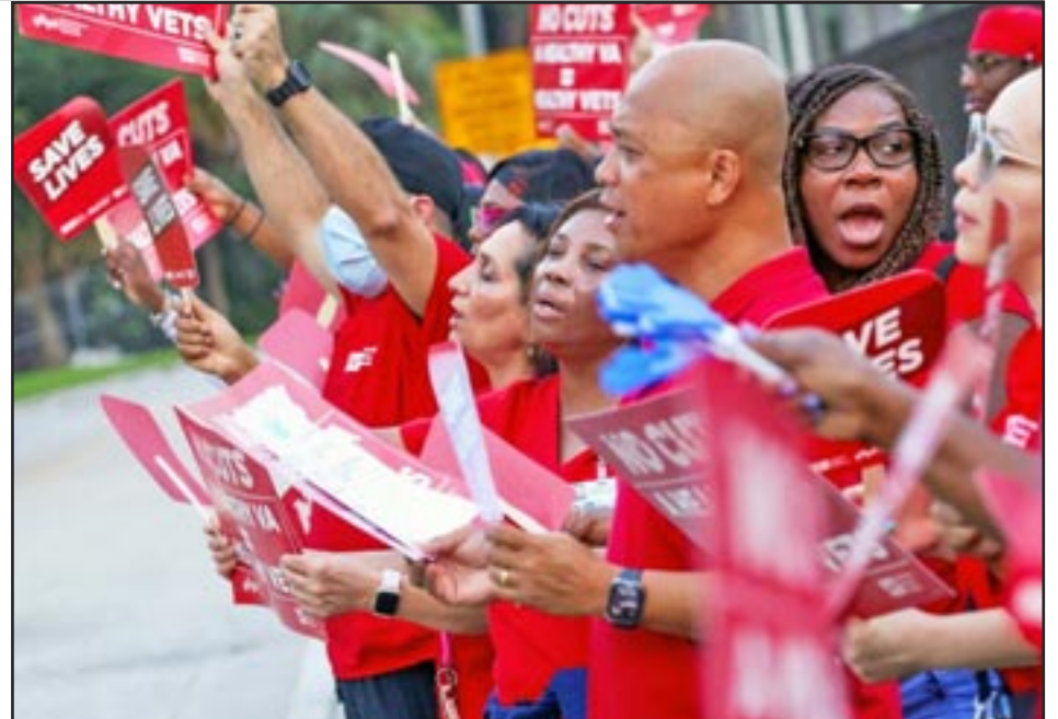
MIAMI (USA), August 2024— Nurses protest hiring freeze and job cuts to Veterans’ Administration hospitals.

The crisis should serve as a wake-up call. The failures of the VA healthcare system are not just the result of poor leadership or bureaucratic inefficiency. They are symptoms of a larger problem. The VA’s struggles are one example of how capitalism fails the working class, highlighting the urgent need for systemic change.