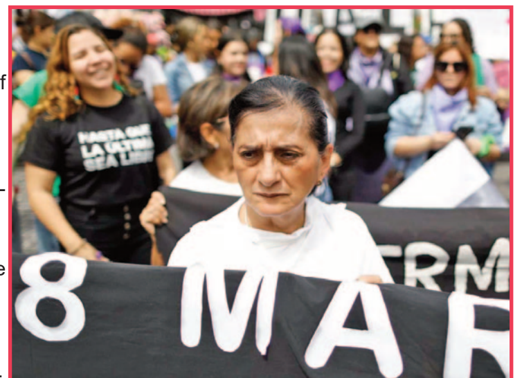
CARACAS (Venezuela), march 8— Public hospital nurses march on International Women's Day for higher wages. They and all workers need to fight to end wage slavery altogether.

comrades — and more papers! — Seattle Comrade