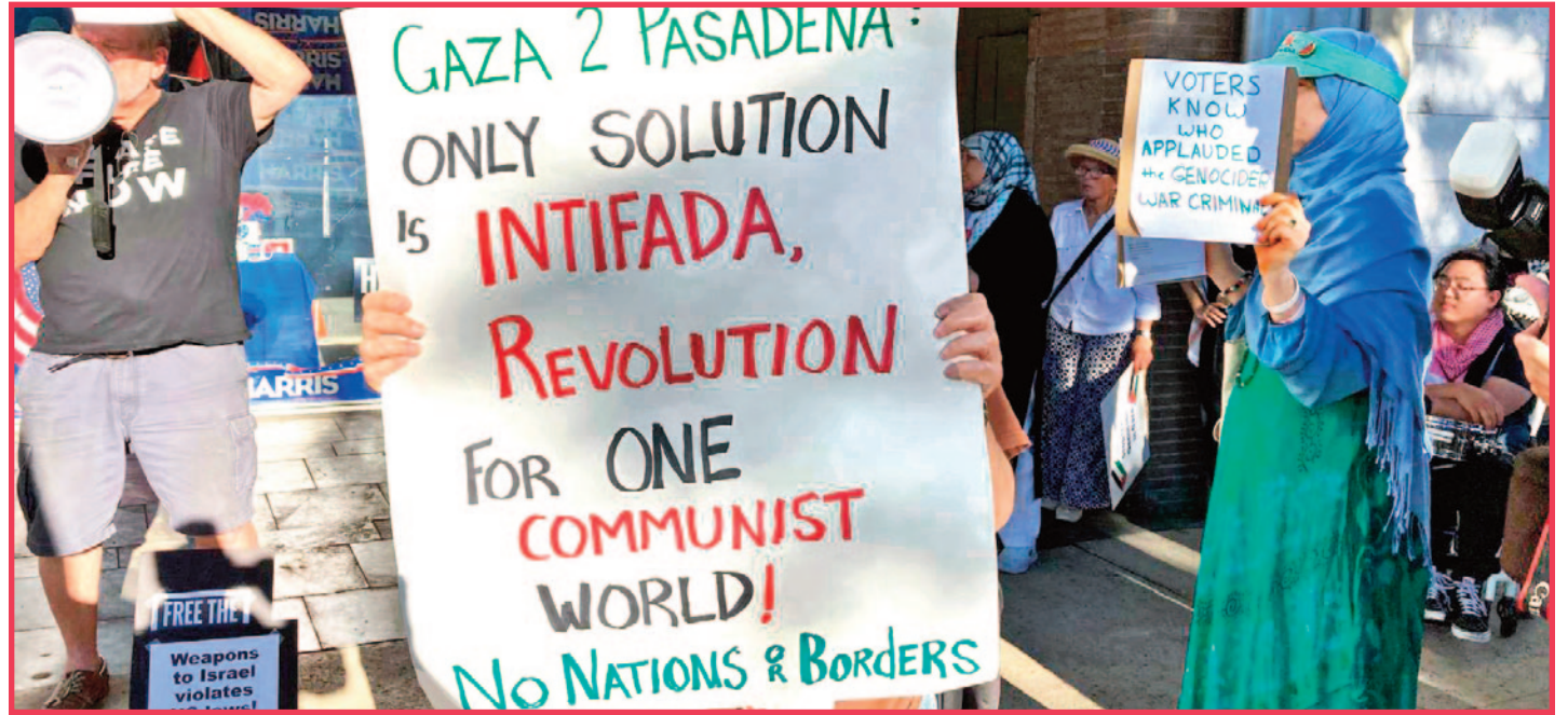
Pasadena (USA), August 19, 2024

The 1948 Nakba (Catastrophe) violently forced over 750,000 people from their homes, land, and villages. That was half or more of Palestine’s mainly Arab population. Most, and their descendants, ended up in refugee camps in Gaza, the West Bank, Syria, Jordan, and Lebanon. Once mainly independent farmers, they became