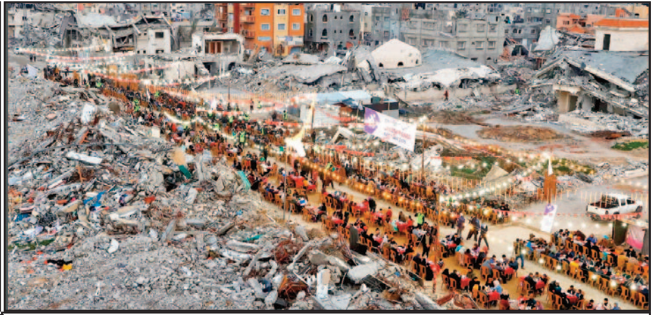
March 1, Rafah, Gaza—Volunteers organize a collective Iftar dinner among the rubble with 5000 people to break the fast on the first day of Ramadan.

These images emphasize unity, collectivity, and courage in the face of an ongoing genocide. The fascist Zionist government, backed as always by the US rulers, has refused to move forward with the negotiated second stage of the ceasefire. Instead, it has used armed tractors, the last gift of the Biden administration, to attack Palestinians in the occupied West Bank. At least 40,000 people have been displaced so far this year in Israel's "Operation Iron Wall."