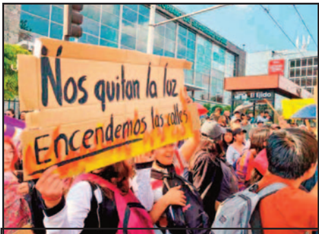
Ecuador, November 15, 2024—"They turn off the lights. We will set the streets on fire."

Ecuador is a bone of contention in the rivalry between US and Chinese imperialism. With the drug war as a pretext, the Ecuadorian government approved using the Galapagos Islands for building a US military base in preparation for its war against China. Chinese imperialists are using multi-million-dollar loans to gain influence in Ecuador, which owes them $14 bil-