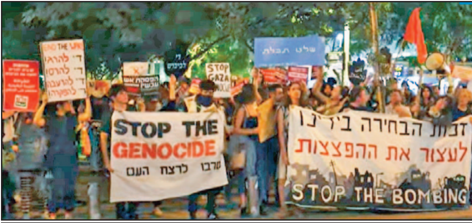
March 3, Tel Aviv, Israel—Jews and Arabs denounce the siege of Gaza imposed by the Zionist government, cutting off the food and electricity.