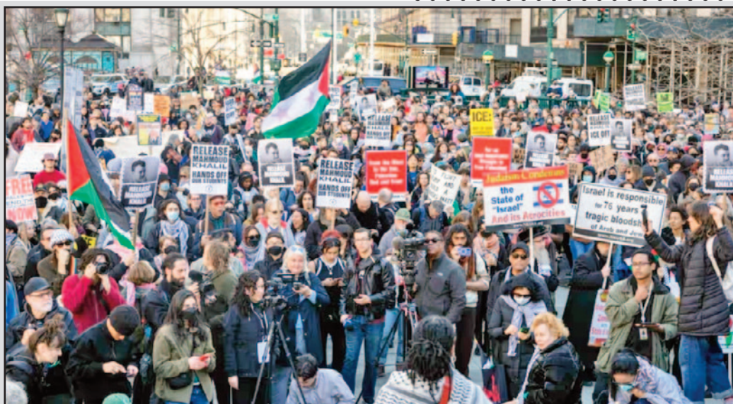
New York City (USA), March 10, 2025

That’s why we must prepare for communist revolution, especially among workers and inside the military. To smash the bosses’ state and build a communist society where the masses govern ourselves and work to meet our collective needs.