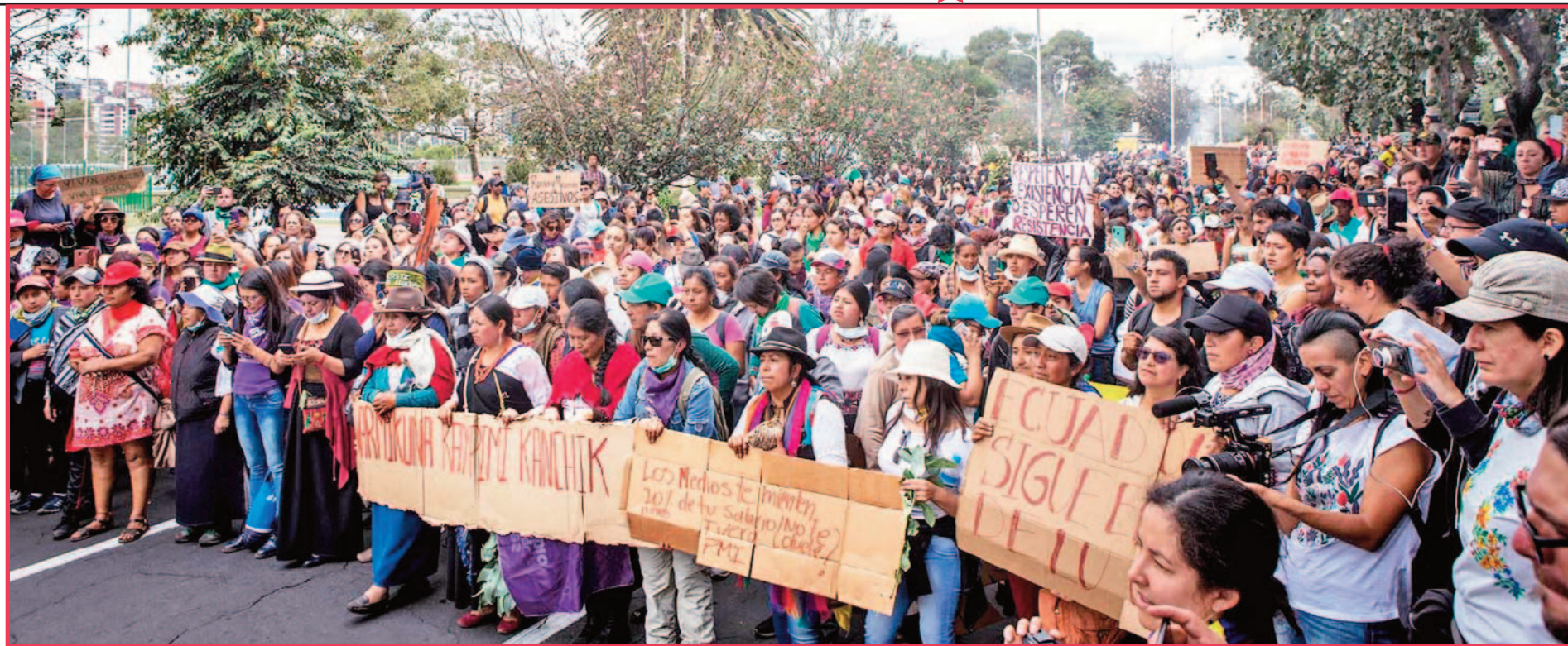
QUITO (Ecuador), 2019 —Thousands of Indigenous people, students, workers, and others protest against the central government's new austerity measures.