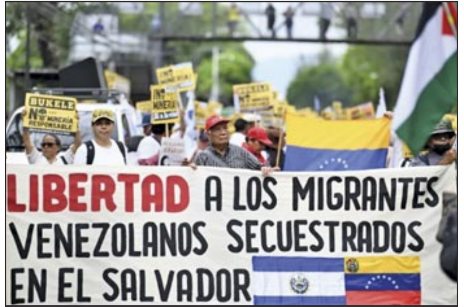
El Salvador, March 25—Protestors demand freedom for Venezuelan migrants deported from the US and an end to metal mining.

Today they have declared themselves in rebellion. They are not at-