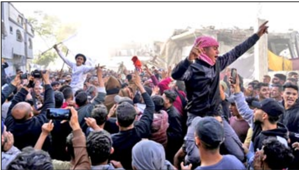
Beit Lahiya, Gaza, March 26, 2025

But mainly, winning a communist world requires building communist relationships within ICWP communist collectives and among wide circles of workers and youth. If this makes sense to you, please get in touch and tell us you are interested in joining – and in organizing others.