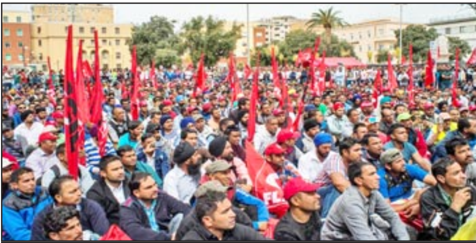
Italy, 2017: Thousands of Punjabi workers rally for higher wages and better working conditions

We will celebrate the spirit of May Day to open the world without borders. Big solutions will come when workers, wherever they are, organize and join the International Communist Workers’ Party. Let us confront this big problem and march on May Day for the big solution: communism.