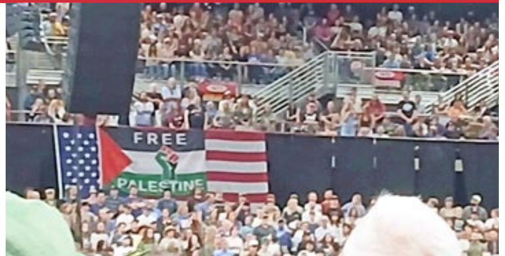
Idaho (USA), April 14—Bernie Sanders spoke in Idaho. Anti-genocide activists unfurled this banner. The crowd applauded, raised their fists. Sanders ignored it. When the police removed it and those carrying it, the crowd booed angrily. Bernie said nothing. We applaud the crowd’s anti-genocide action. Join ICWP and help mobilize for a communist revolution. Only then will Palestinian workers, and all workers be free.

Congress, including Sanders, serves the US imperialists. They are hell bent on supporting Israel’s