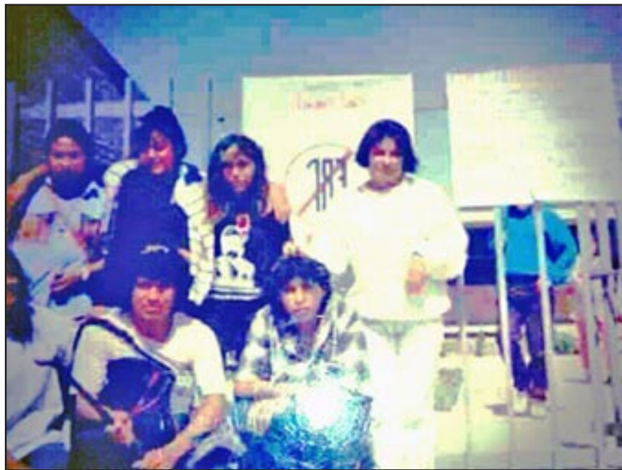
Mexico, 1994: Students supporting the fight against anti-immigrant Proposition 187 in California

Also, immigrants and their children are increasingly necessary for the bosses’ plans for imperialist war. They serve as soldiers, marines, sailors, and airmen. The active-duty military currently contains more than 65,000 immigrants.