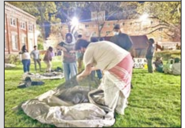
Washington, DC, April 2025: Students at Howard (a traditionally Black university) set up pro-Palestine encampment