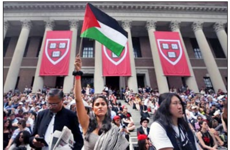
Harvard students walk out of commencement after pro-Palestinian activists denied degrees

“It was only after faculty and alumni mobilized, and after Trump