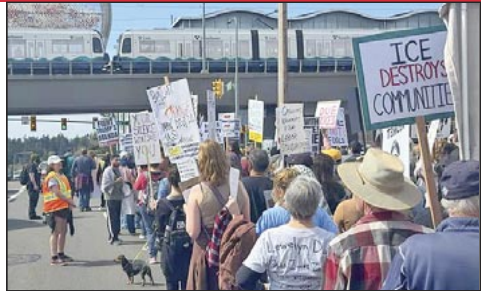
Seattle, US April 2025 Angry demonstrators march to the ICE Federal Detention Center. Many had taken copies of Red Flag .

C has helped spread communist ideas before, but now she is taking initiative. She is advocating for concrete action among the party and her friends. She noted that the attacks on veteran soldiers were not