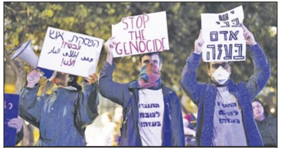
Tel Aviv, January, 2024—Signs in Hebrew and Arabic say “Ceasefire Now”

The Israeli economy is collapsing rapidly. There is no tourism industry. A large number of Israeli citizens have