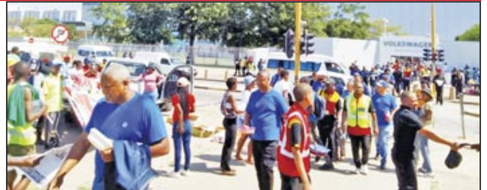
South Africa November 2023-Comrades distributing Red Flag to VW workers

One is a hospital cleaner. She said her work is essential because, without sanitation, the doctors cannot do their jobs. She sees that only communism will create conditions where the healthcare of the masses will be primary. Without money, the