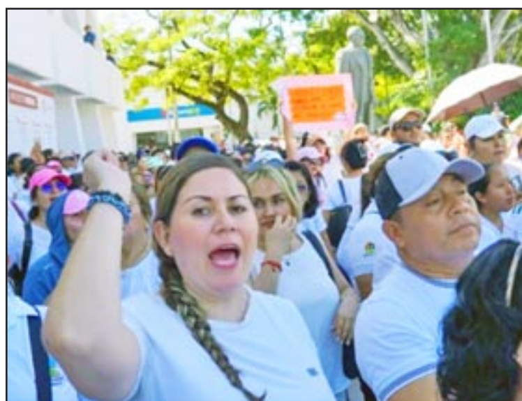
Quintana Roo, Mexico, March 2025: Teachers on strike

geoisie in Mexico and its governments, including Sheinbaum’s, have been skillful in their dealings with US regimes to keep a good part of the surplus value (profit) extracted from Mexican workers’ labor power for themselves.