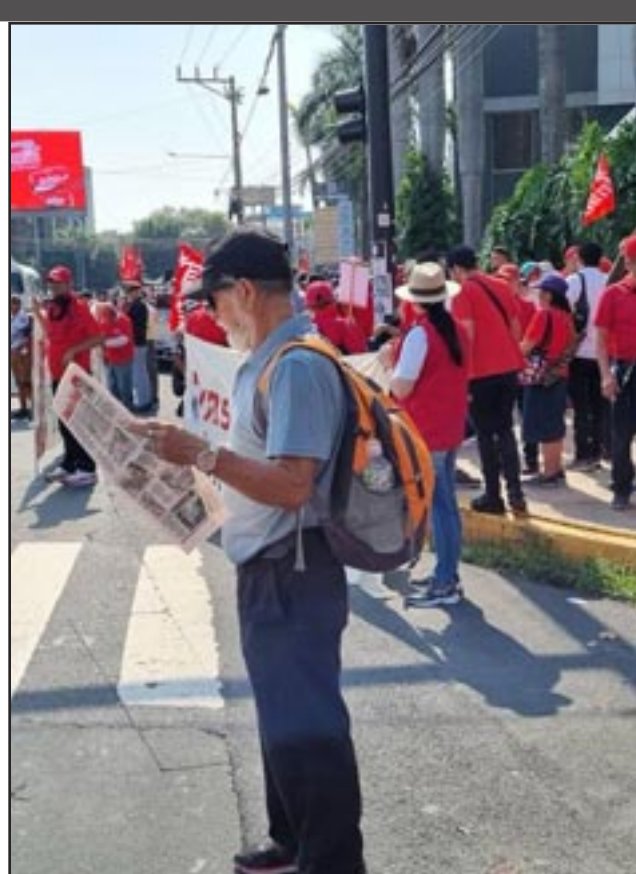
San Salvador, El Salvador, May Day, 2025—Comrades distributed 1200 copies of Red Flag to participants and spectators at the march.