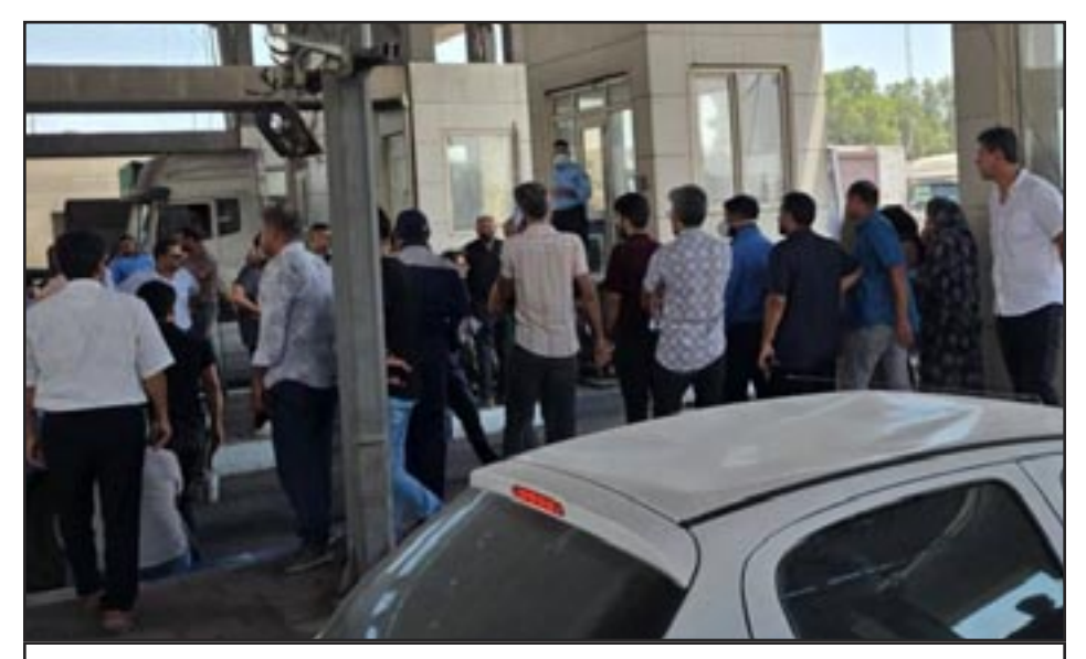
May 3: Families and residents blocked traffic at the port of Bandar Abbas to protest government cover-up of murderous conditions.

The government's sheer lawlessness is publicly exposed. Many workers had no insurance, registration, or identity cards. Thus, many families in Hormozgan and neighboring provinces have lost their loved ones without being able to prove their presence in the work-