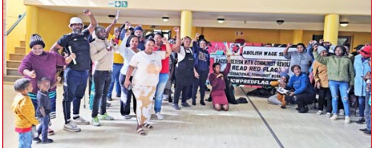
ABOVE: Uitenhenge, May 1: Comrades celebrate May Day

RIGHT: South Africa, May 13—Meeting in Grahamstown, organized by the cousin of a comrade from Port Elizabeth. Forty people, including workers on their lunch break, concerned about drug violence, unemployment and starvation wages, met with ICWP comrades who brought Red Flag. They also contacted soldiers at the local military base.