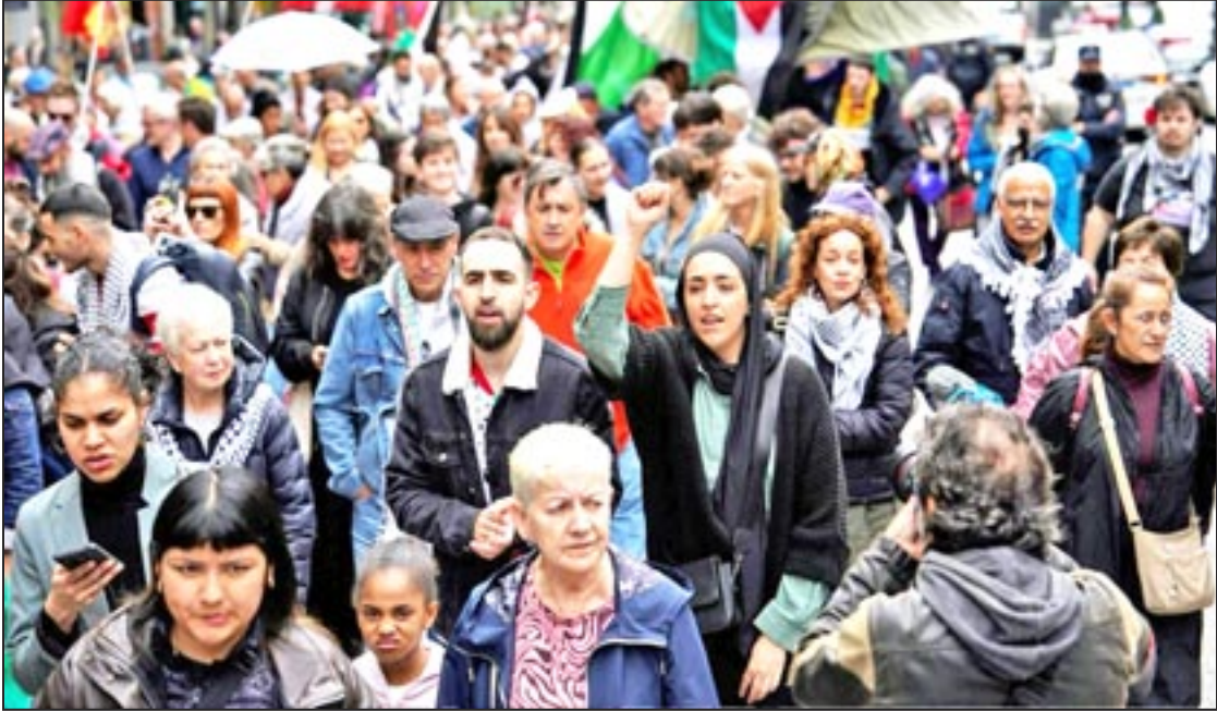
MADRID (Spain), May 15-- Thousands march in solidarity with Palestinians against the Gaza genocide.