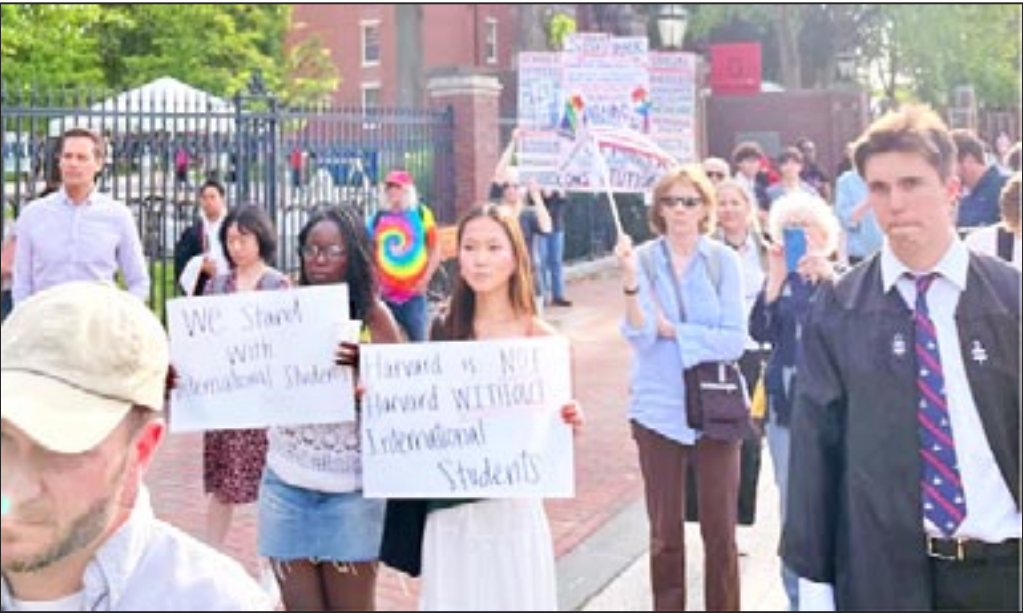
Harvard, May 27—Students demonstrate in solidarity with their international fellow students

power, too. Napalm was invented there. Trump’s funding cuts ended an estimated $180 million in recent military research. US courts are opposing most of Trump’s attacks on Harvard. But, whatever the outcome, the damage to US imperialism has been done. Universities in Hong Kong, India, and elsewhere will welcome students and researchers who Trump scared away. This goes with his attacks on programs like USAID and Voice of America. On European allies. So the “united front to defend academic freedom” turns out to be a defense of post-World War II US imperialist strategy. Trump’s gold-plated “populist” attacks on “elites” aim to build xenophobia. To misdirect mass anger. They won’t put food on the table or pay medical bills. It’s capitalism in crisis – not just Trump-style fascism – that makes life