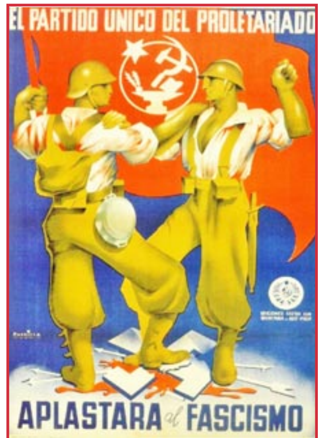
Spain, 1936 "The Only Party of the Proletariat Will Smash Fascism"

"Just as money will be abolished as the material basis of all the evils we are experiencing today, prisons and police will also be abolished. Of course, this will be in a fully de-