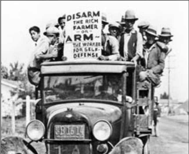
Pixley, CA (US), 1933—In the face of deportation raids and grower violence, Mexican and other agricultural workers joined the Communist Party-led Cannery and Agricultural Workers Industrial Union to fight for higher wages—but not for workers’ power.

ICWP has learned from this history to fight directly for a communist world without borders.