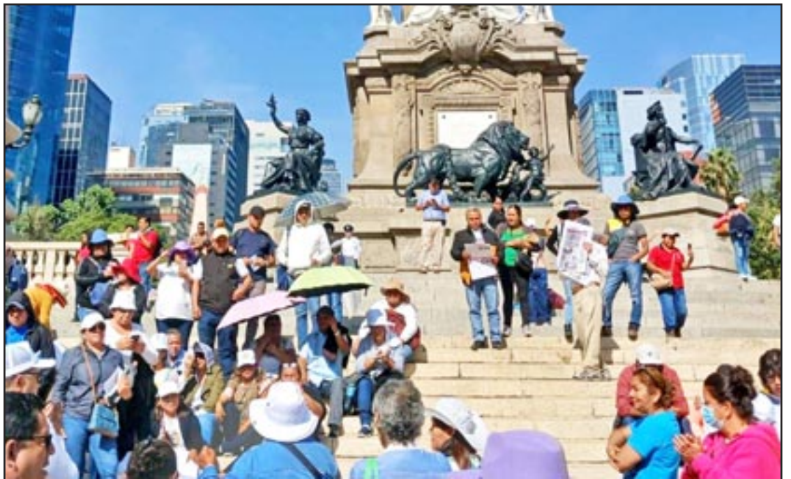
MEXICO CITY, May 15—March of thousands of teachers and school workers who went on strike for better living conditions. Several comrades distributed 400 copies of Red Flag and had very good political discussions.

School workers and teachers are angry and mobilized. How-