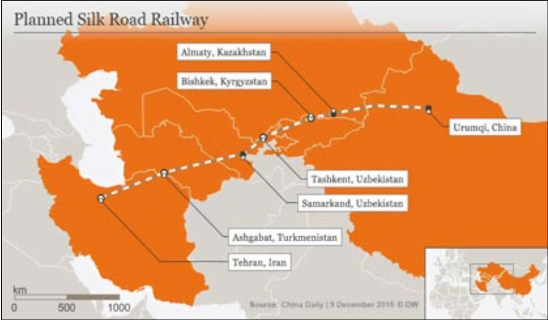
May 24—The new China-Iran rail corridor has been put into operation. The first freight train from Cina arrived in Iran in fifteen days, compared to forty days by sea. Iran can now export oil to China through this corridor. Chinese goods can be on their way to Europe, avoiding the Strait of Malacca and unhindered by the US Navy. This move greatly limits the effect of US imperialist sanctions on Iran and US influence in the region while strengthening Chinese imperialist influence.