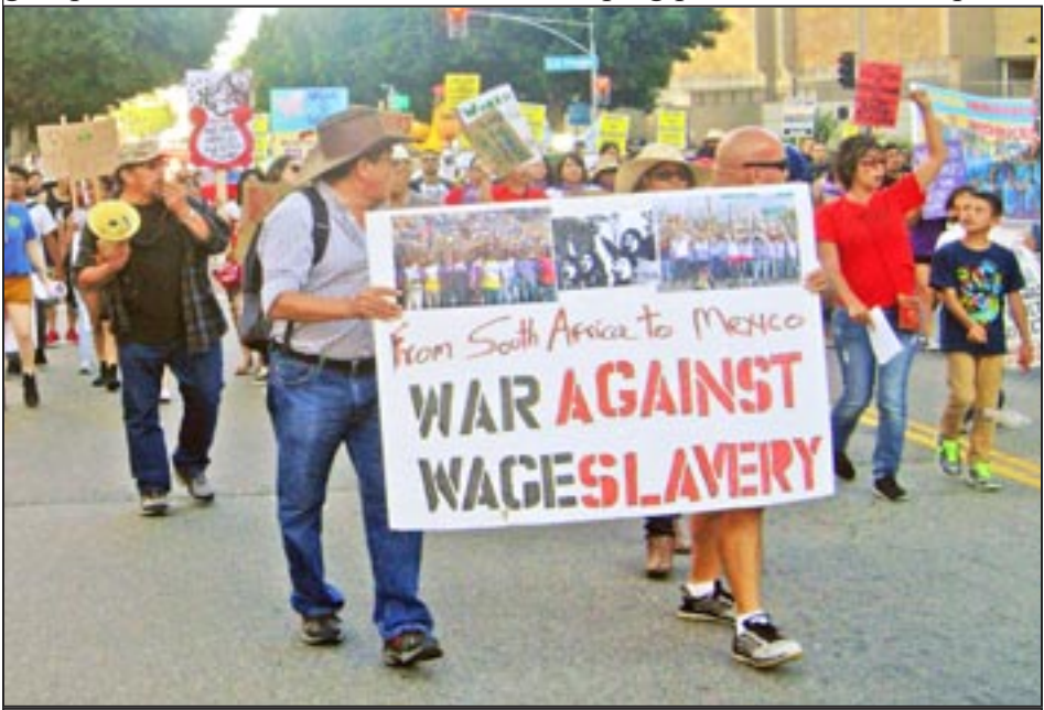
May Day Los Angeles, 2015

When we reflect on what’s missing in our own communist leadership, the word “commitment” comes up. Renewing our commitment to each other, to the party’s communist work, and to the bigger vision of a communist world is what will carry us forward.