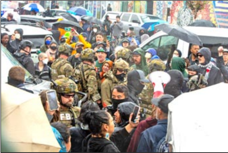
Minneapolis (USA) June 3—Community blocks ICE raid

all colors, Black, white and brown, came out to defend the community from the oppressors,” said a friend who was there. Elsewhere in the US, Haitian workers poured into Brooklyn (NY) streets and drove ICE out. Working class neighbors have rebelled in Denver, Chicago, and more. As a comrade told an immigrant worker who thanked her for protesting, “It’s the struggle of all of us.” “The masses are showing the way,” said another comrade. “With communist ideas, we can win!”