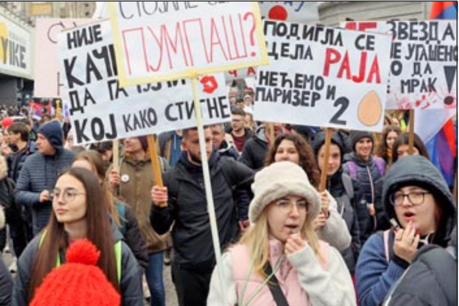
BELGRADE (Serbia), March 15 – Students led over 100,000 in protests against a government cover-up of last November’s deadly railway station disaster. And against the harsh repression of students and professors who rallied against it. Mass demonstrations across Serbia want to bring down the government. Serbia was once part of Tito’s socialist Yugoslavia. Then, workers were united across ethnic divides. But socialism was state capitalism. Those in today’s “Pump It” protests need to learn that only communist revolution can bring down corrupt capitalism. Only communist society can meet workers’ and students’ needs.

All workers, immigrants and native born, need to unite to defeat this growing fascism! —A friend