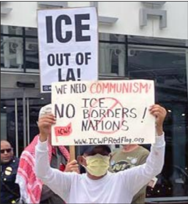
Santa Monica (USA) July 2025

The capitalists as a class need a passive, terrorized working class. They need to rob us to boost their profits and pay for expanding wars. They will try to force alienated young workers to fight in those wars. Don’t be fooled by Democratic mayors in Los Angeles, Chicago, and Boston who claim to “stand up to ICE.” It was President Obama who gave Homan his first leadership