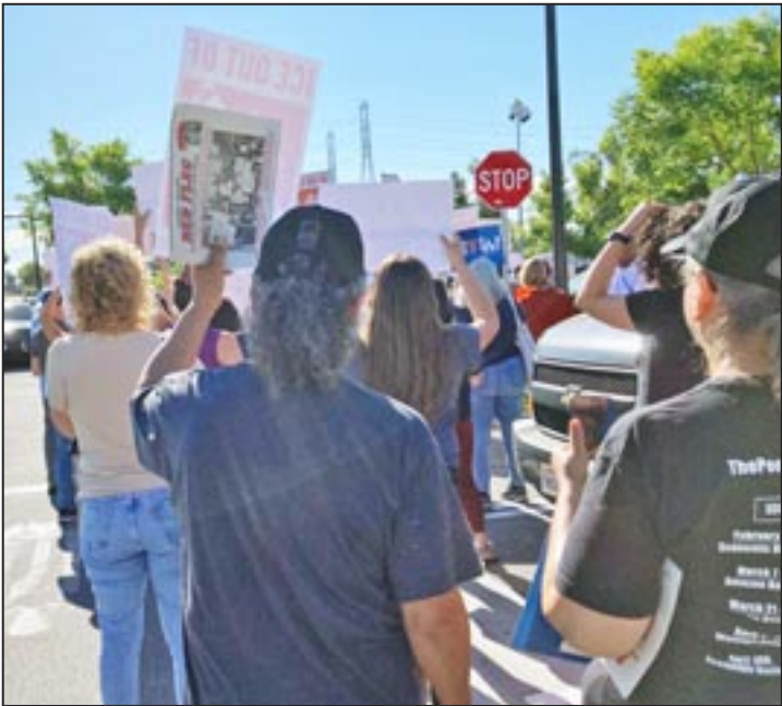
Pasadena (USA) July 2025