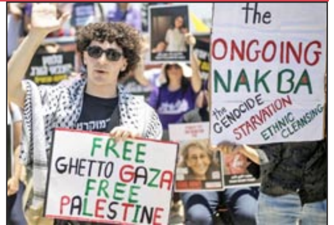
Israel Protest, June 2025—Israeli protestors on border with Gaza

Our party continues to distribute Red Flag to comrades in Israel. They are organizing the masses to end the horrors there and in the rest