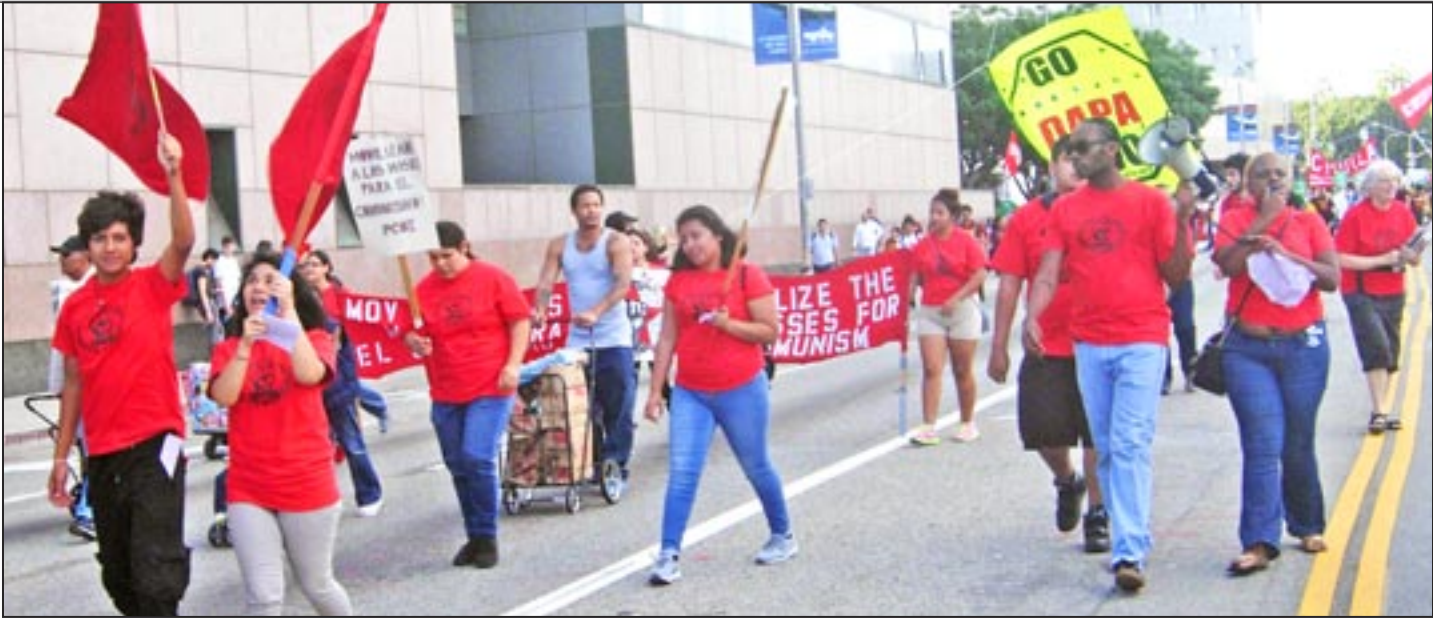
Young comrades give leadership to ICWP MAY DAY contingent 2015

One of the comrades leading one group shared how it is difficult to