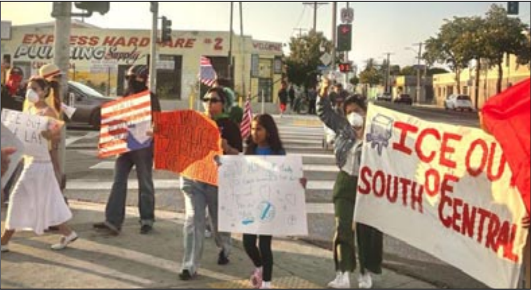
Los Angeles (USA) June 16, 2025

“The fascist attacks come in different forms around the globe: deportations, layoffs, cuts in vital social services and so on. Capitalists can only get out of this crisis by going to war with each other, using the sons and daughters of the working class. For the international working class, the answer is to