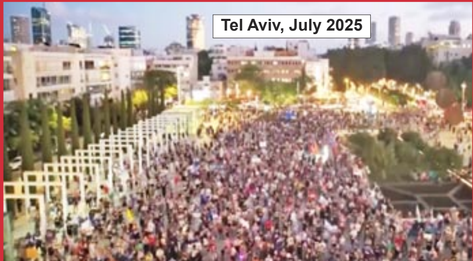
Tel Aviv, July 2025