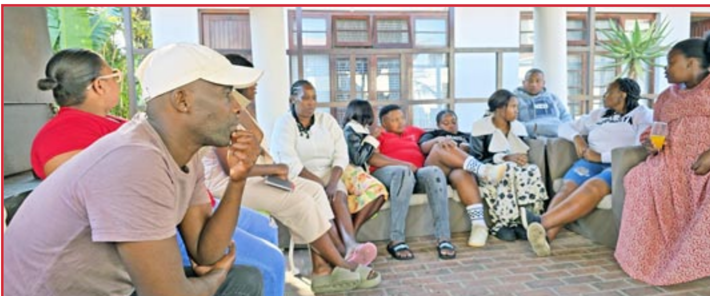
GQEBERHA (SOUTH AFRICA) Spring 2025

And that way we can consolidate him to the party. This is our struggle. This is my mission at work: to recruit workers, as many as I can, to join the party. That is what it means for me to be a communist leader.