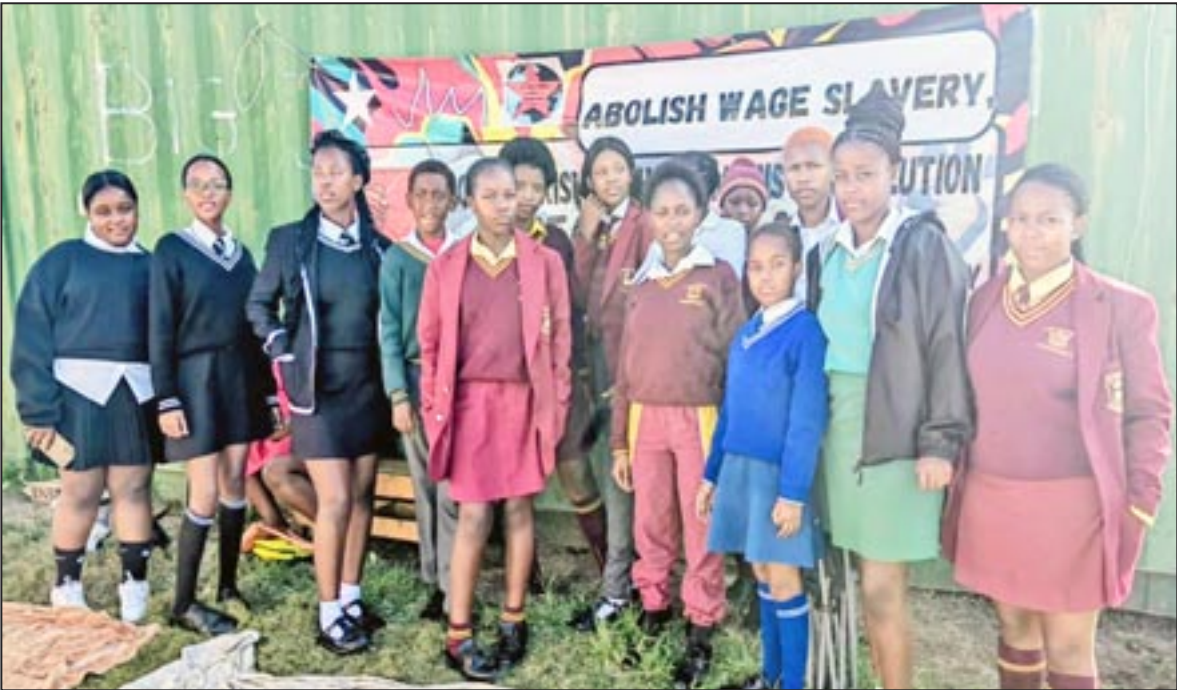
Young comrades in South Africa, Spring 2025

PLEASE SEND YOUR LETTERS, RESPONSES AND SUGGESTIONS TO ICWPREDFLAG@NYM.HUSH.COM