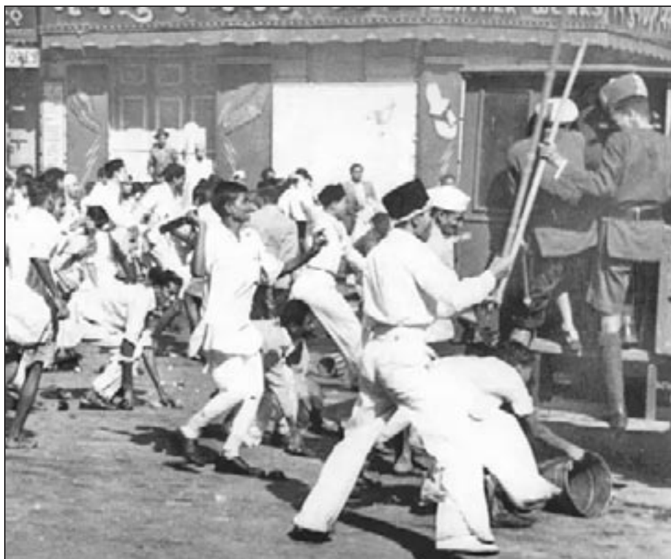
The Royal Indian Navy mutiny of 1946 spread to ten thousand sailors across India. The Communist Party of India was the only nationwide group to support this armed revolt against British imperialism.

By relying on soldiers, workers, and youth, the masses can and will end deadly imperialist wars and capitalism with communist revolution. That means building the International Communist Workers' Party. ICWP has confidence that by showing our friends, fellow activists, and the masses the true nature of deadly capitalism and the communist solution, they will join us in the fight of our lives: to end capitalism and build communism.