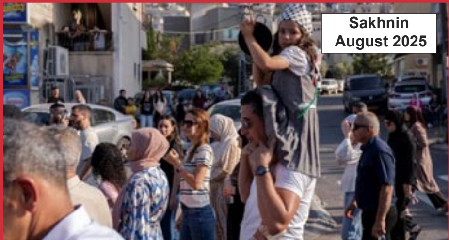
Sakhnin August 2025