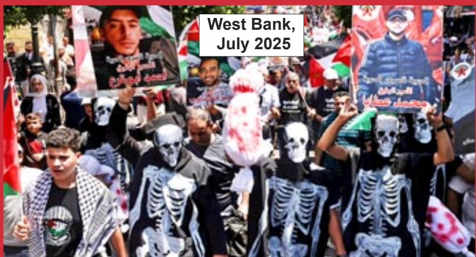
West Bank, July 2025

THE INTERNATIONAL COMMUNIST WORKERS' PARTY ★ WWW.ICWPREDFLAG.ORG