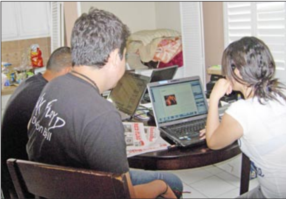
Young comrades working on Red Flag

Sometimes major class struggles or developments in inter-imperialist conflict need a more traditional expository style. There is a continuing discussion about how AI can be useful (or not) in helping to generate these. But we must always be aware of our main audience: new comrades and their friends around the world. And what they can learn about communism – beyond slogans – from our articles.