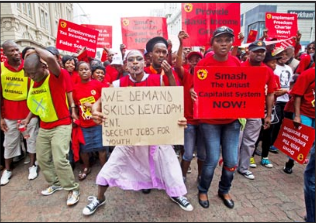
Unionized metalworkers demand jobs for youth, 2014

We went to collect the laptop. It so happened that the buyer knew me. He had, a long time ago, attended one of our May Day celebrations. And the petty criminal