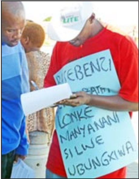
PORT ELIZABETH, (Now GQEBERHA), SOUTH AFRICA, 2015 “Workers of the world, unite for communist revolution!”