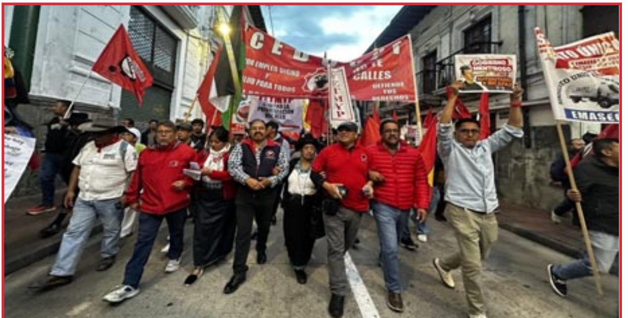
QUITO, ECUADOR, September 16, Masses protest President Noboa's anti-worker policies.

We need to fight for and build communism, where the masses worldwide will collectively produce everything needed for the dignified life we deserve, instead of producing for the murderous bosses' profits.