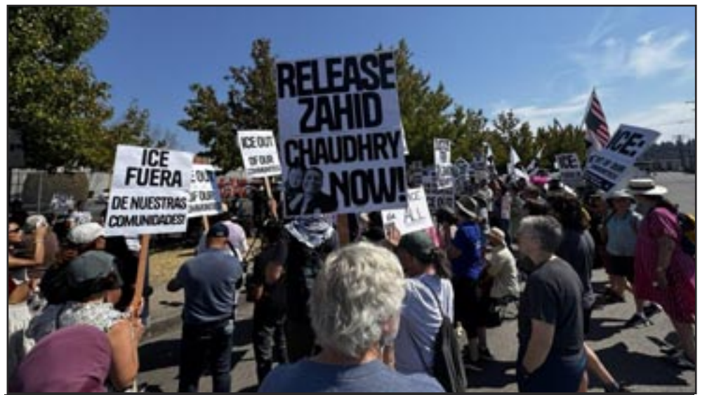
TACOMA (USA), September 1

We know that rallies and voting will not stop the fascist bosses’ plans for war and exploitation. We must get rid of capitalism. And to