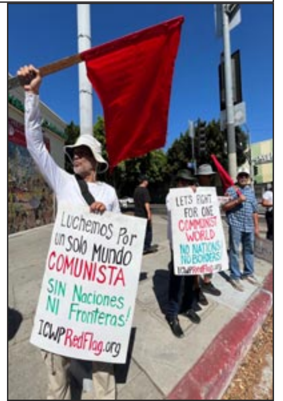
LOS ANGELES COUNTY (USA) September 1—Comrades distributed hundreds of copies of Red Flag and exchanged contact information with union members at the annual Labor Day Parade.