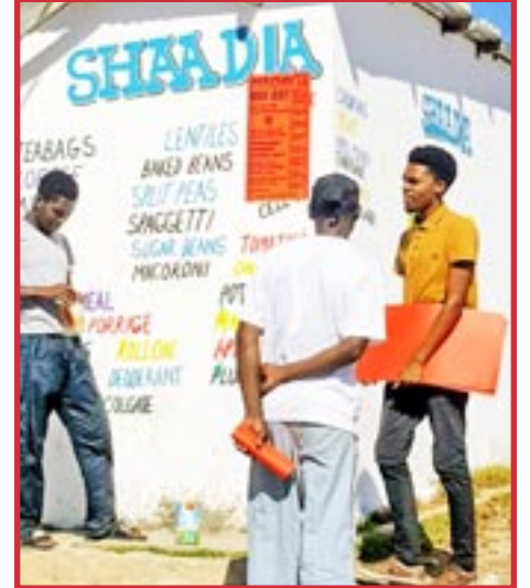
Organizing for May Day, 2017

in South Africa first-hand has helped me to understand that we must focus on learning from their practice today. Our communist political line, like everything else, is a process, not a final result. I, and other older comrades, must reflect more on how Red Flag and our practical work can advance by learning from the rich experiences in South Africa (and elsewhere).