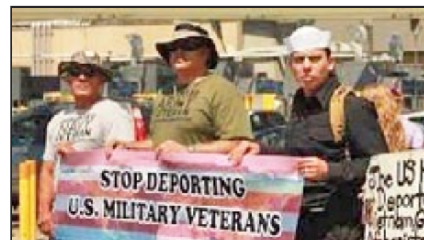
ARIZONA, USA, October 2024, Veterans protest deportations

Deportations affect families with relatives in the armed forces. In 2024, more than 40,000 non-citizens served in the US military. Another