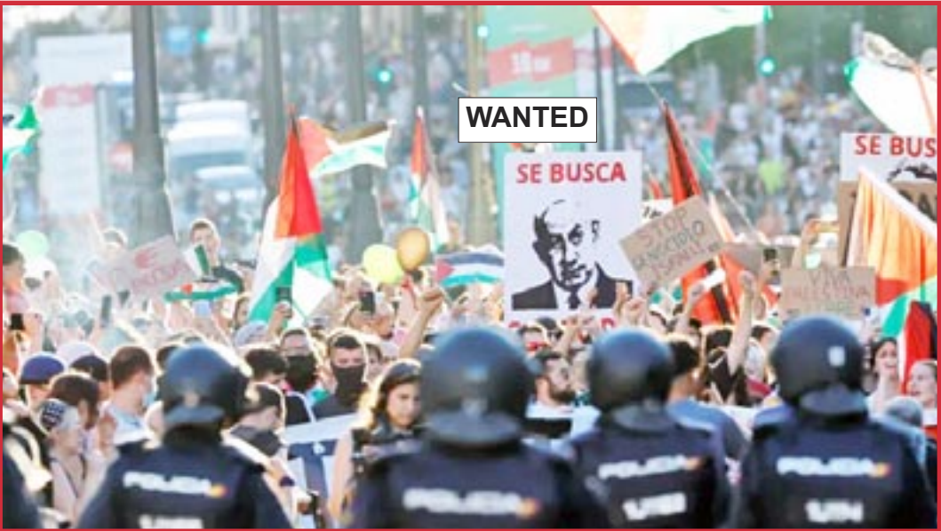
MADRID, SPAIN, September 14—Masses block finish line of Vuelta a España in protest of Israeli genocide

Fascist Zionism has never seemed stronger, but appearances are deceiving. Its contradictions are sharpening. The tensions with the US over the Doha bombing are one example.