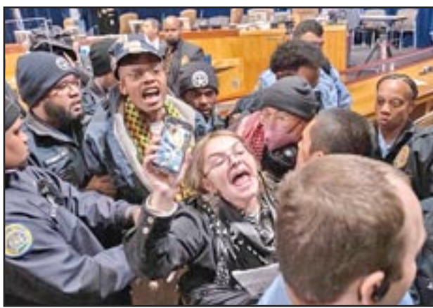
NEW ORLEANS, LOUISIANA