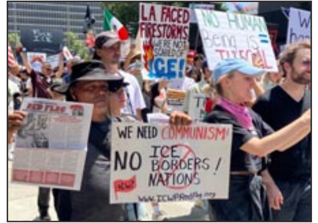
LOS ANGELES, CALIFORNIA

USA— Fascist immigration enforcement is spreading racist terror to cities and towns across the USA. A law passed last summer gave federal agencies $170 billion (₹15 Arab 152.6 crore or R28.8 billion) for masked agents to assault, hunt down, kidnap, and deport people based on their color, language, or workplace. But the masses' anger is spreading even faster. Community groups organize patrols to warn neighbors when ICE is near. Legal assistance, food, and other support. In New Orleans, protesters disrupted a City Council meeting. Comrades involved in such groups find that many new activists like Red Flag and take it seriously. They understand that we can't rely on laws and courts. They are learning to organize and lead. We need to help them see that only communism can tear down all walls, erase all borders, and allow us to build a new world where all workers are welcome everywhere.