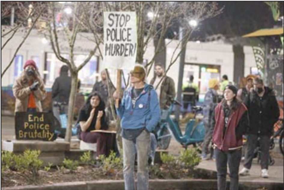
SEATTLE (USA), December 7—A multiracial group protested at Othello Station on December 3, where, on the previous day, cops had fired twenty-four bullets, killing a Black man. Comrades of the International Communist Workers’ Party participated. Two days later, ICE kidnapped a migrant worker nearby. By Sunday, ICE had stationed at least four cars of masked men in Othello Park. They eventually had to leave as community members began to arrive with gas masks, helmets, and a megaphone. Friends, comrades, and Boeing workers joined two rapid-response networks in this very integrated working-class neighborhood.

Communism is a system in which the working class collectively runs society and production for use. Discussion about the necessity of spreading international com-