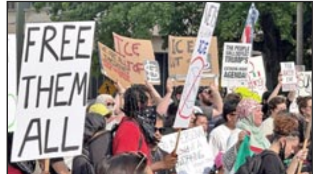
ST. LOUIS, MISSOURI

USA— Fascist immigration enforcement is spreading racist terror to cities and towns across the USA. A law passed last summer gave federal agencies $170 billion (₹15 Arab 152.6 crore or R28.8 billion) for masked agents to assault, hunt down, kidnap, and deport people based on their color, language, or workplace. But the masses' anger is spreading even faster. Community groups organize patrols to warn neighbors when ICE is near. Legal assistance, food, and other support. In New Orleans, protesters disrupted a City Council meeting. Comrades involved in such groups find that many new activists like Red Flag and take it seriously. They understand that we can't rely on laws and courts. They are learning to organize and lead. We need to help them see that only communism can tear down all walls, erase all borders, and allow us to build a new world where all workers are welcome everywhere.