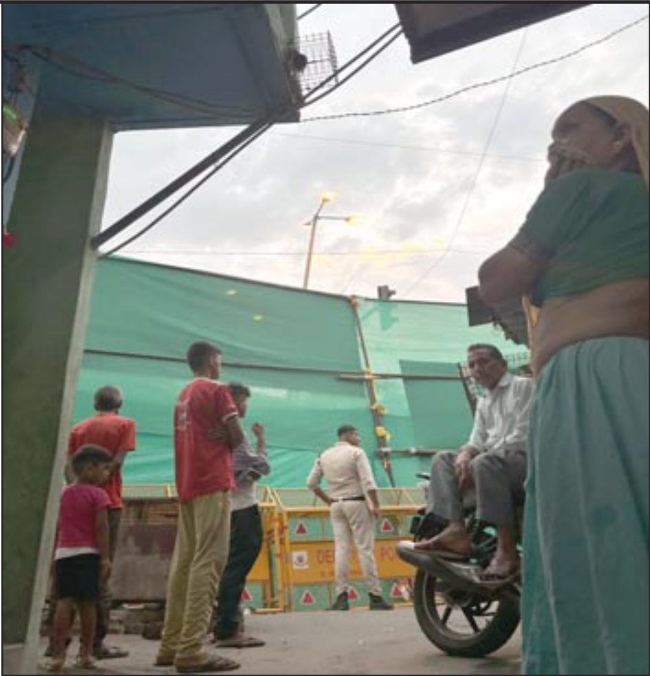
New Delhi (India), 2023— Fascist Prime Minister Modi had green fabric barriers erected to hide vast areas of working-class housing. That way, imperialist leaders attending the G20 Summit didn’t have to confront the grinding poverty their system creates.

The thick, toxic clouds in India won’t be lifted by Putin, Modi, or Trump. Only the working class, led by ICWP, fighting for communism to end the wage system, will pave the way for clearer air. We don’t need millions of cheap cars that