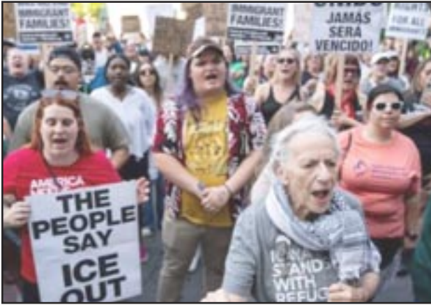
DES MOINES, IOWA