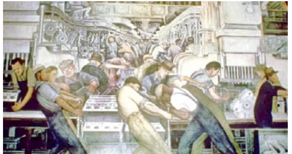
Mexican muralist Diego Rivera portrayed workers in a Detroit (USA) auto factory.

Faced with this fascist situation, the bosses and their rulers have two tasks: 1) To contain the advance of the competing bosses and 2) To contain the discontent of the work-