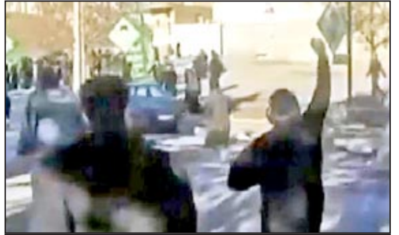
Iran, January 3— Demonstrators in the Malekshahi district of Ilam Province, where government forces opened fire.

ICWP rejects imperialist interference that instrumentalizes the suffering of the Iranian people for its own geopolitical interests. And we reject the false alternative offered