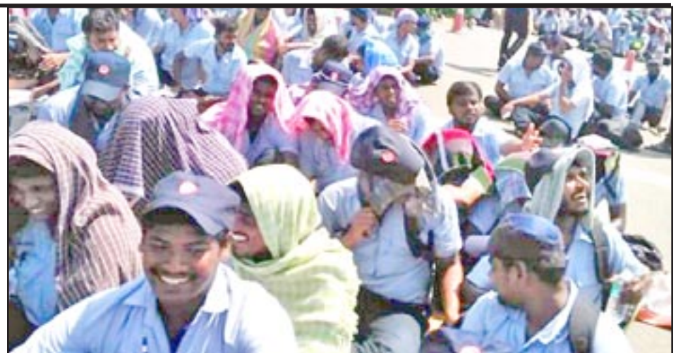
Chennai, India: Auto Strike, October 2018

The US capitalist class cannot allow Chinese capitalists to invest in the US or Chinese cars to invade the US market. Unlike Europe and Japan, Chinese workers overthrew imperialists in 1949. Socialism brought state capitalism there. China’s new capitalist class has become an imperialist power, displacing US domination and production worldwide.