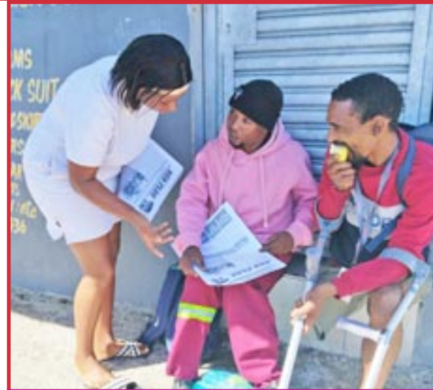
KORSTEN SOUTH AFRICA, MARCH 28, 2026

We chose Korsten because it is not only an industrial town here in Gqeberha, but it is also a town full of immigrants. There are more immigrants than locals in this town. Immigrants from all of Africa and some countries in the Middle East, particularly Pakistan and Bangladesh.