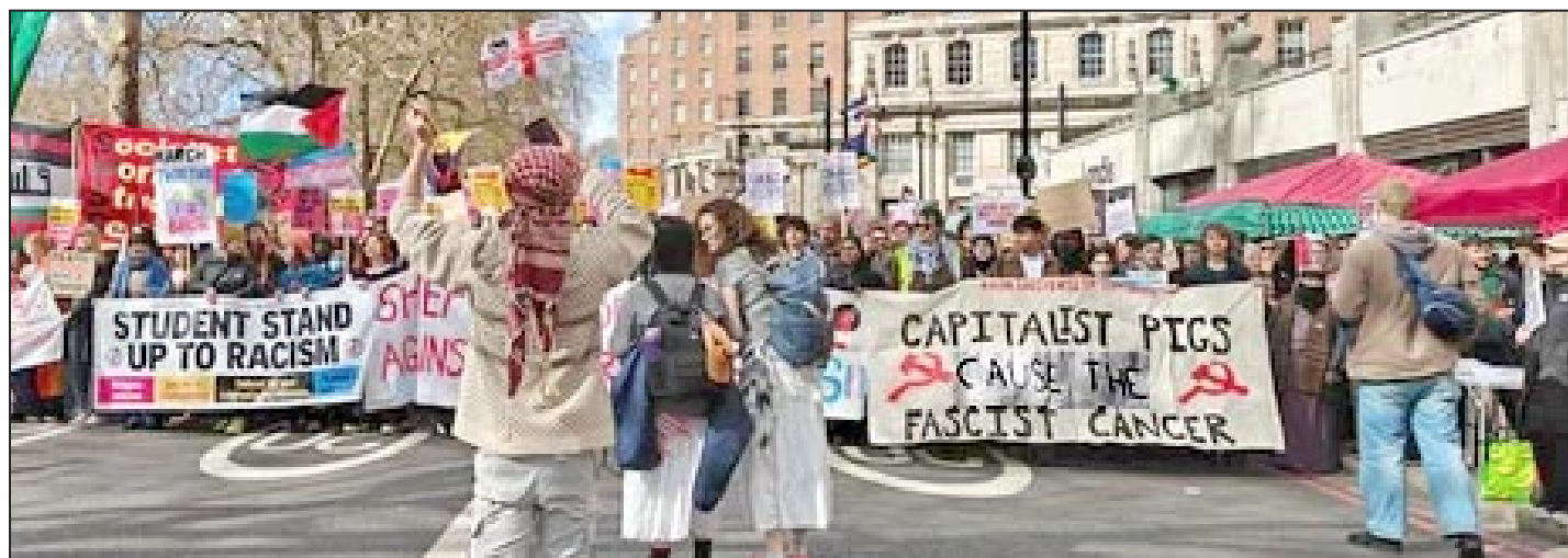
LONDON (England), March 28- Hundreds of thousands march against the racist and fascist “Far Right.”

As World War III expands, fascist terror escalates, and masses fight back – let’s make this May Day a clarion call for communism and nothing less!