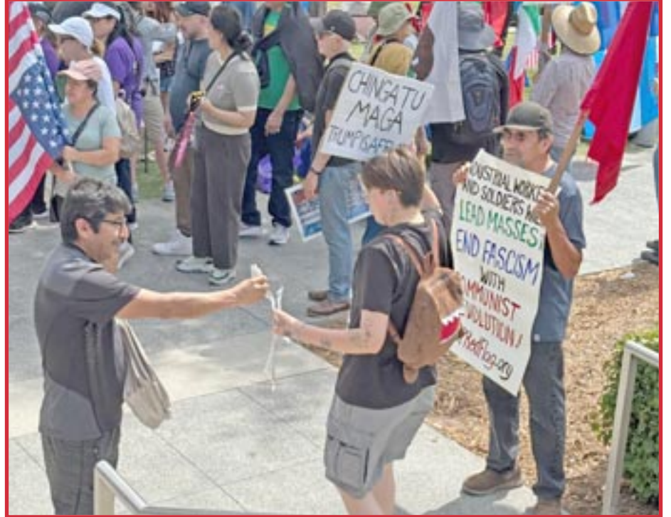
Above: Los Angeles

The first-time distributor said she learned from that how to look for and sharpen the internal contradictions of people we approach. “A dialectical perspective is necessary,” another comrade explained. “The boss-led movement allows us an opportunity to unite with angry masses.