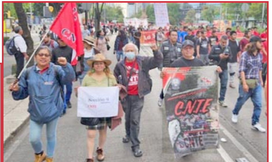
Below: Mexico City

MEXICO CITY, March 29 –The CNTE, a national union of education workers and teachers, held a 72-hour strike from March 18 to 20, 2026. Comrades from the International Communist Workers’ Party were present, distributing our communist literature.