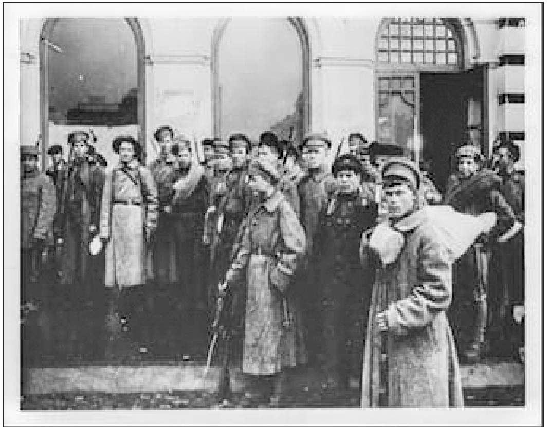
Industrial workers in Soviet Russia form Food Brigade

“war communism.” Its key was a state grain monopoly. It would requisition agricultural surplus from peasants and ration food for the urban population.