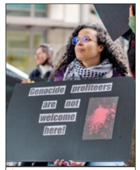
SEATTLE, USA, March 18, 2026

Imperialist war and ICE are threatening our comrades and friends. We are learning the necessity of mobilizing masses and exposing the lies that go along with war. The political battles in the factories and in these meetings are very useful in developing communist relationships with industrial workers. Sometimes it seems difficult, but now is the time to fight for communist recruits to the ICWP.