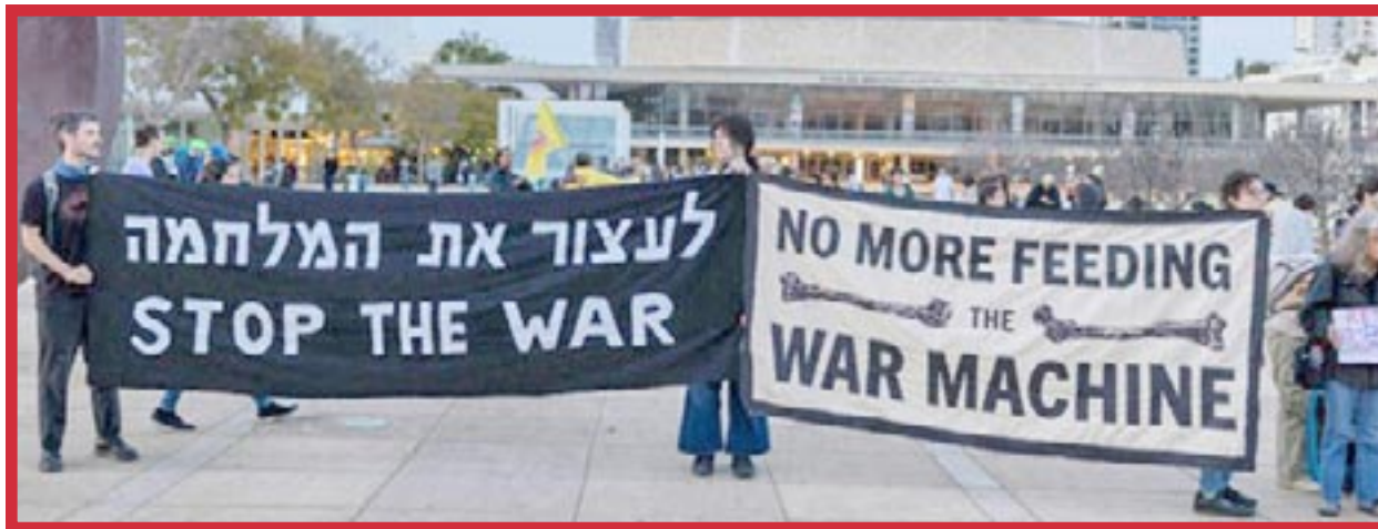
TEL AVIV, OCCUPIED PALESTINE March 31, 2026