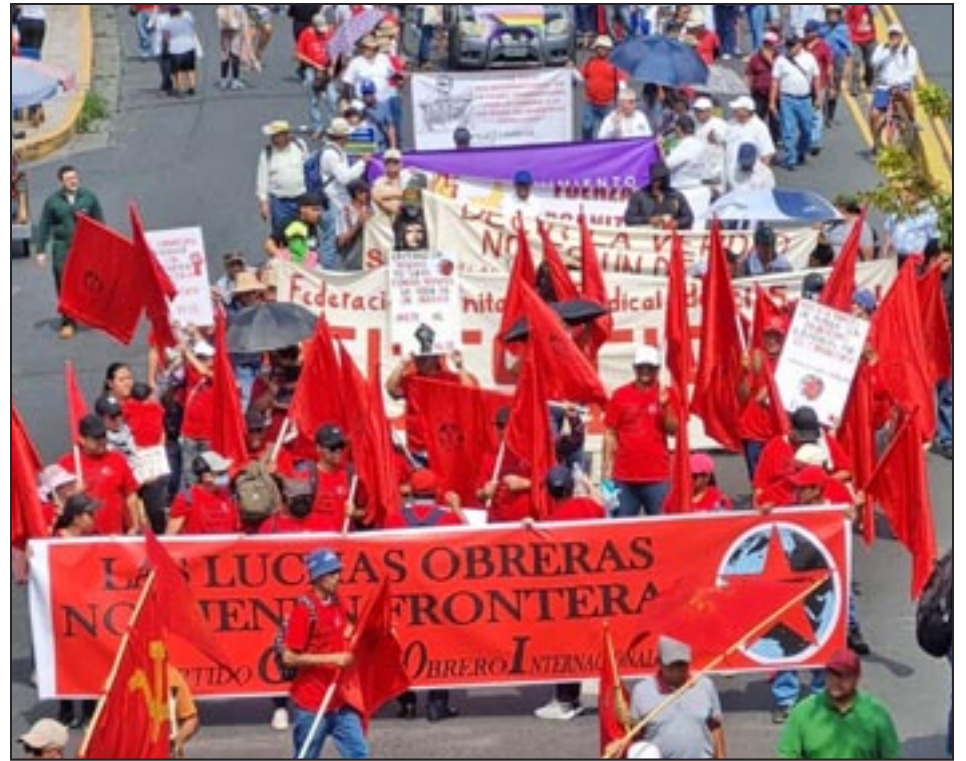
MAY DAY San Salvador, 2025 Workers’ Struggles Have No Borders

All of this stems from US imperialism’s economic interests. Just as was the case with its intervention in Venezuela, where it sought to secure oil supplies, only to later attack