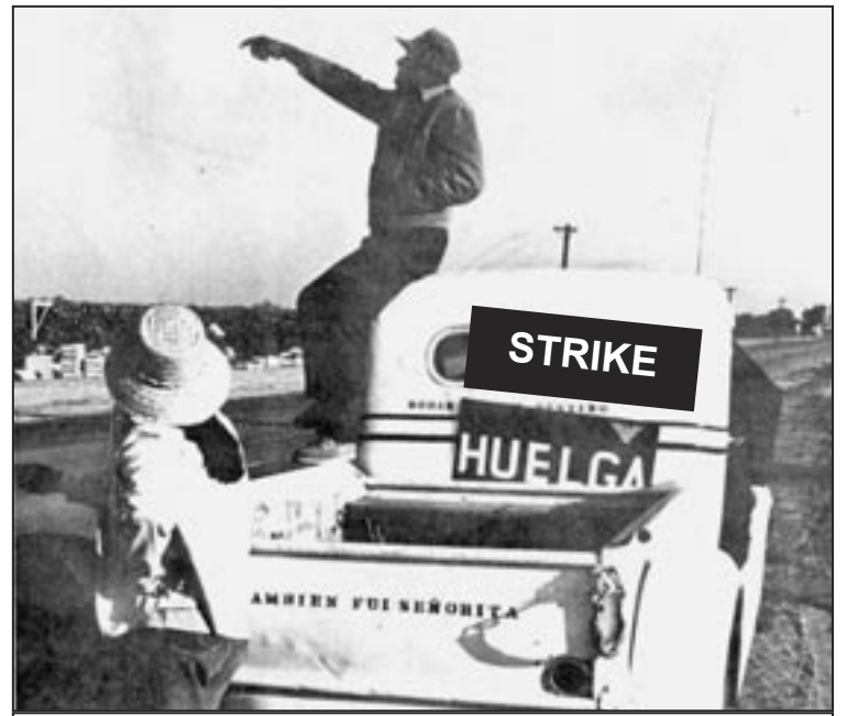
Delano, CA USA, 1965—Comrade Camacho calling out scabs

Under the corrupt leadership of Chavez and Huerta, all the reforms won by the mass militancy of farm workers during the 1960s and 70s